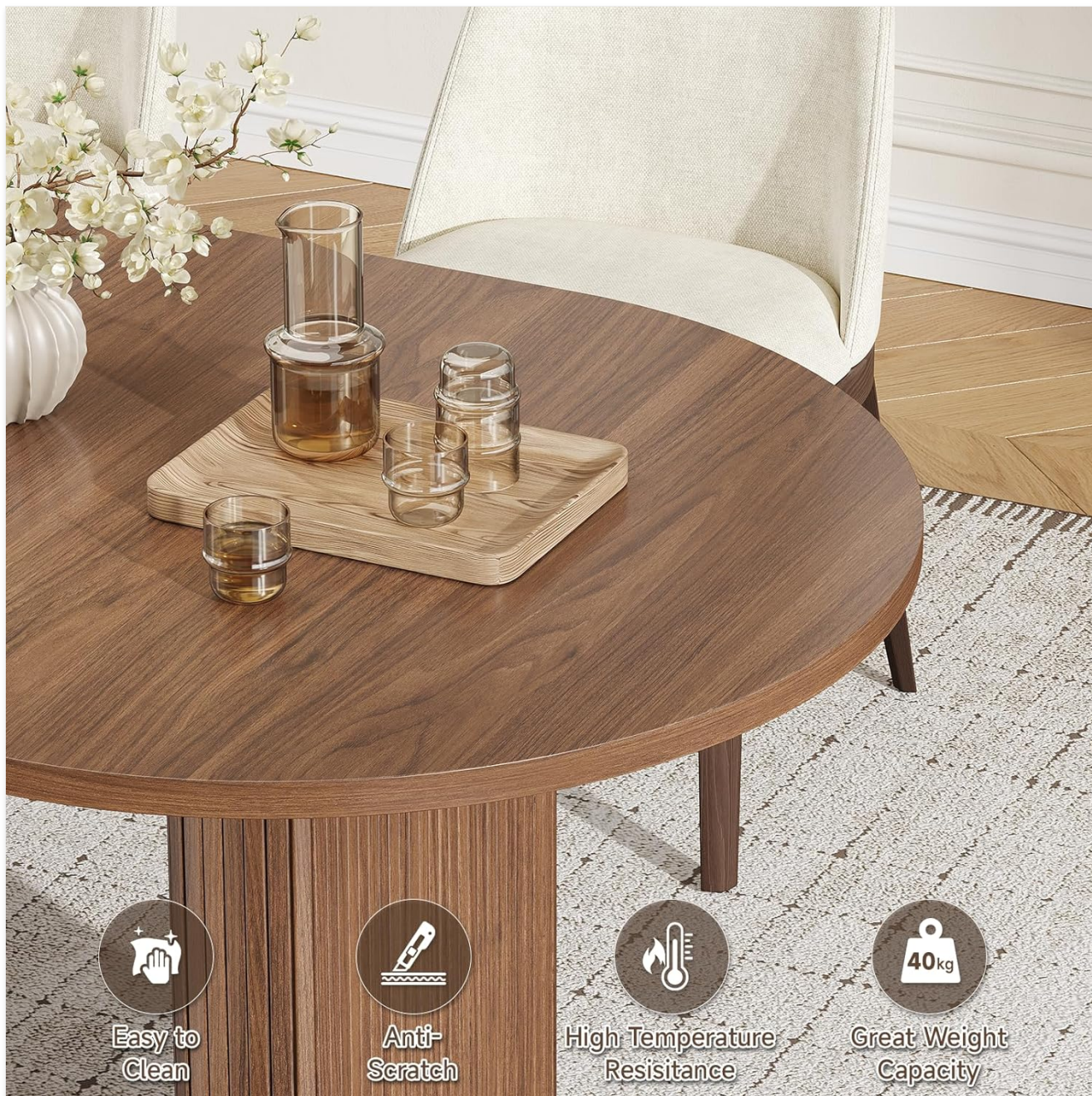
Image 4: A close-up view of the ONBRILL dining table's surface, highlighting its key features: easy to clean, anti-scratch, high-temperature resistance, and great weight capacity (up to 40kg).