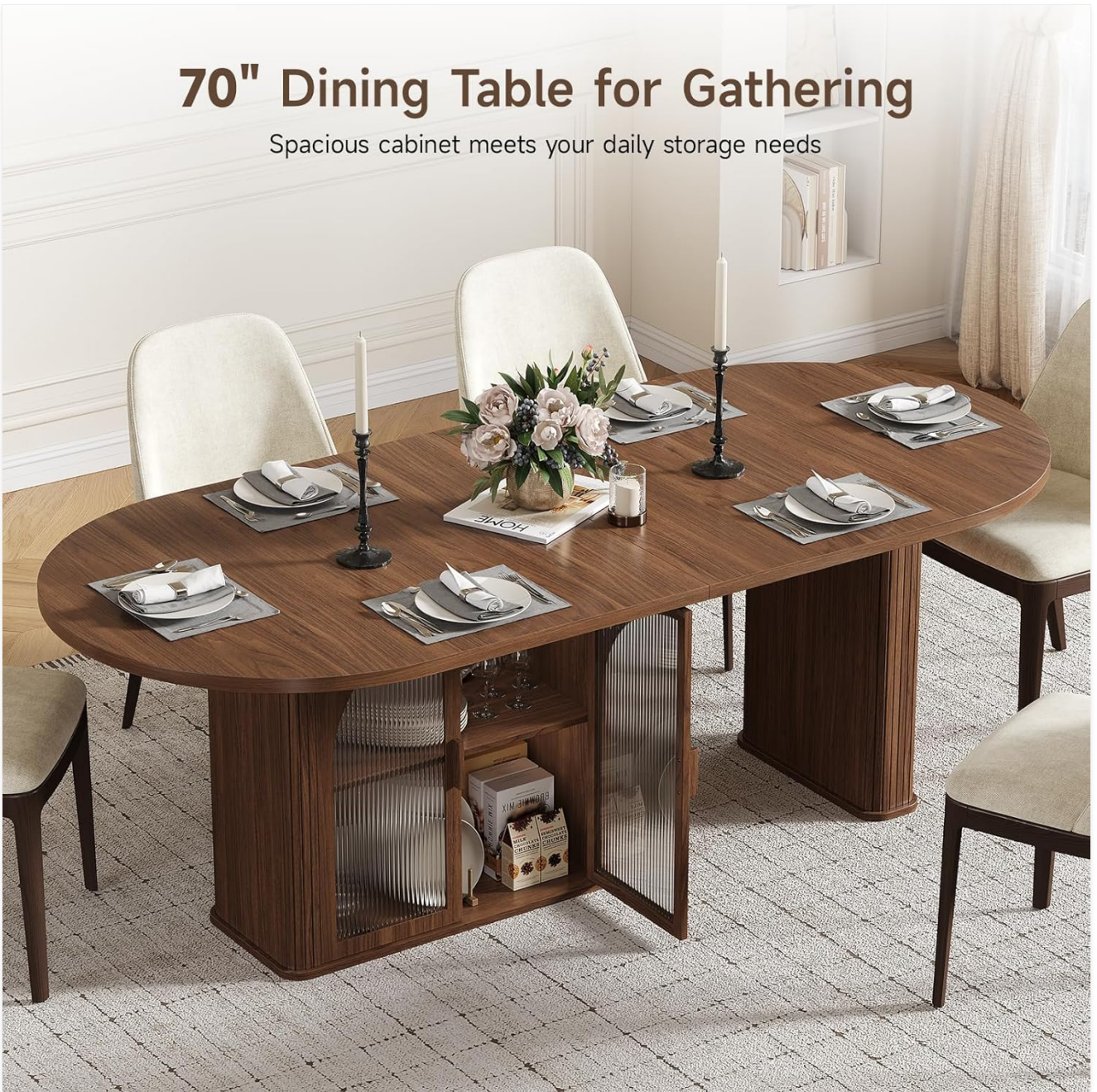
Image 2: The ONBRILL 70 Inch Oval Dining Table arranged for a gathering, showcasing its spacious tabletop and the open 2-tier storage cabinet in the base, which holds various dining items.

Spacious cabinet meets your daily storage needs