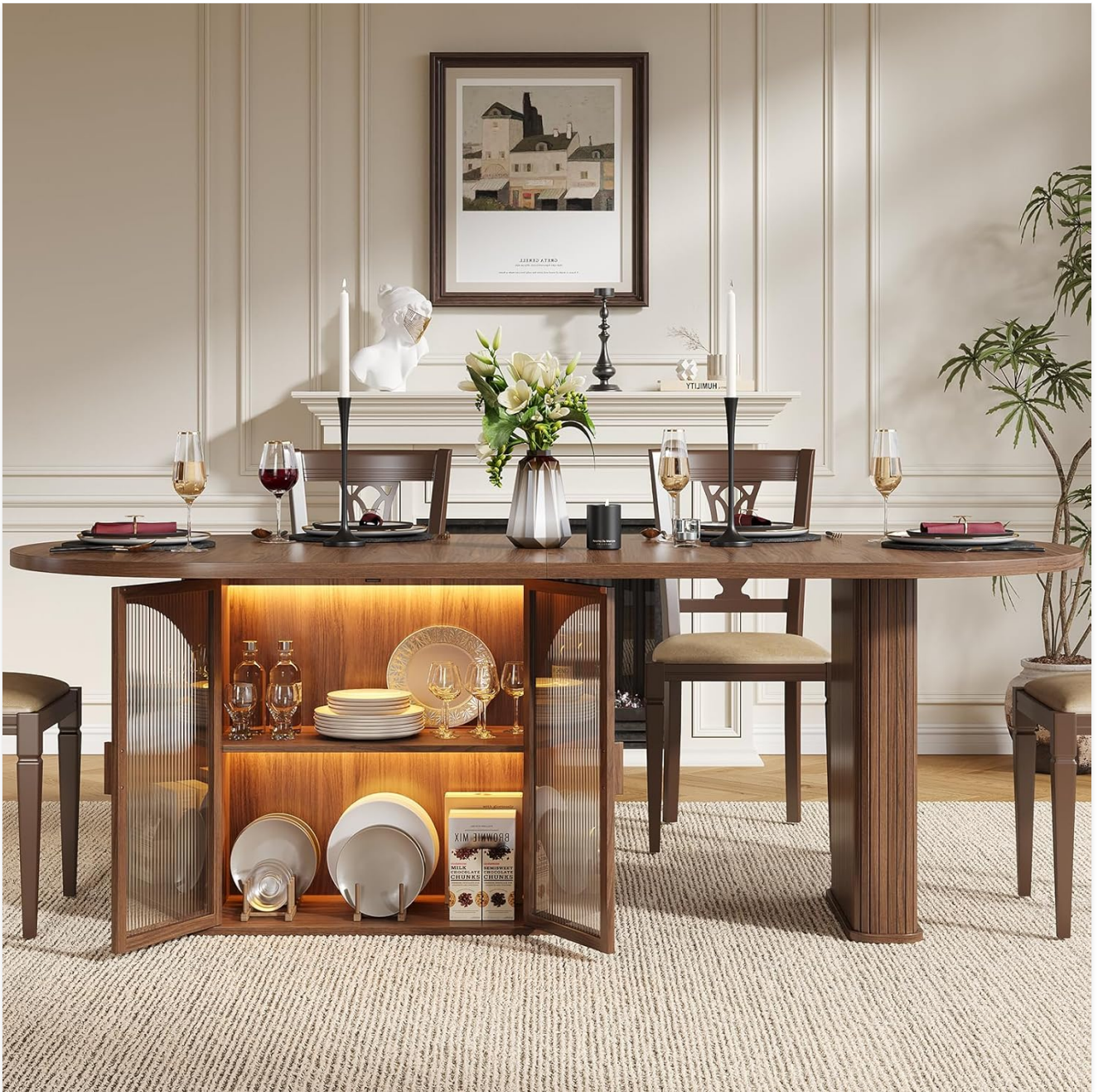
Image 3: The ONBRILL dining table with its integrated LED light turned on, illuminating the contents of the 2-tier storage cabinet through the transparent wave glass doors.