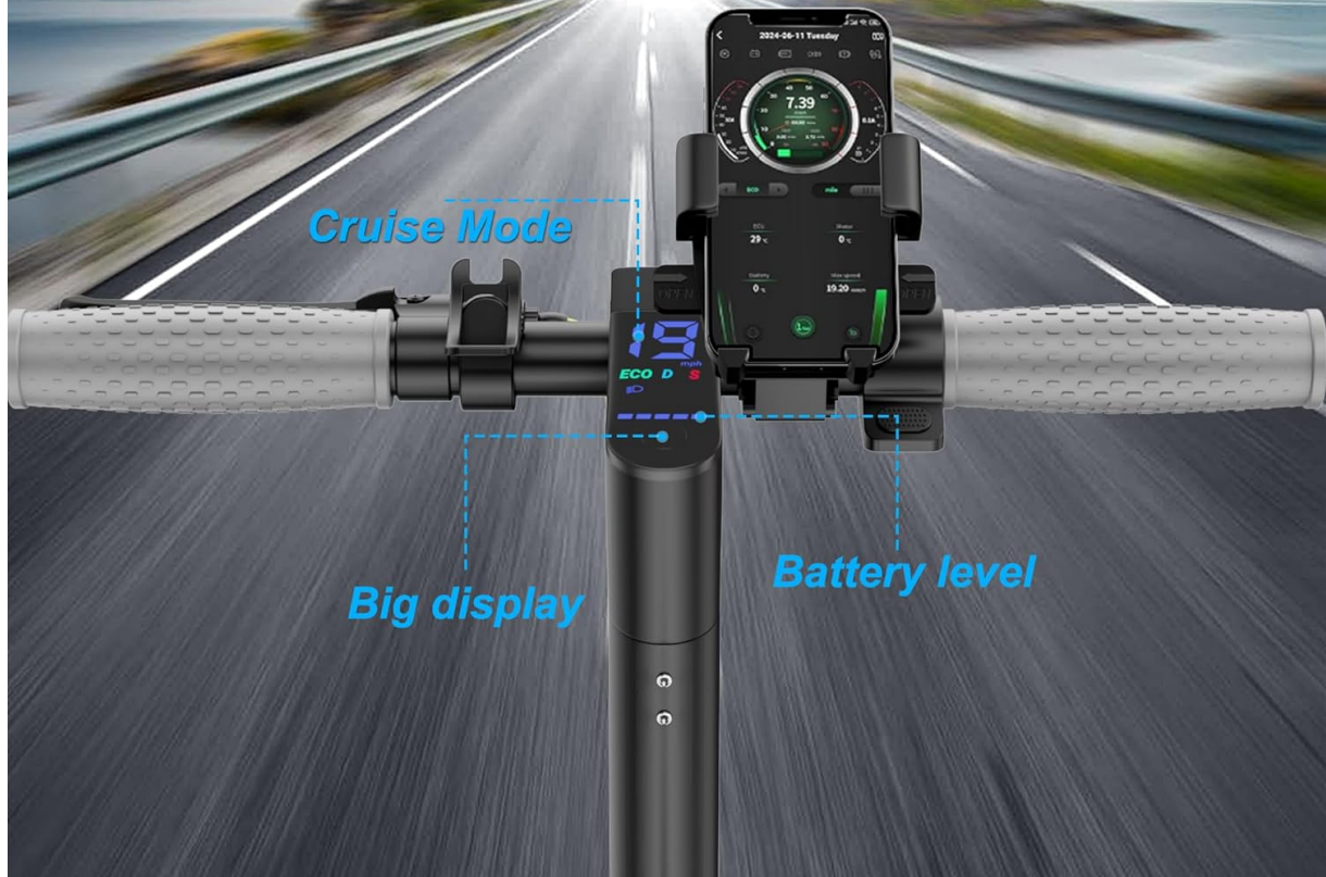
The scooter's handlebar display and smartphone mount, highlighting smart app integration for monitoring speed, battery, and riding modes.