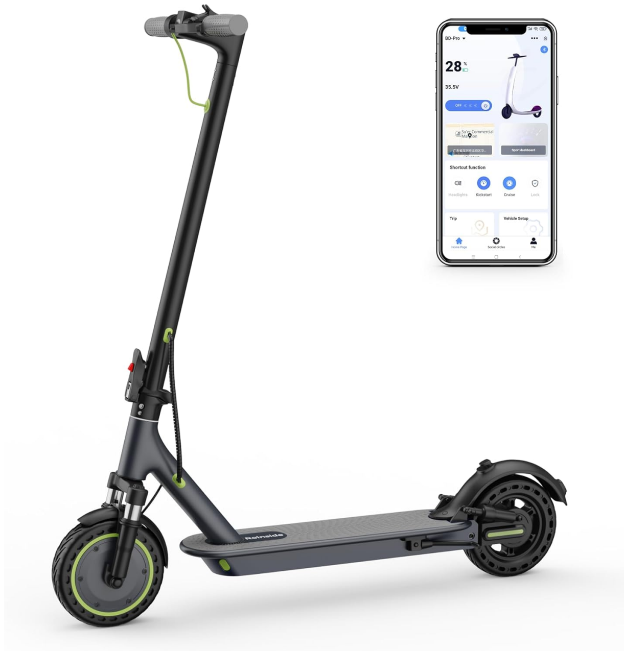
The Roinside Electric Scooter UP8Pro, showcasing its sleek design and ready-to-use configuration.