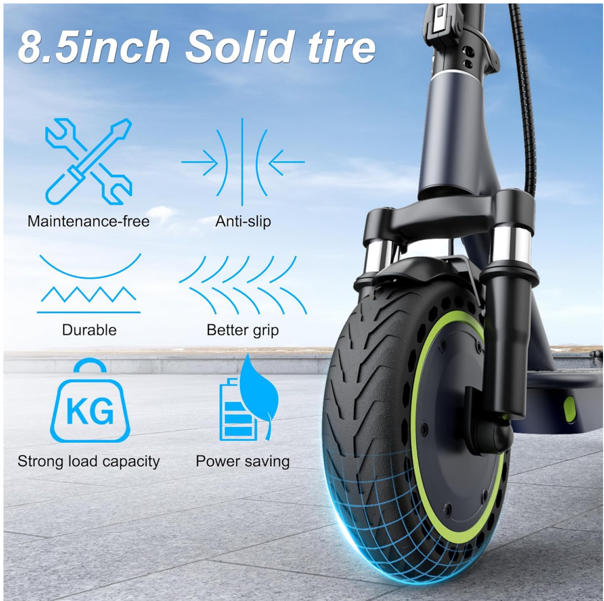
Detail of the 8.5-inch solid tire, emphasizing its robust construction and benefits like durability and energy efficiency.