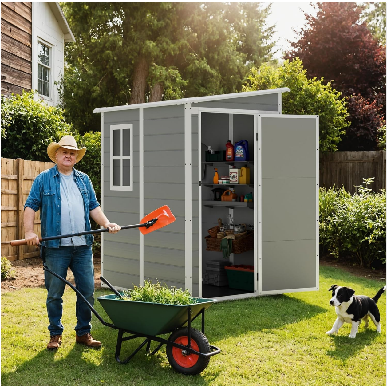
Image 1.2: Illustration of the shed's all-weather resin material, emphasizing its waterproof and UV protection features for outdoor durability.