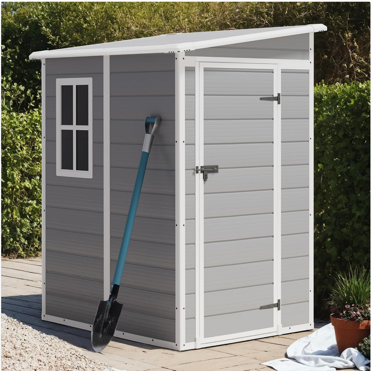
Image 3.1: Detailed view of the shed's design elements, including reinforced corner protection, a bright translucent window for natural light, a secure lockable latch, and the robust double-layer resin material that resists distortion.