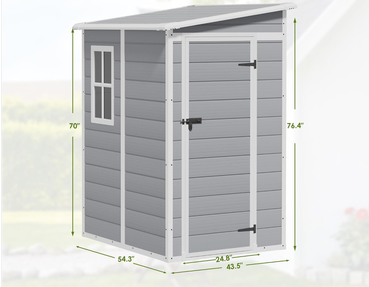
Image 4.1: The Greesum 5x4FT Plastic Outdoor Storage Shed positioned in a backyard, demonstrating its practical use for storing various items and blending into an outdoor environment.