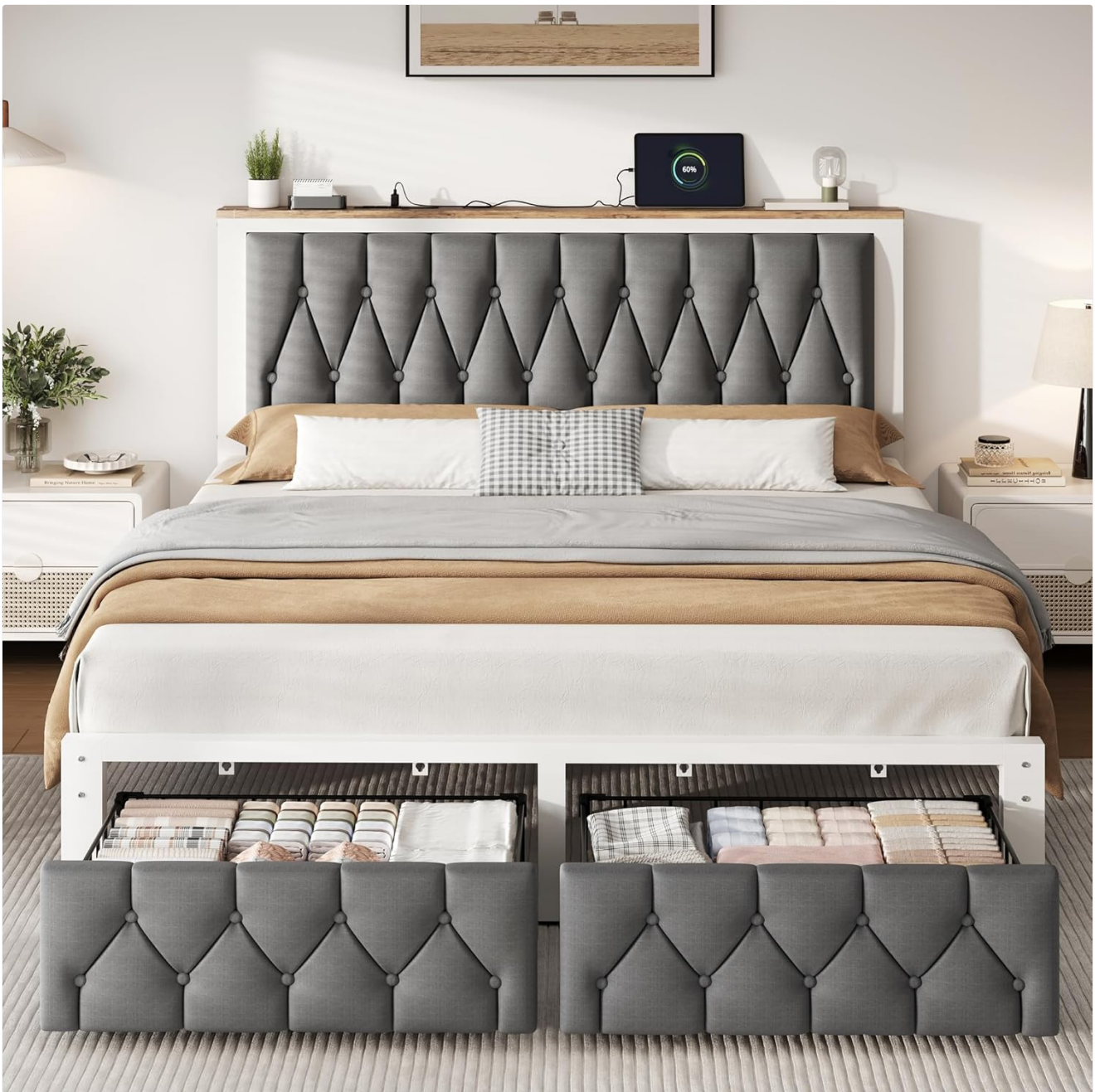
Image: An overview of the Decofy Queen Bed Frame, showcasing its grey upholstered headboard, integrated charging station, and two under-bed storage drawers.