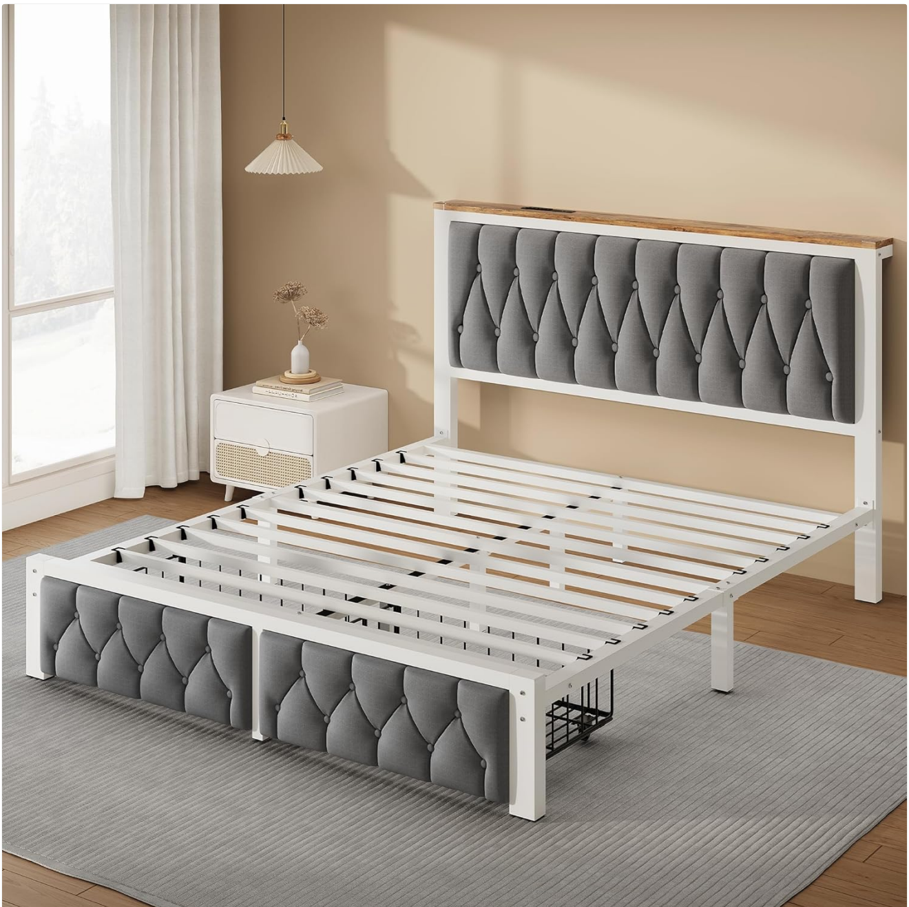
Image: View of the bed frame without a mattress, clearly showing the metal slat support system and the empty frames of the under-bed storage drawers.