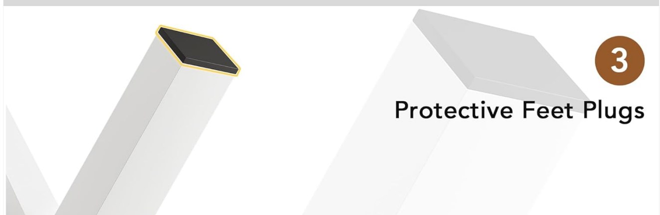
Image: Illustrations highlighting the raised footboard design to prevent mattress sliding, EVA strips for noise reduction, and protective feet plugs for floor protection.