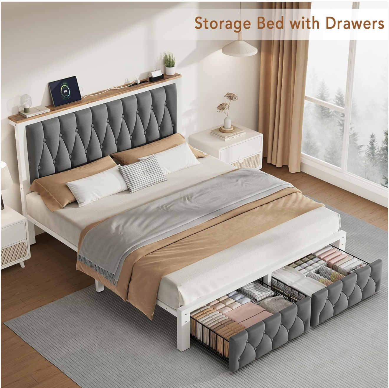
Image: The bed frame with its two spacious under-bed storage drawers pulled out, demonstrating their capacity for organizing various items.