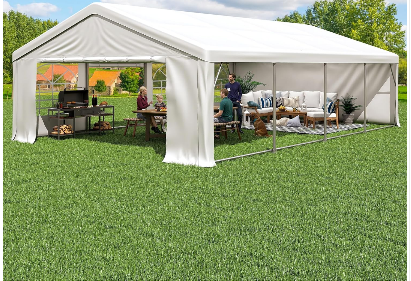
Image 1.1: The Raysfung 20' x 29.5' Party Tent, ideal for various outdoor gatherings.