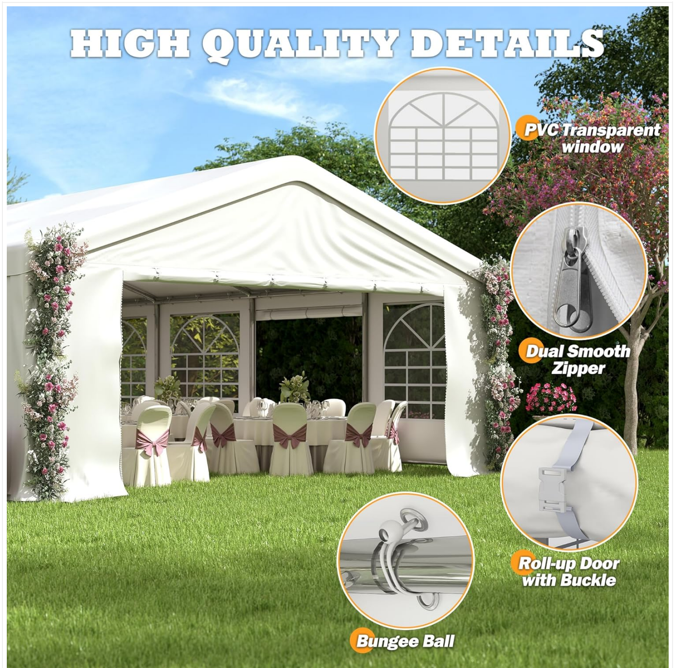
Image 5.1: Key operational features: PVC windows, zippered doors, and bungee ball fasteners.