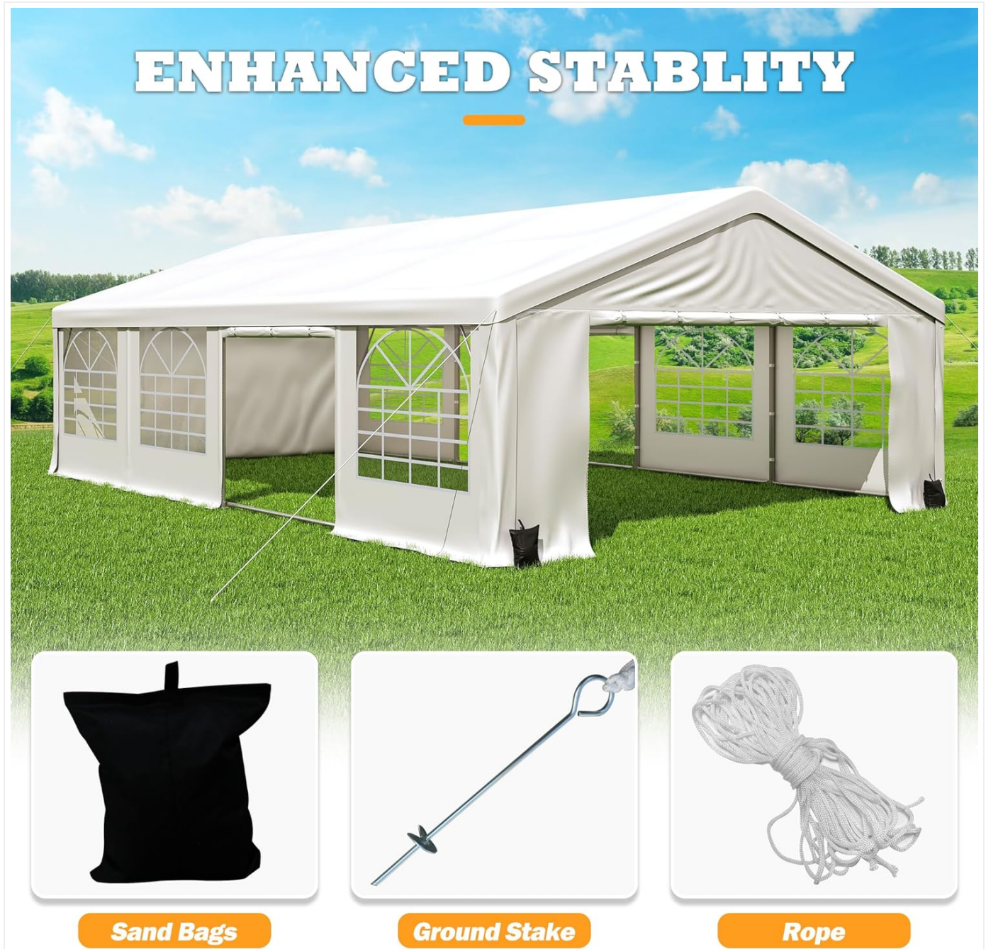
Image 4.2: Essential accessories for enhanced stability: sandbags, ground stakes, and ropes.

Video 4.1: A time-lapse video demonstrating the assembly process of a similar Raysfung party tent. This video provides a visual guide to the steps outlined above.