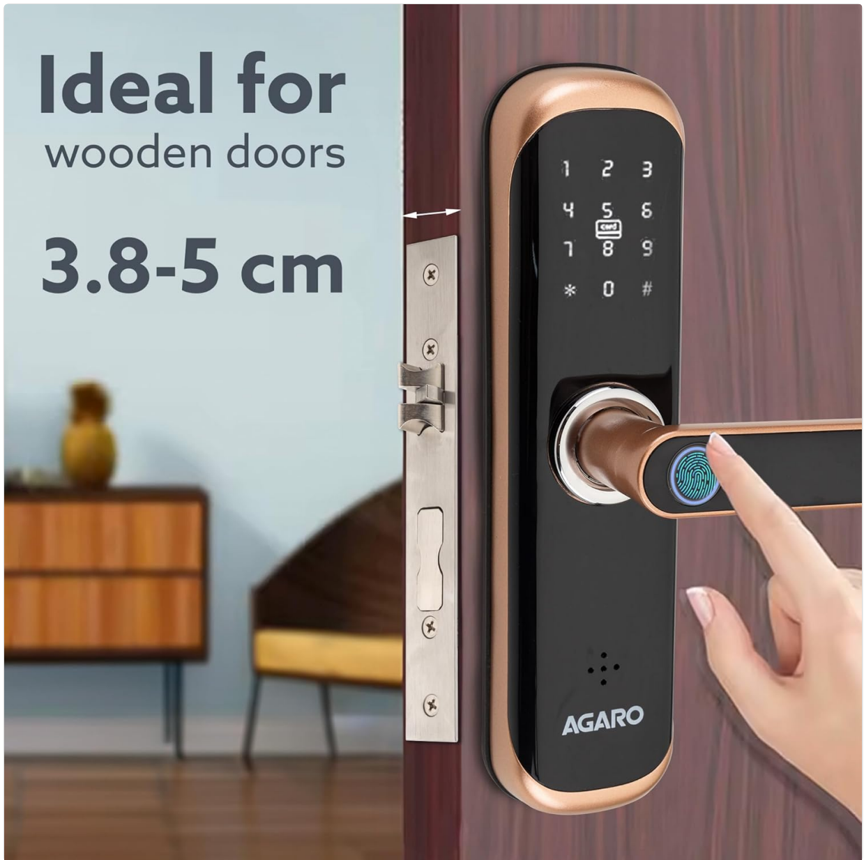
Image: The smart door lock is ideal for wooden doors with a thickness of 3.8 to 5 cm.

The handle is reversible, allowing installation on both left and right-handed doors. Professional installation is recommended to ensure proper functionality and security.