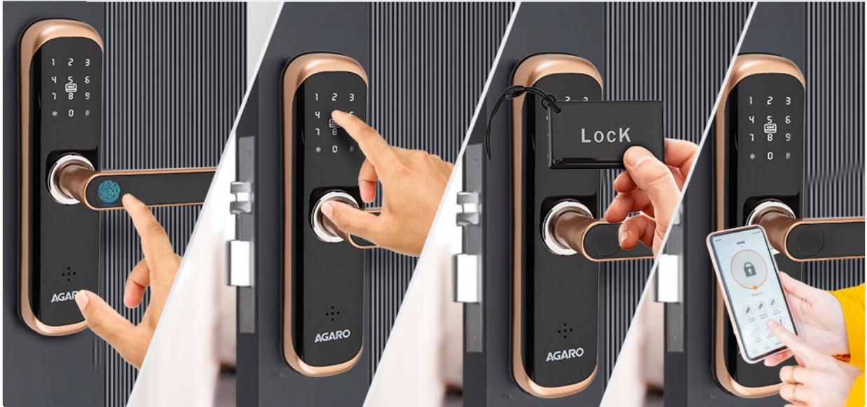
Image: Demonstrates the various convenient access options available with the smart lock.