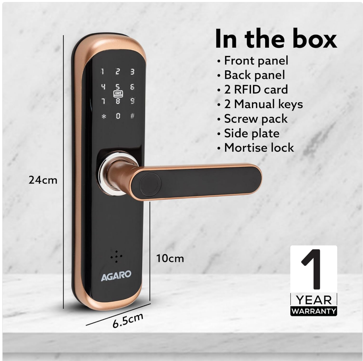
Image: All components included in the AGARO Grand Smart Door Lock package.