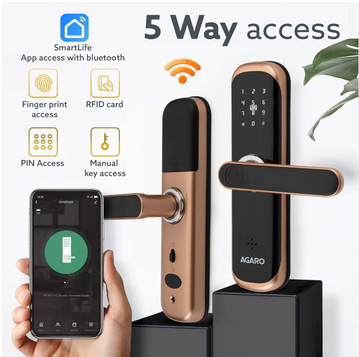
Image: The AGARO Grand Smart Door Lock offers five distinct access methods: App with Bluetooth, Fingerprint, RFID card, PIN Access, and Manual key access.