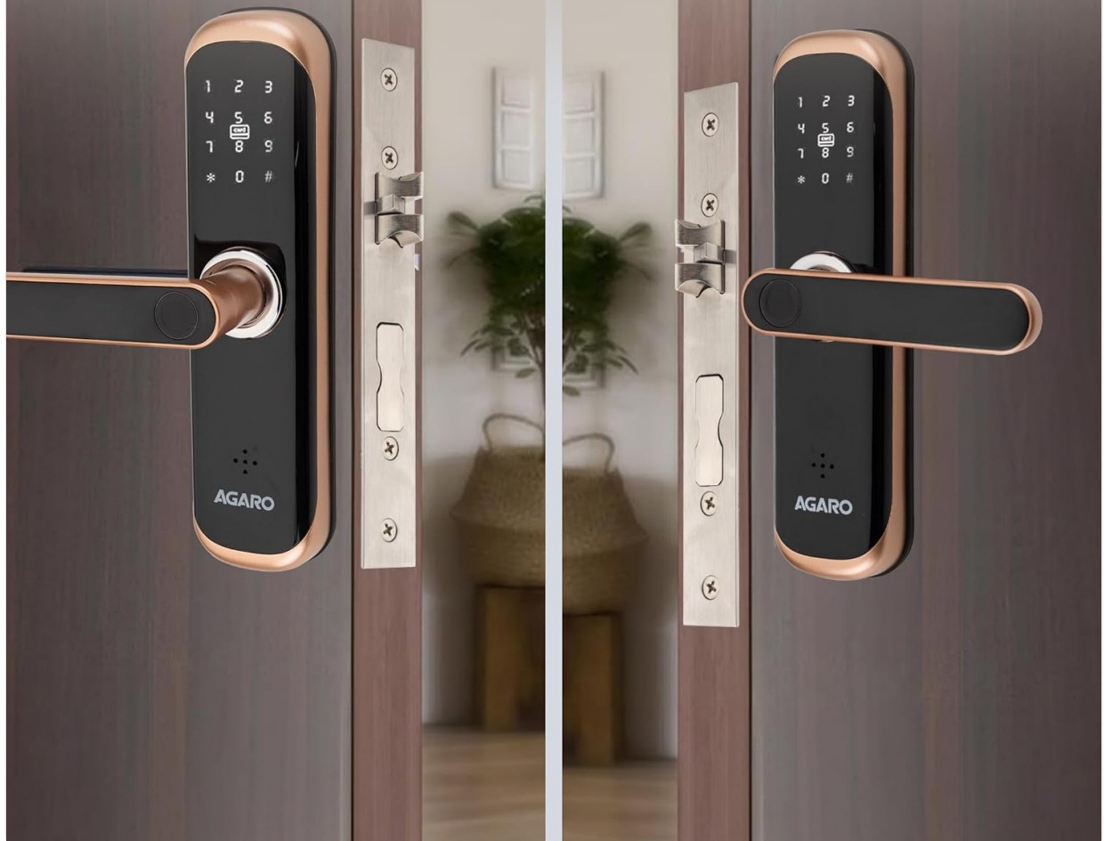
Image: The reversible handle design allows for installation on either left or right-handed doors.