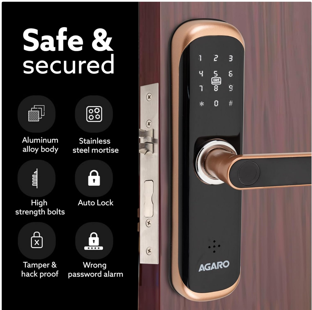
Image: Overview of the lock's robust security features, including tamper and hack-proof design and wrong password alarm.