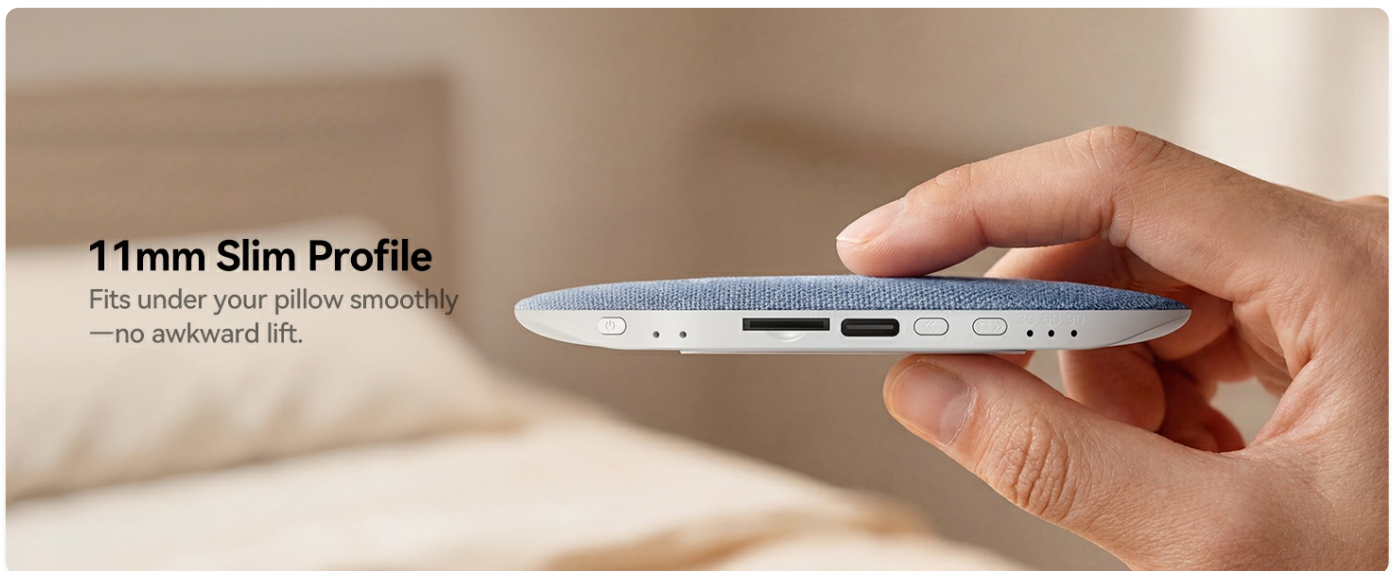
Image 4.1: Recommended placement of the speaker under a pillow for side sleepers.