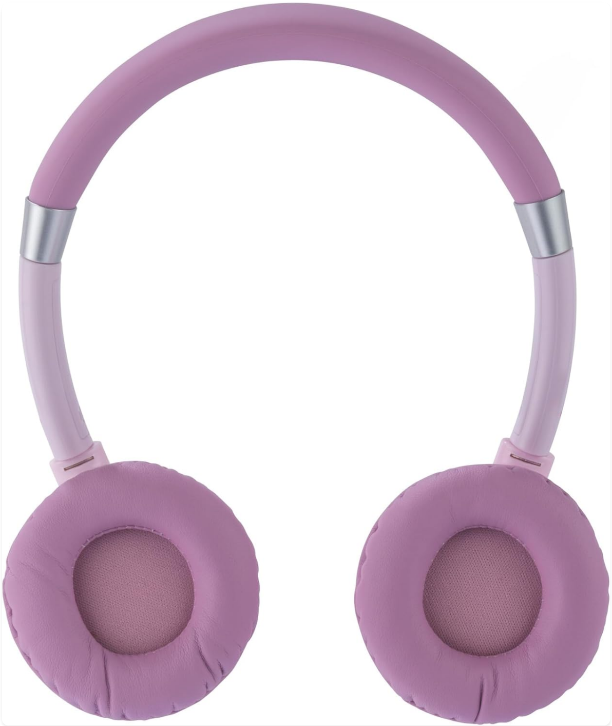
Image: A top-down view of the pink Intempo Kids Bluetooth Headphones, showcasing the adjustable headband and soft earcups.