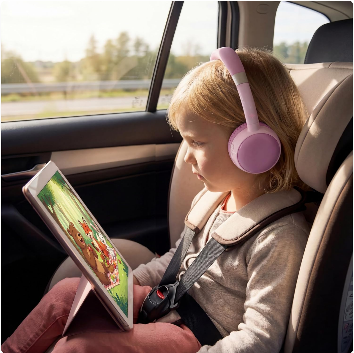
Image: A young child wearing pink Intempo Kids Bluetooth Headphones, engrossed in content on a tablet while seated in a car. This illustrates the headphones' use during travel.