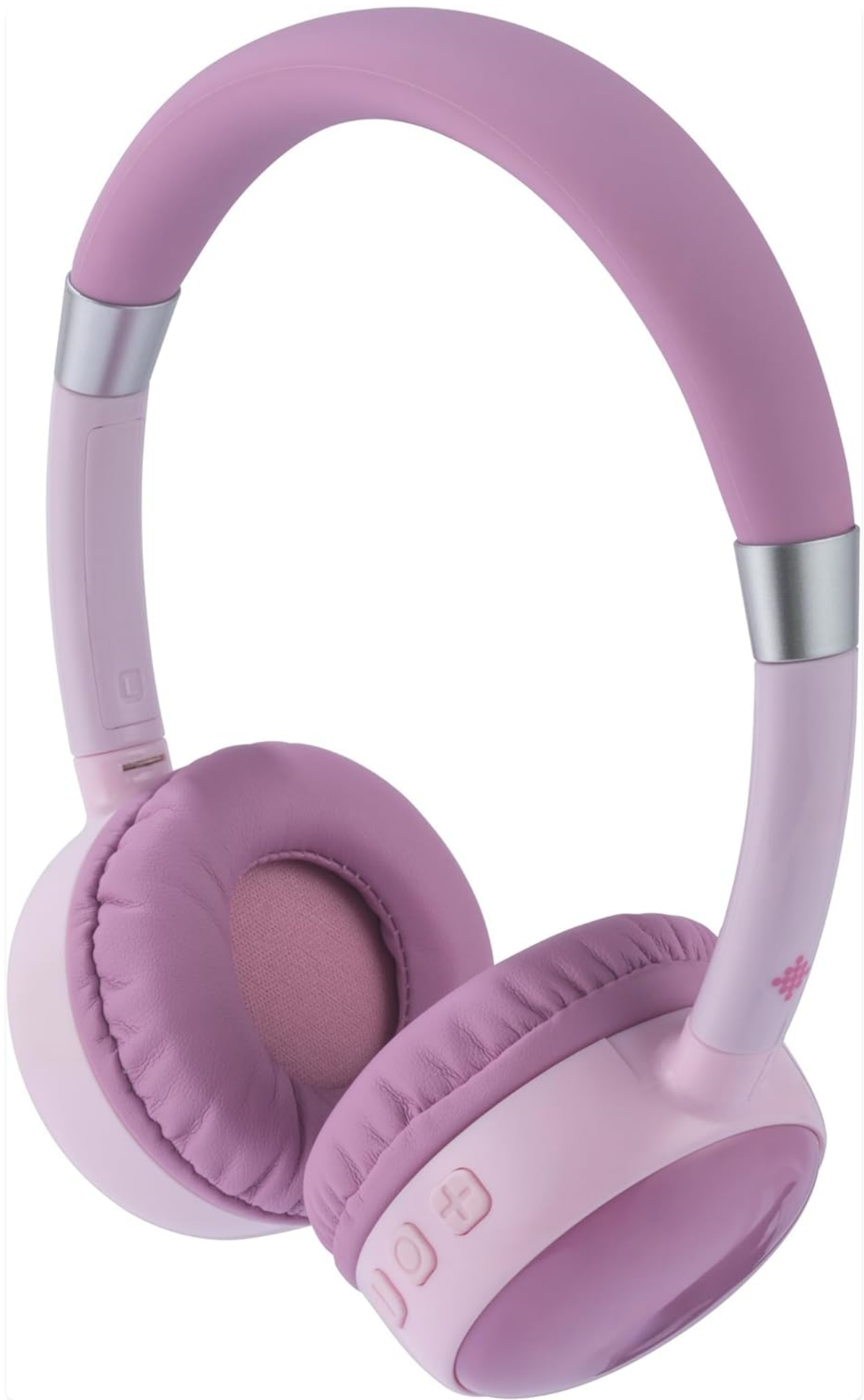
Image: A close-up side view of the pink Intempo Kids Bluetooth Headphones, highlighting the control buttons on the earcup. These buttons are used for power, volume adjustment, and media playback.