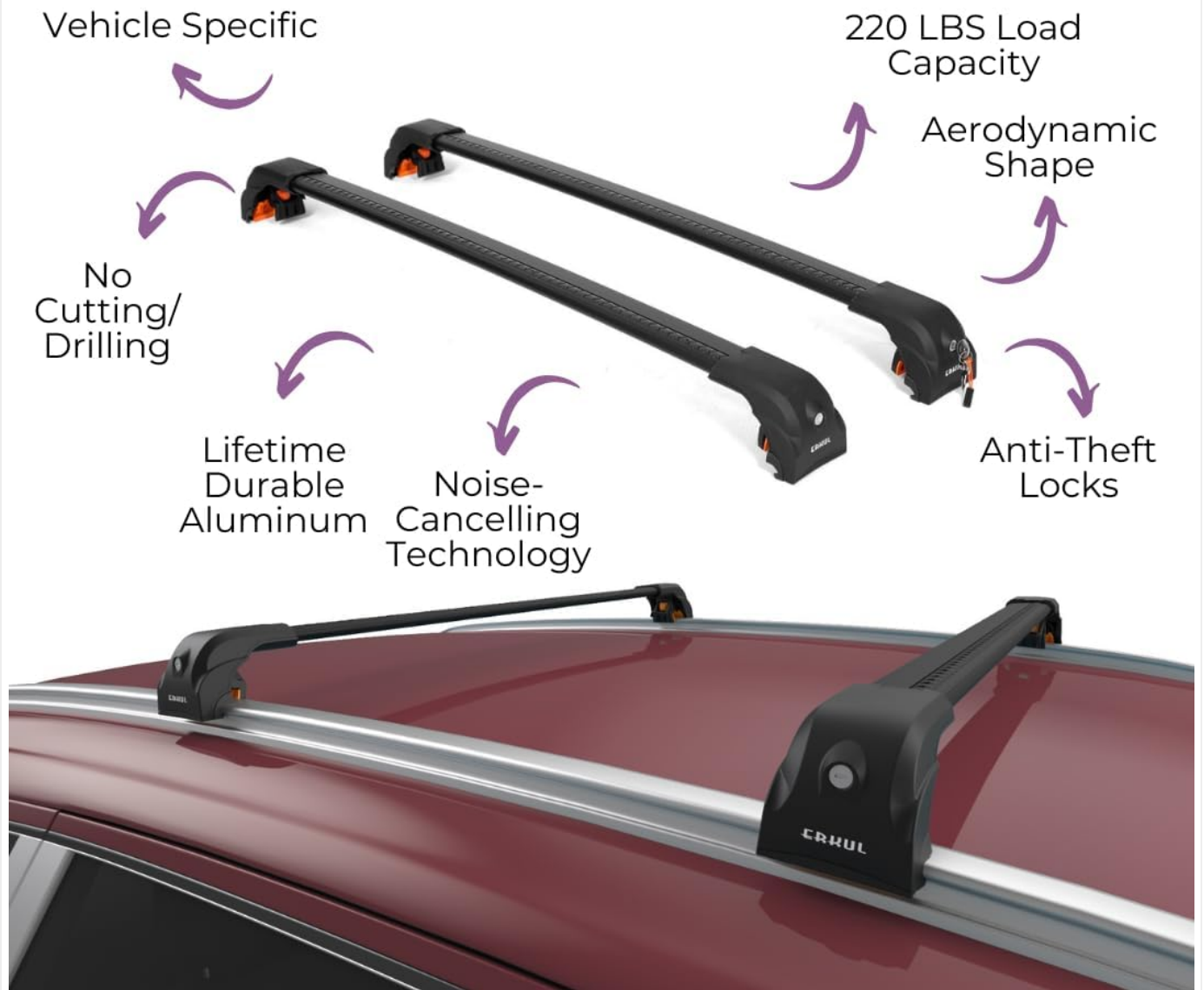
Image: An infographic detailing product features such as vehicle-specific design, 220 lbs load capacity, aerodynamic shape, no cutting/drilling required, durable aluminum, noise-cancelling technology, and anti-theft locks.