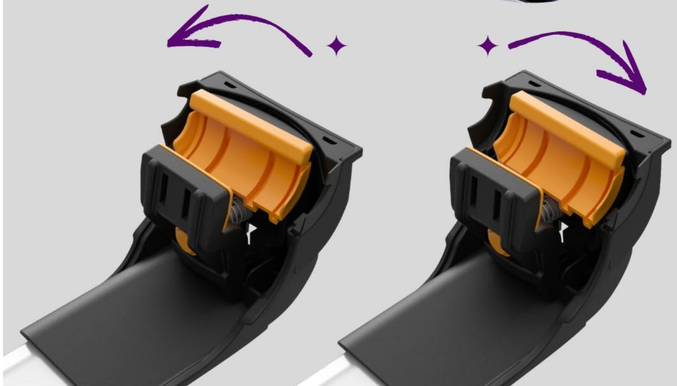
Image: Close-up view of the Smart Adaptive Grip mechanism, showing how the claws adjust to the vehicle's flush rails for a secure fit.