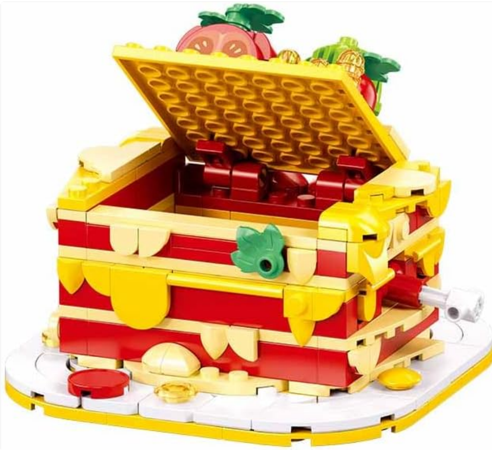
Figure 1: Assembled Garfield Lasagna Construction Set with the lid open.