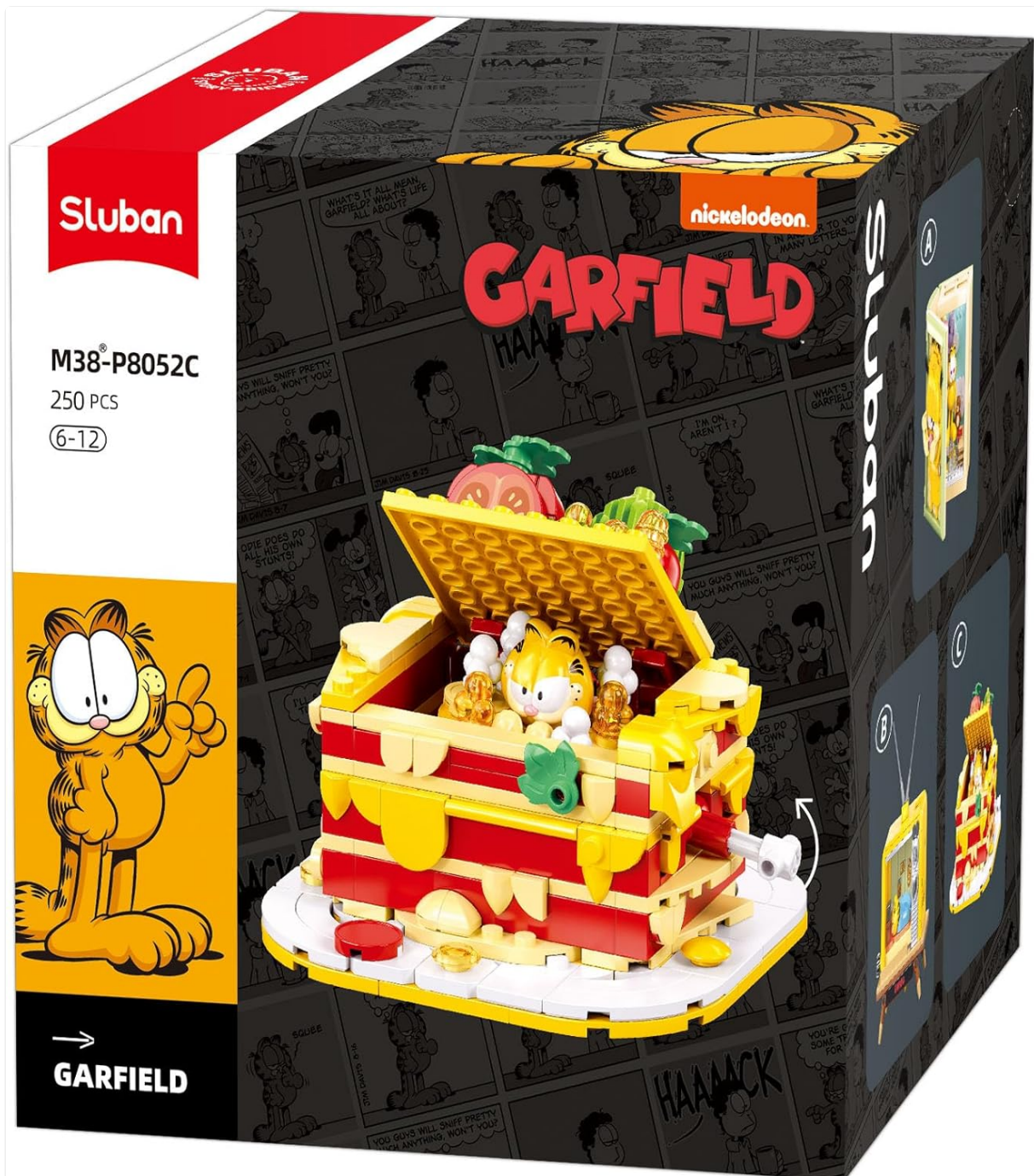
Figure 2: Retail packaging of the Sluban Garfield Lasagna Construction Set.