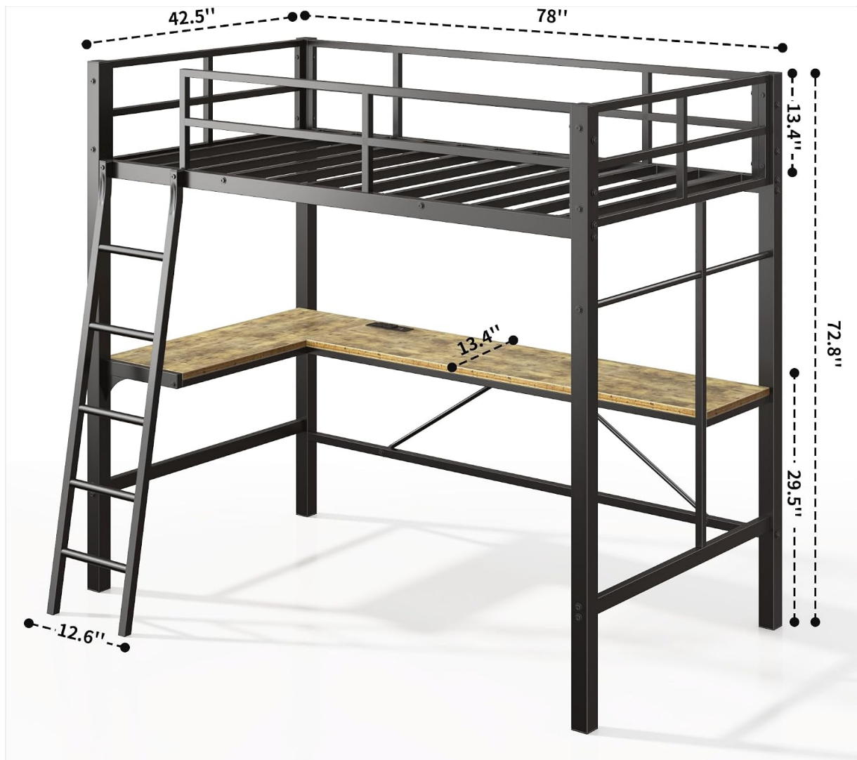
Figure 7: Product dimensions including length, width, and height of the bed and desk components.