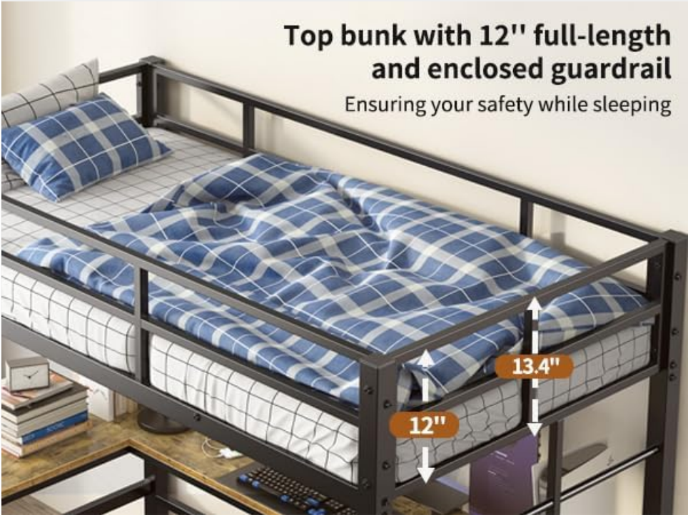
Figure 3: Top bunk with 12-inch full-length and enclosed guardrail, ensuring safety while sleeping.