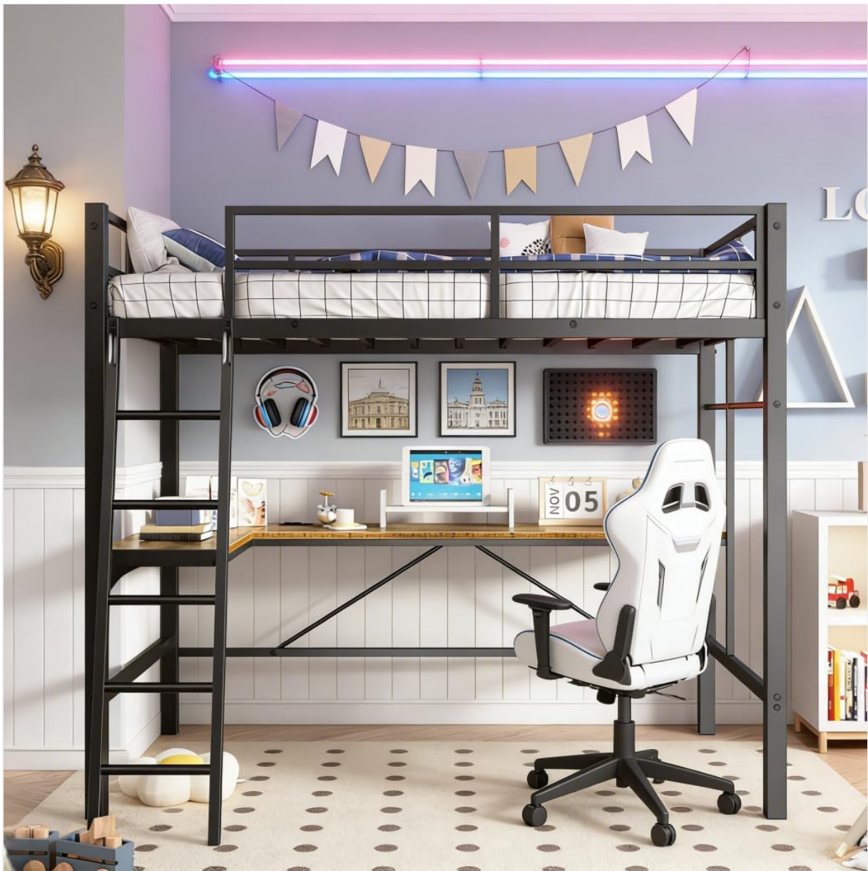
Figure 1: Bellemave Twin Loft Bed with L-Shaped Desk and Charging Station.