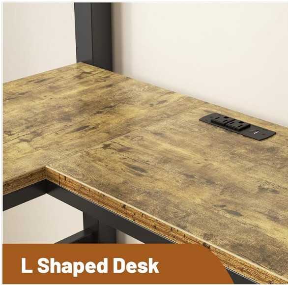
L Shaped Desk