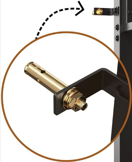
Figure 2: Anti-Topping Device installation detail. Fix the bed to the wall for stability and security.