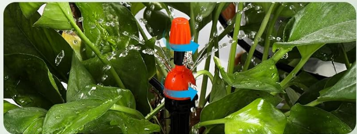
Image 5.1: Comparison of the adjustable dripper and the 2-in-1 spray & drip emitter, showing their different watering patterns.