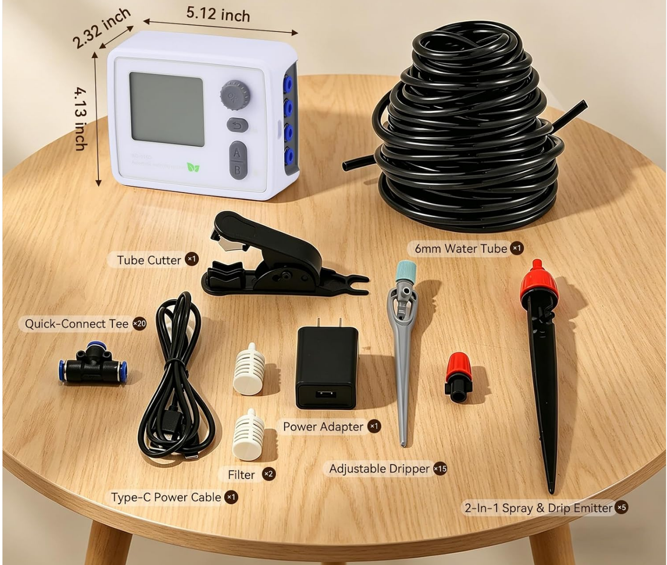
Image 2.1: All included accessories for the watering system, including the main pump, tubing, emitters, and tools.