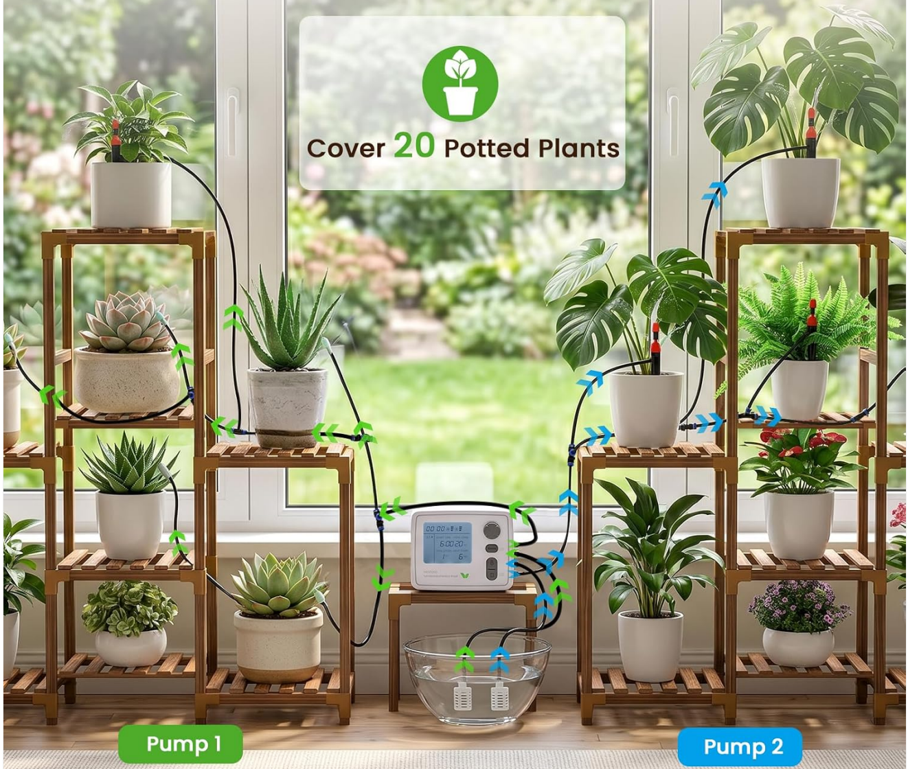
Image 1.1: The BAOSHISHAN Dual Pump Indoor Plant Watering System in operation, showing two pumps independently watering various potted plants.