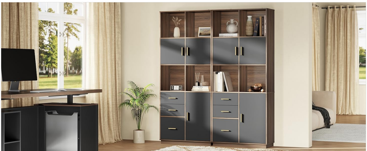
Image: This diagram illustrates the multi-zone storage design and the adjustable shelves within the cabinets, allowing for customized storage space.

Image: An overview of the bookcase highlighting its various storage compartments: open cubes, three storage drawers, and three cabinet doors.