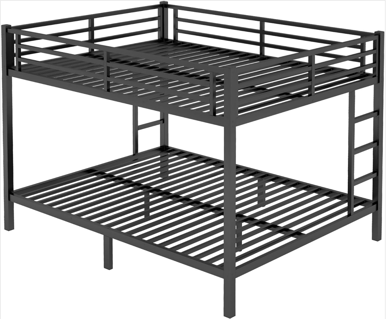
Image: Assembled bunk bed frame, ready for mattresses.