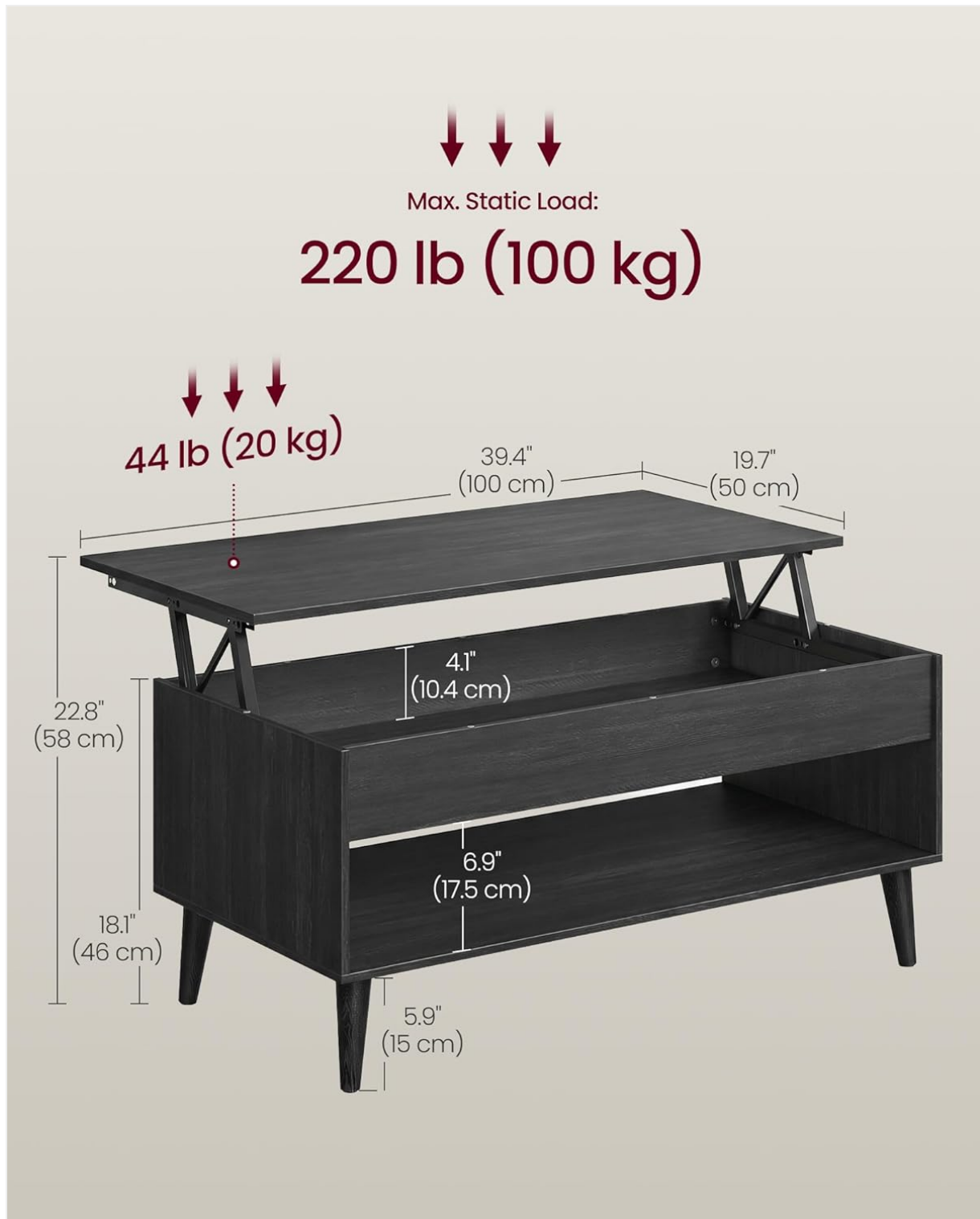
Detailed dimensions and maximum static load capacities for the coffee table.