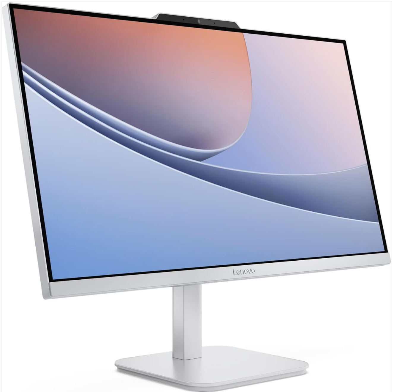
Image: Included items with the Lenovo A100 All-in-One Desktop Computer.