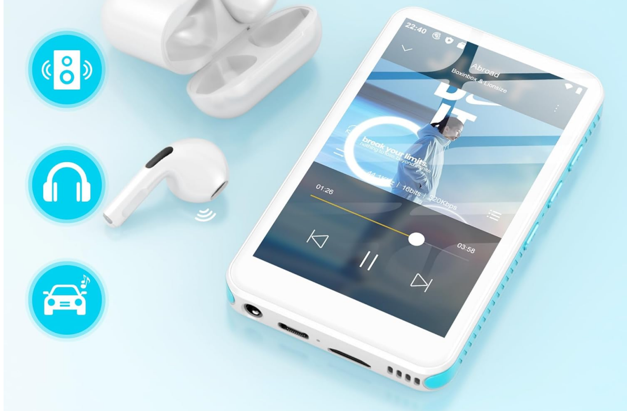
Image: Music playback interface on the SWOFY D08.

Built-in 2.4G/5G dual-band WiFi for stable connection. Bluetooth pairs quickly with headphones, speakers and car stereos.