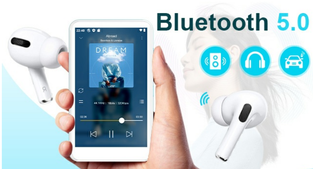
Image: Bluetooth 5.0 connectivity options for the SWOFY D08.