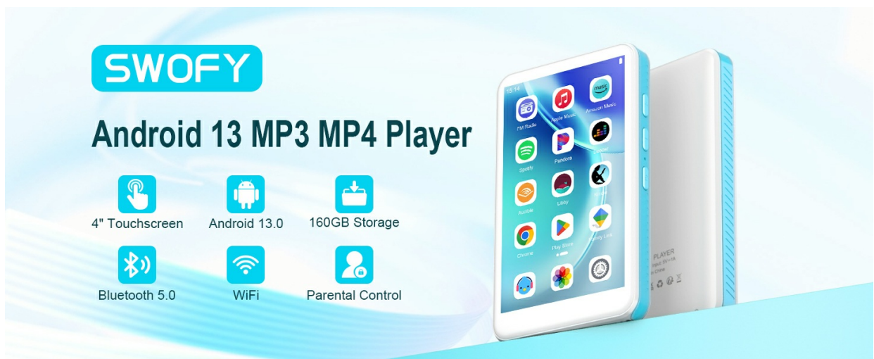
Image: The SWOFY D08 MP3 Player showcasing its Android 13 operating system interface.

The SWOFY D08 is a versatile 160GB MP3/MP4 player designed for a comprehensive audio and video experience. Featuring Android 13 OS, a 4-inch HD touchscreen, and extensive connectivity options, it serves as a portable entertainment hub.