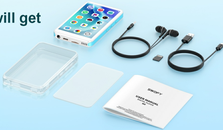
Image: All items included in the SWOFY D08 MP3 Player package.