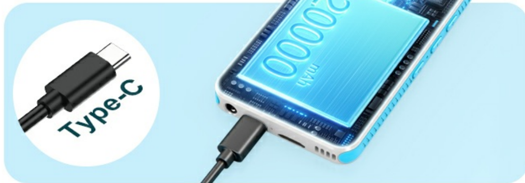
Image: The MP3 player connected to a USB-C charging cable.