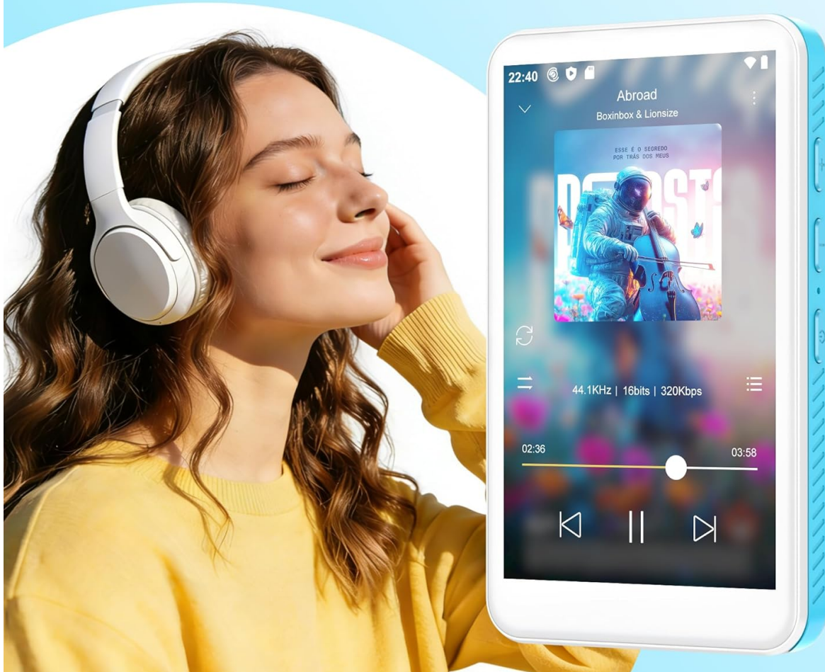
Image: The main application screen of the MP3 player.