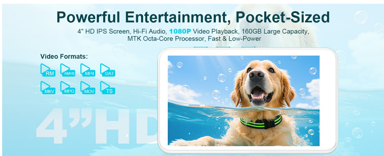
Image: Video playback on the SWOFY D08.