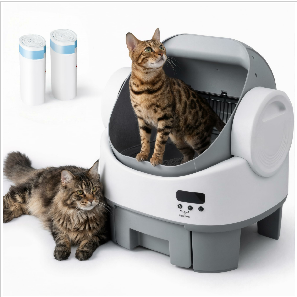
Image: The WARCAT Self-Cleaning Automatic Cat Litter Box, showcasing its sleek gray and white design in a home setting.