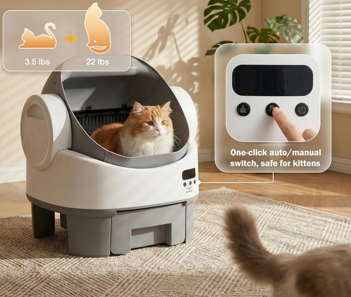
Image: A cat comfortably using the open-top litter box, with a clear view of the intuitive control panel for easy operation.

Open design helps cats adapt easily and use it quickly without stress.