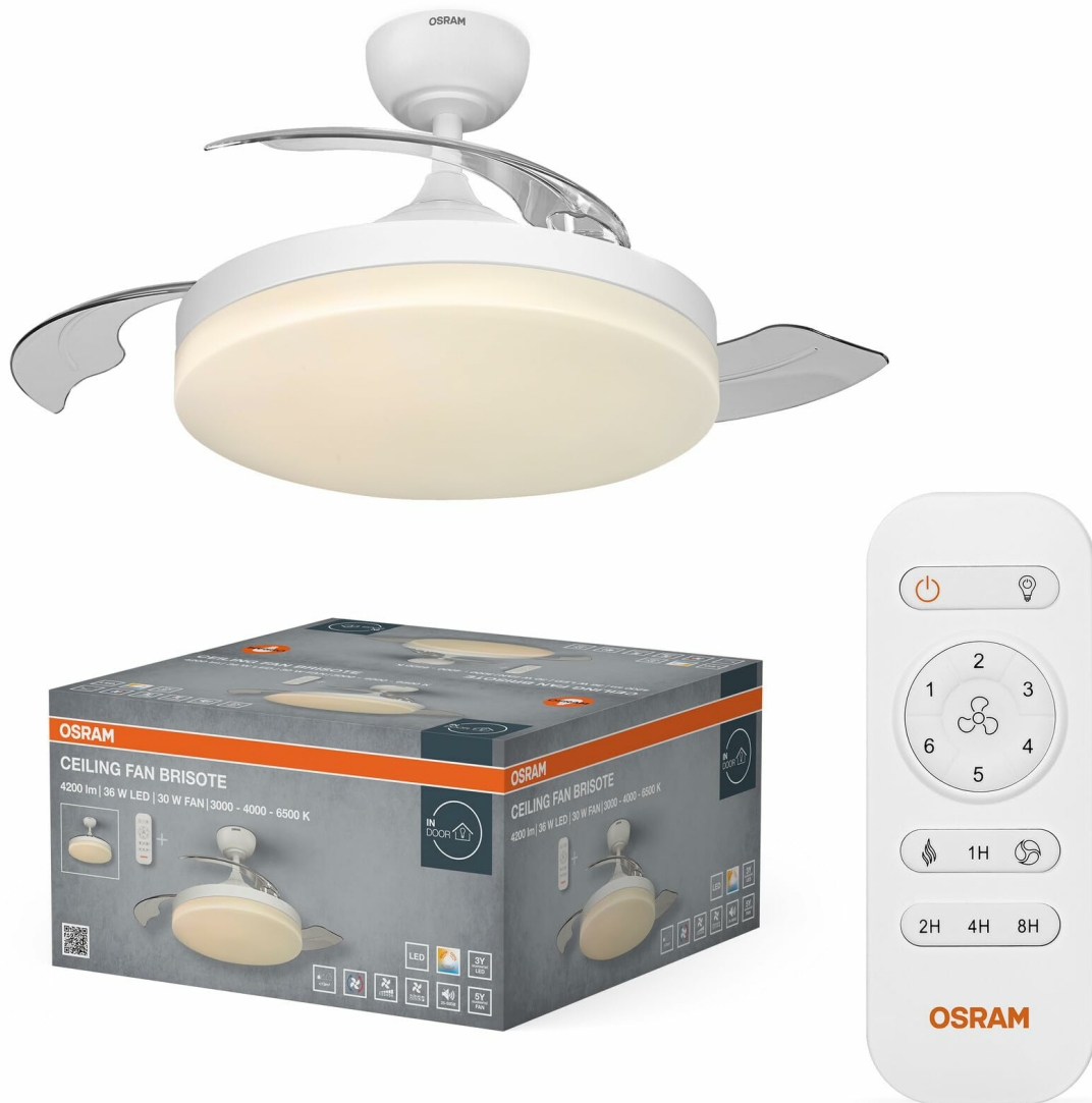
Figure 3.1: OSRAM LED Ceiling Fan Brisote 1060mm 66W CCT.