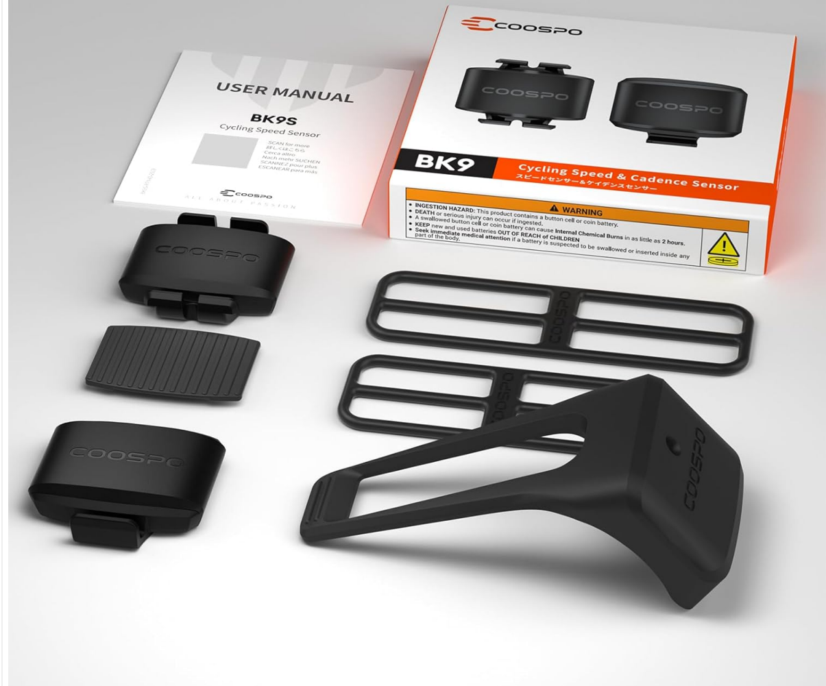
Image: Contents of the COOSPO BK9 sensor package, including the sensors, mounting accessories, and user manual.