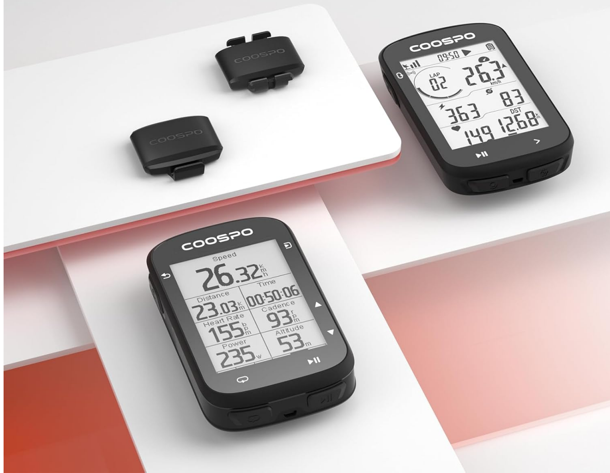
Image: The COOSPO BK9 sensors displayed alongside two GPS bike computers, demonstrating their compatibility for displaying speed and cadence data.

Once connected, the sensors will transmit real-time speed and cadence data to your device, allowing you to monitor and analyze your cycling performance.