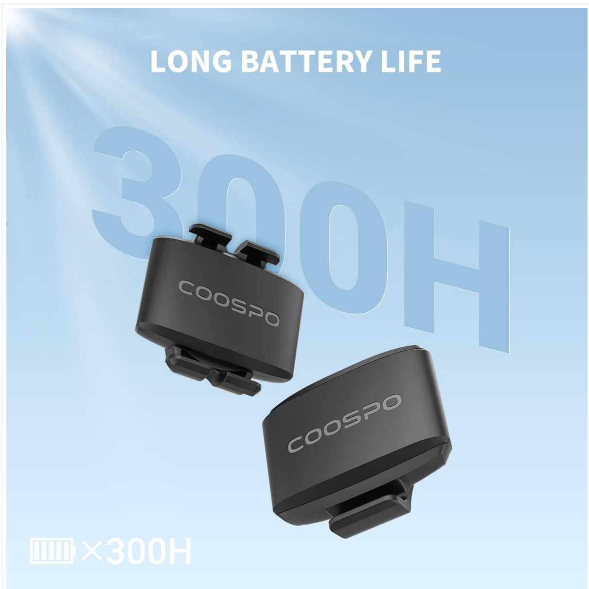
Image: Two COOSPO BK9 sensors with a graphic indicating a 300-hour battery life. This image highlights the extended operational time of the sensors.