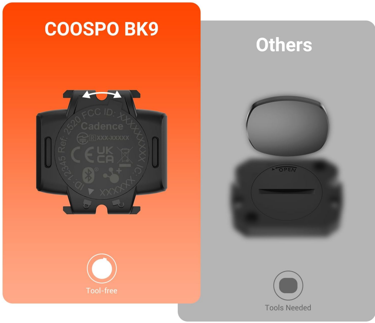
Image: Illustration of the tool-free battery replacement mechanism for the COOSPO BK9 sensor, showing how to open and close the battery compartment.