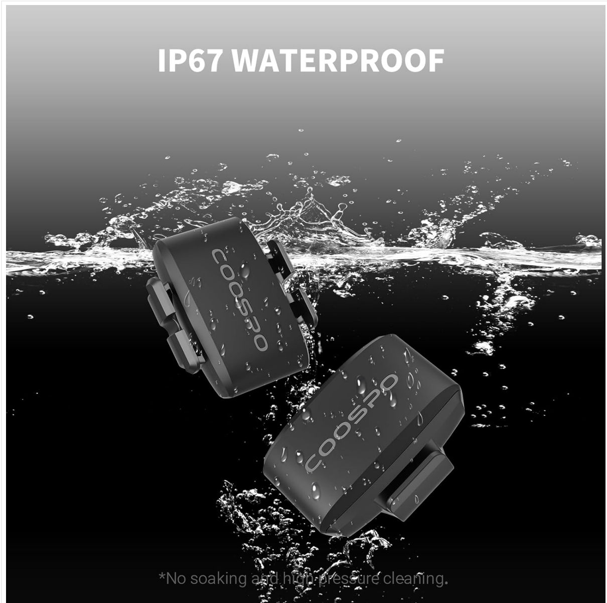
Image: Two COOSPO BK9 sensors being splashed with water, demonstrating their IP67 waterproof rating. Note: Avoid soaking or high-pressure cleaning.