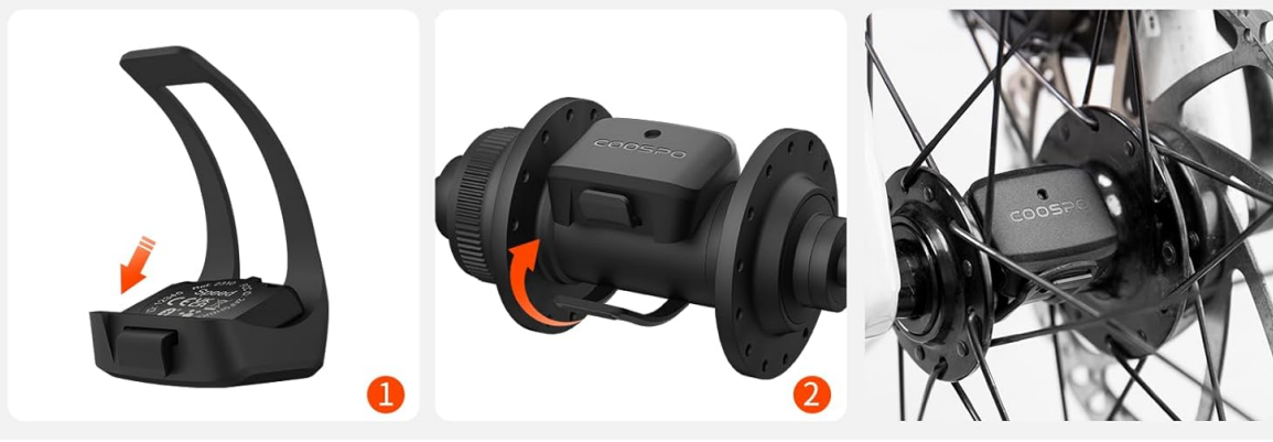
Image: Visual guide for installing the cadence sensor on the crank arm and the speed sensor on the wheel hub. The image shows the sensor being attached to the crank arm and the wheel hub.