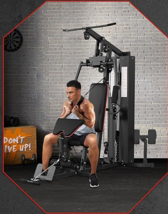
Image: Examples of arm and core training exercises, such as bicep curls using the preacher curl pad and abdominal exercises.