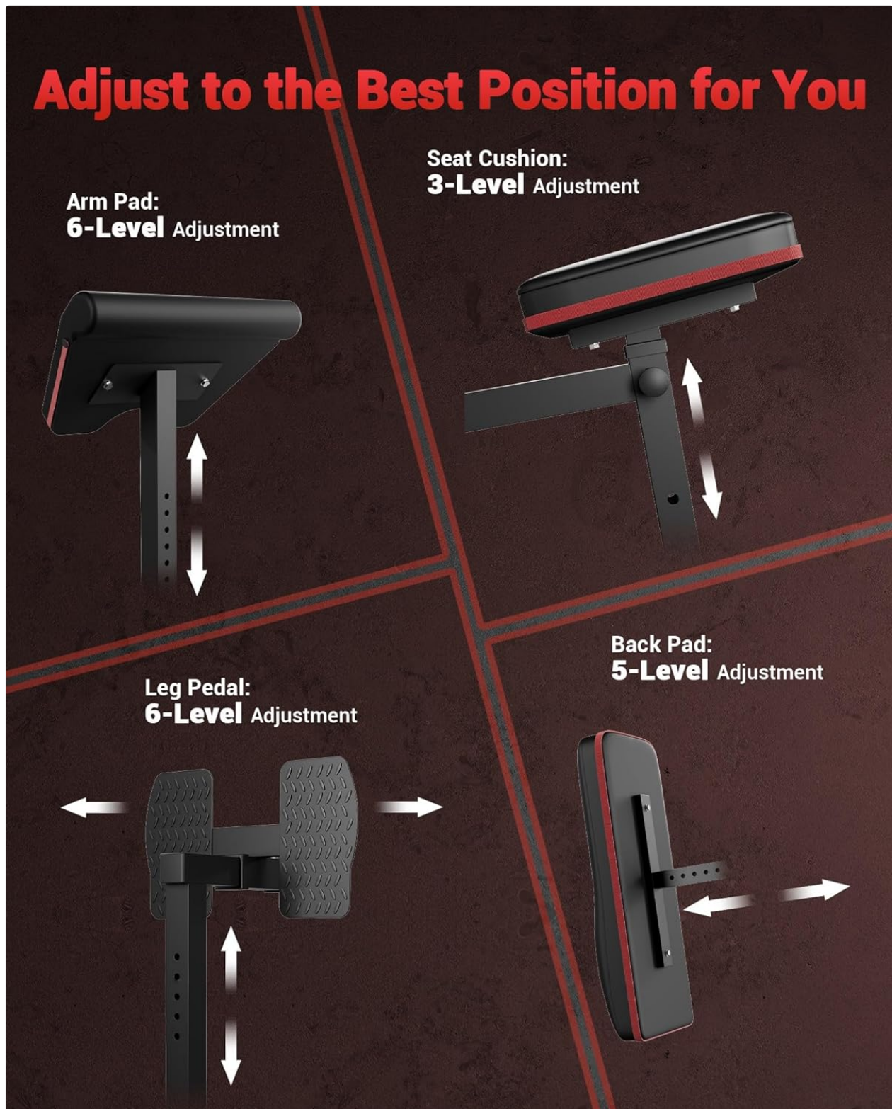
Image: Visual guide for adjusting the seat cushion (3 levels), arm pad (6 levels), leg pedal (6 levels), and back pad (5 levels) to achieve the best position for your workout.

Customize the machine to your body and exercise needs using the multiple adjustable settings: