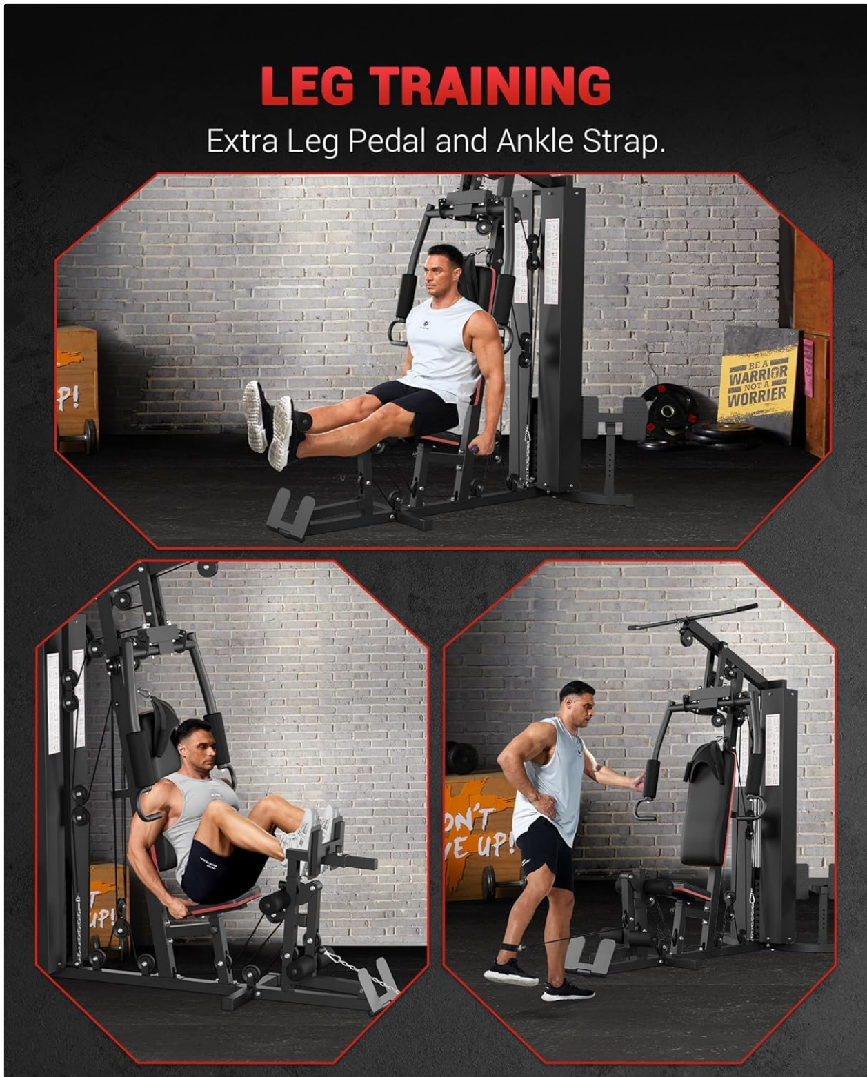
Image: Examples of leg training, including leg extensions and exercises using the extra leg pedal and ankle strap.

Utilize the leg developer for leg extensions and leg curls. An ankle strap is included for additional leg exercises.