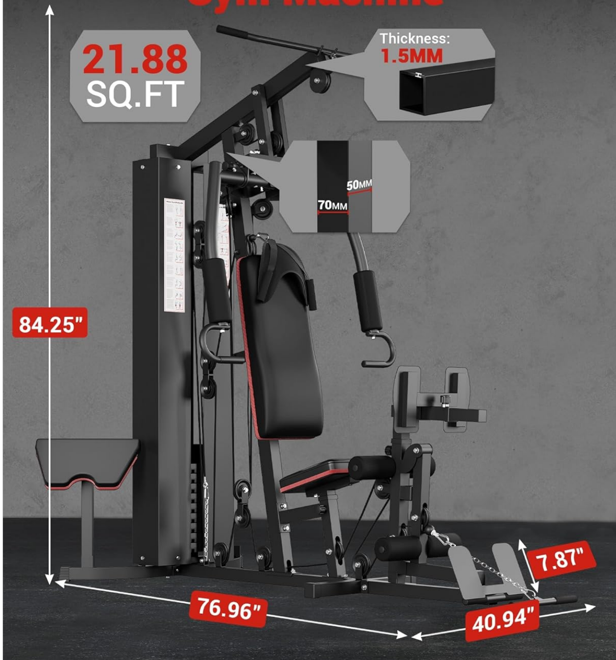
Image: Dimensional diagram of the Garvee Home Gym Machine, showing overall height, width, and depth.