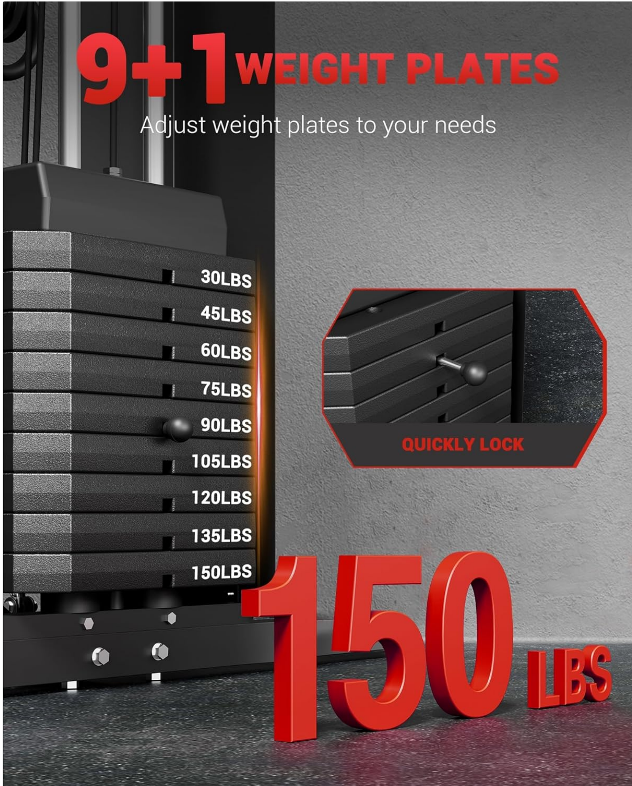
Image: Close-up of the 150 LBS weight stack, demonstrating how to quickly lock the selector pin into the desired weight plate.

The machine is equipped with a 150 LBS weight stack, consisting of 9+1 weight plates. To adjust the resistance, insert the selector pin into the desired weight plate. Ensure the pin is fully inserted before beginning your exercise.