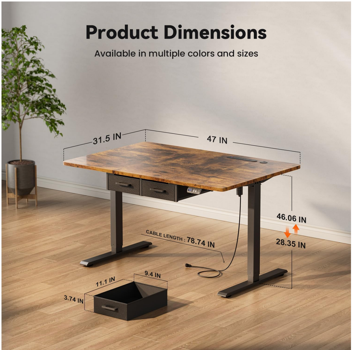
Image: Detailed product dimensions, showing 47 inches width, 31.5 inches depth, and height range from 28.35 to 46.06 inches.