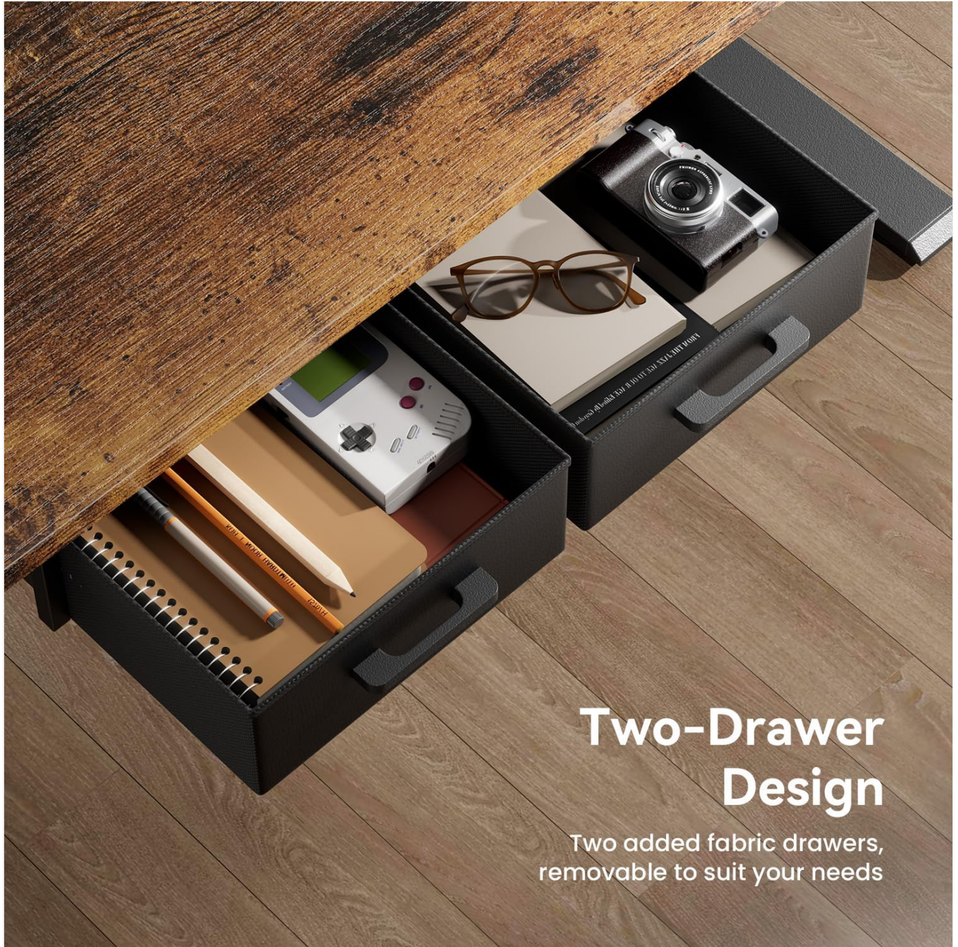
Image: View of the two fabric drawers under the desk, showing them filled with office supplies and personal items.

The desk includes two removable drawers for storage. These drawers can be used to keep frequently accessed items organized and out of sight, enhancing desktop tidiness.