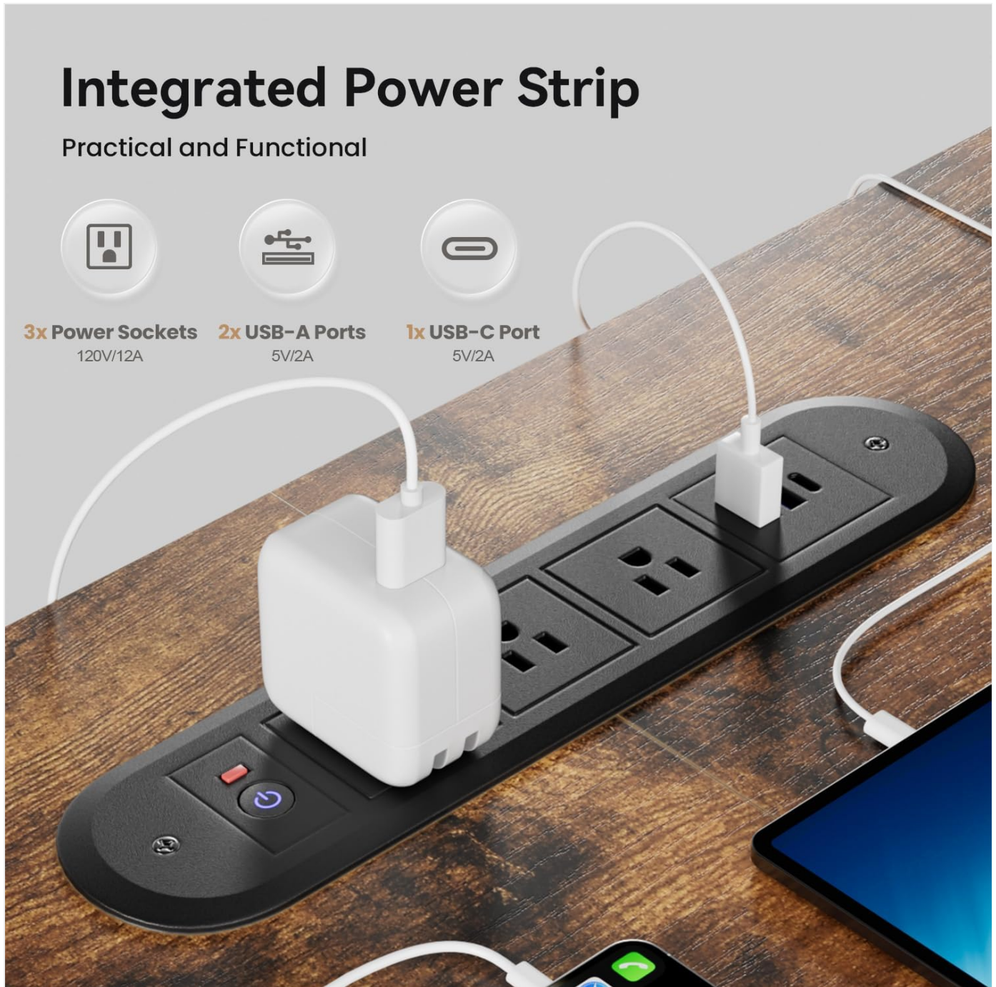
Image: Close-up of the integrated power strip with various devices plugged in, showing the 3 power sockets, 2 USB-A ports, and 1 USB-C port.

This panel minimizes cable clutter and tripping hazards. Overload protection is integrated and will automatically activate if current limits are exceeded, protecting connected devices.