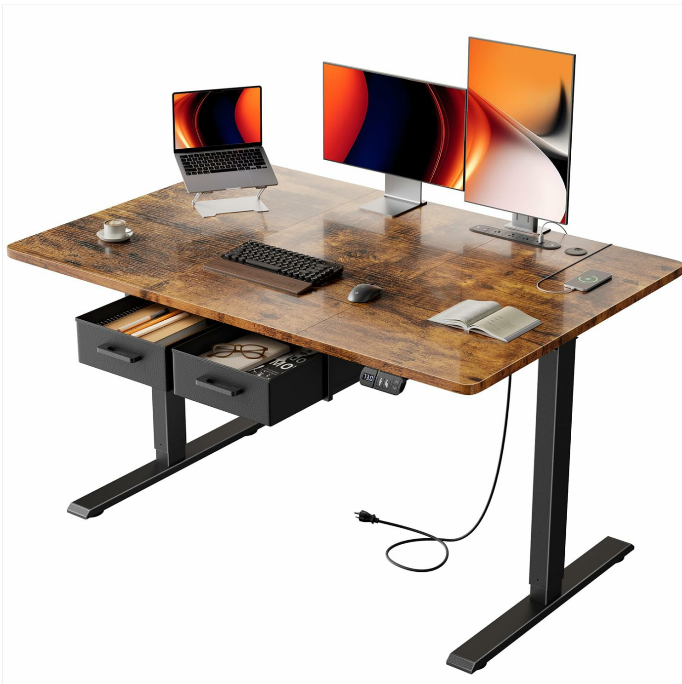
Image: HLDIRECT Electric Standing Desk, Rustic Brown 47 inch variant.