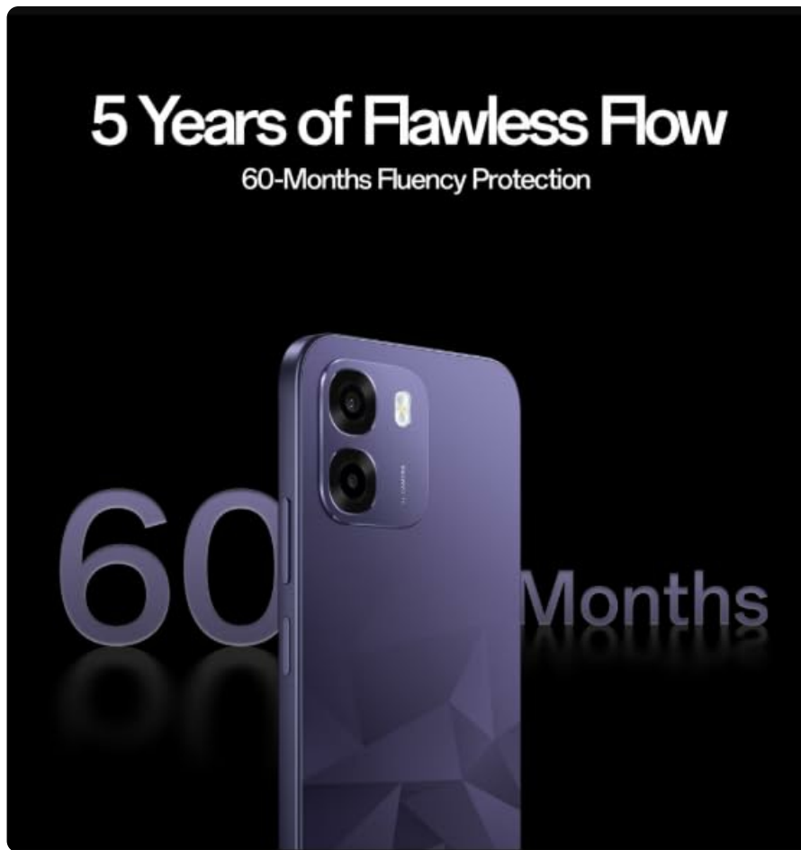
Image: The OPPO K14 5G promoting 60-Months Fluency Protection for long-term smooth performance.