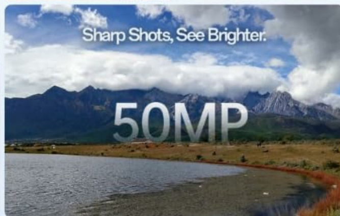
Image: A collage of key features for the OPPO K14 5G, including 7000mAh battery, smooth performance with ColorOS, IP69 all-weather protection, and a 50MP camera.