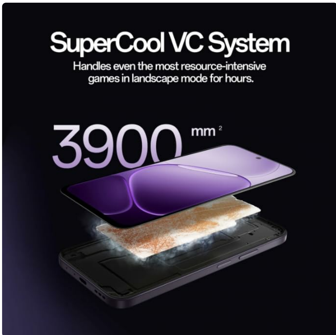
Image: Diagram illustrating the SuperCool VC System with its 3900 mm 2 vapour chamber, designed to prevent overheating during extended use.

The device is engineered for smooth performance with 6GB RAM and is equipped with a SuperCool VC System. This system includes a 3900 mm 2 vapour chamber cooling area, which effectively dissipates heat during intensive tasks like gaming, ensuring sustained performance without overheating.