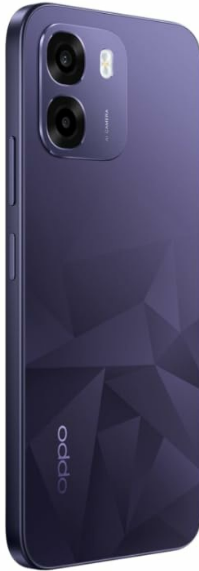
Image: Side view of the OPPO K14 5G Smartphone, highlighting the slim profile and button placement.