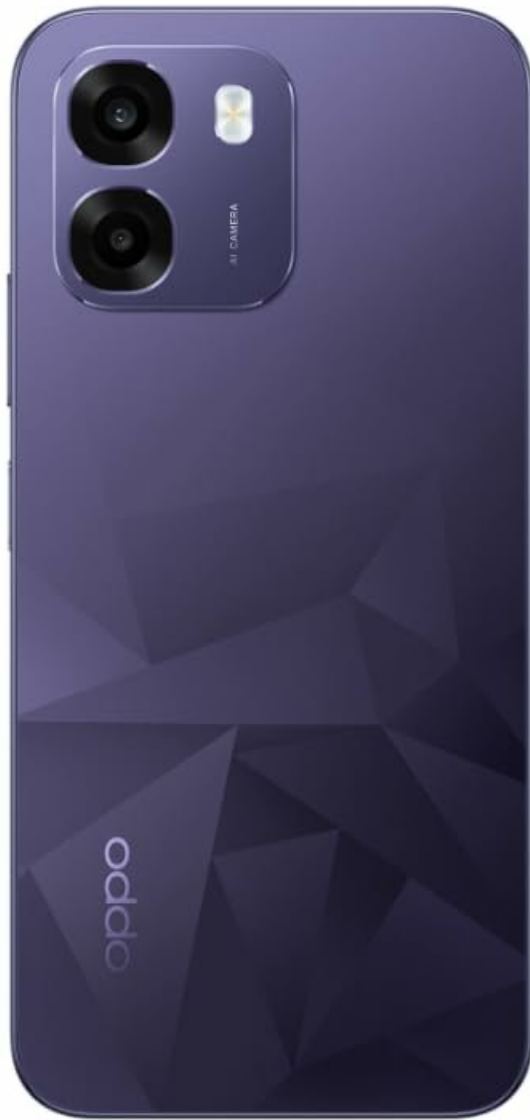
Image: Rear view of the OPPO K14 5G Smartphone, showcasing the dual camera setup and geometric pattern in Prism Violet.