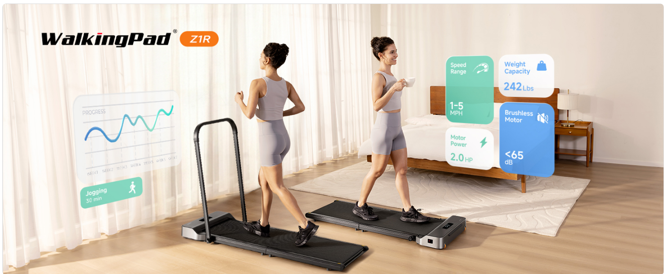
Image: Demonstrating the versatility of the removable handle bar for different exercise scenarios.