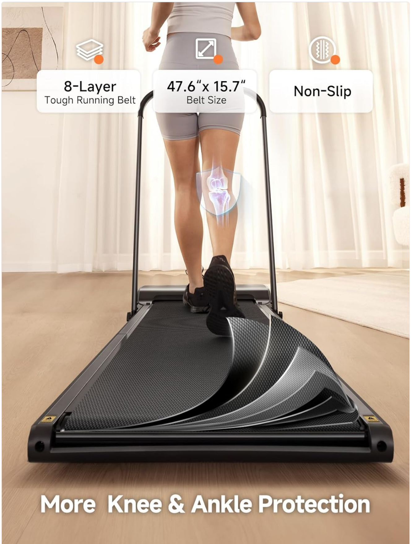
Image: The 8-layer shock-absorbing running belt for joint protection.