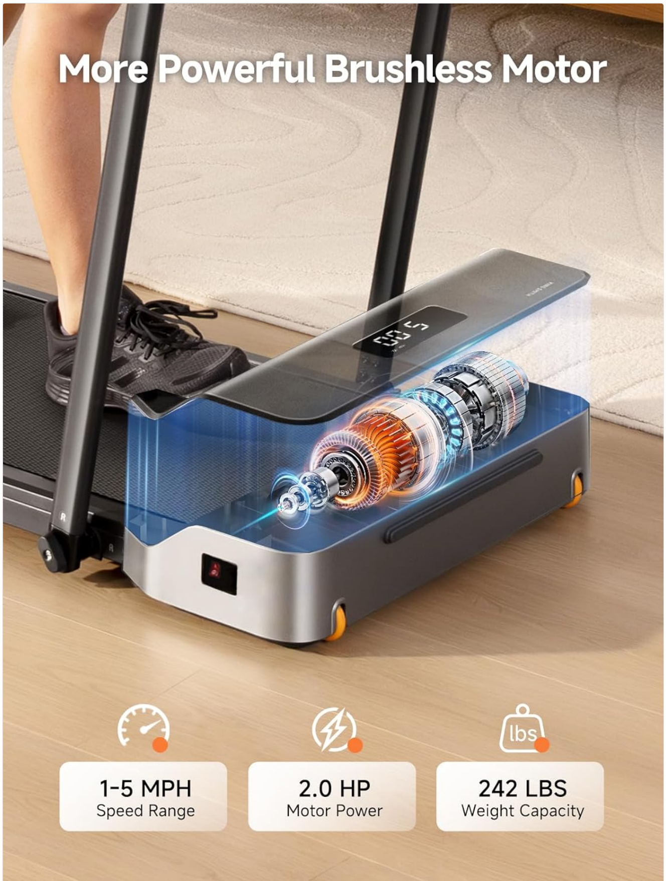
Image: Illustration of the powerful brushless motor.

for low-noise operation, allowing for exercise without significant disturbance in home or office environments.