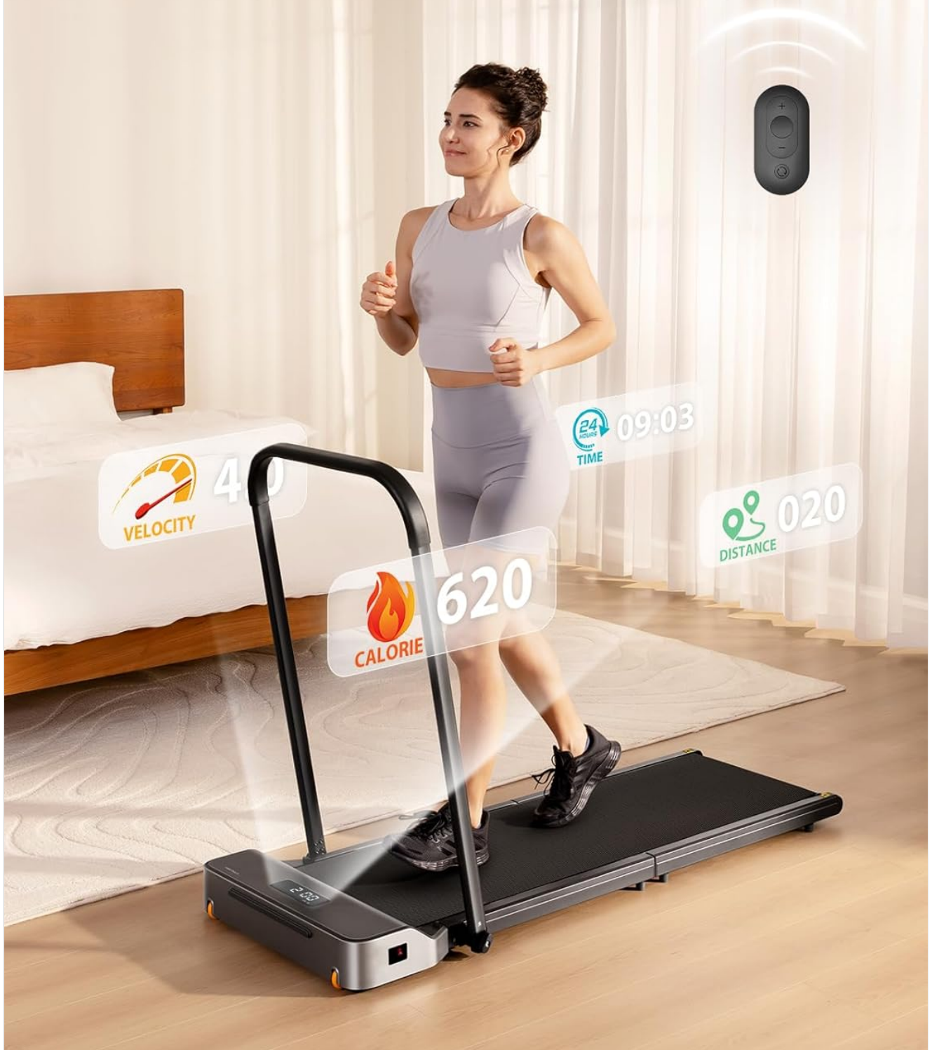
Image: The LED HD Digital Display showing workout data.