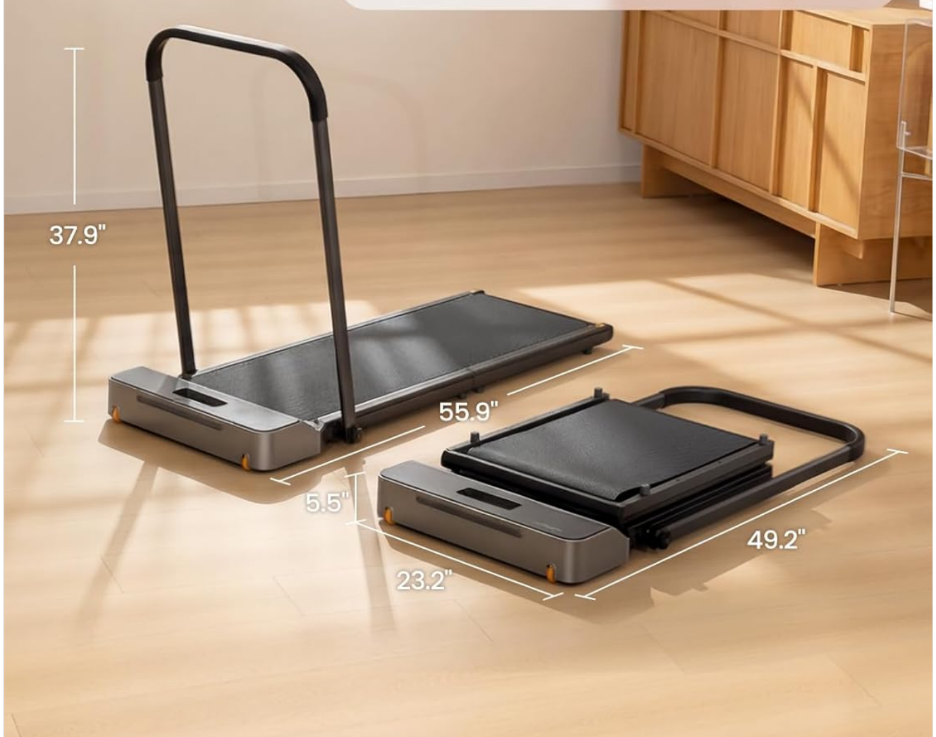
Image: Product dimensions for the WalkingPad Z1R.

Speed range: 1-5 mph Max weight: 242 lbs Net weight: 81 lbs Belt size: 47.6" x 15.7" Unfolded size: 55.9" x 23.2" x 37.9" Folded size: 49.2" x 23.2" x 5.5"