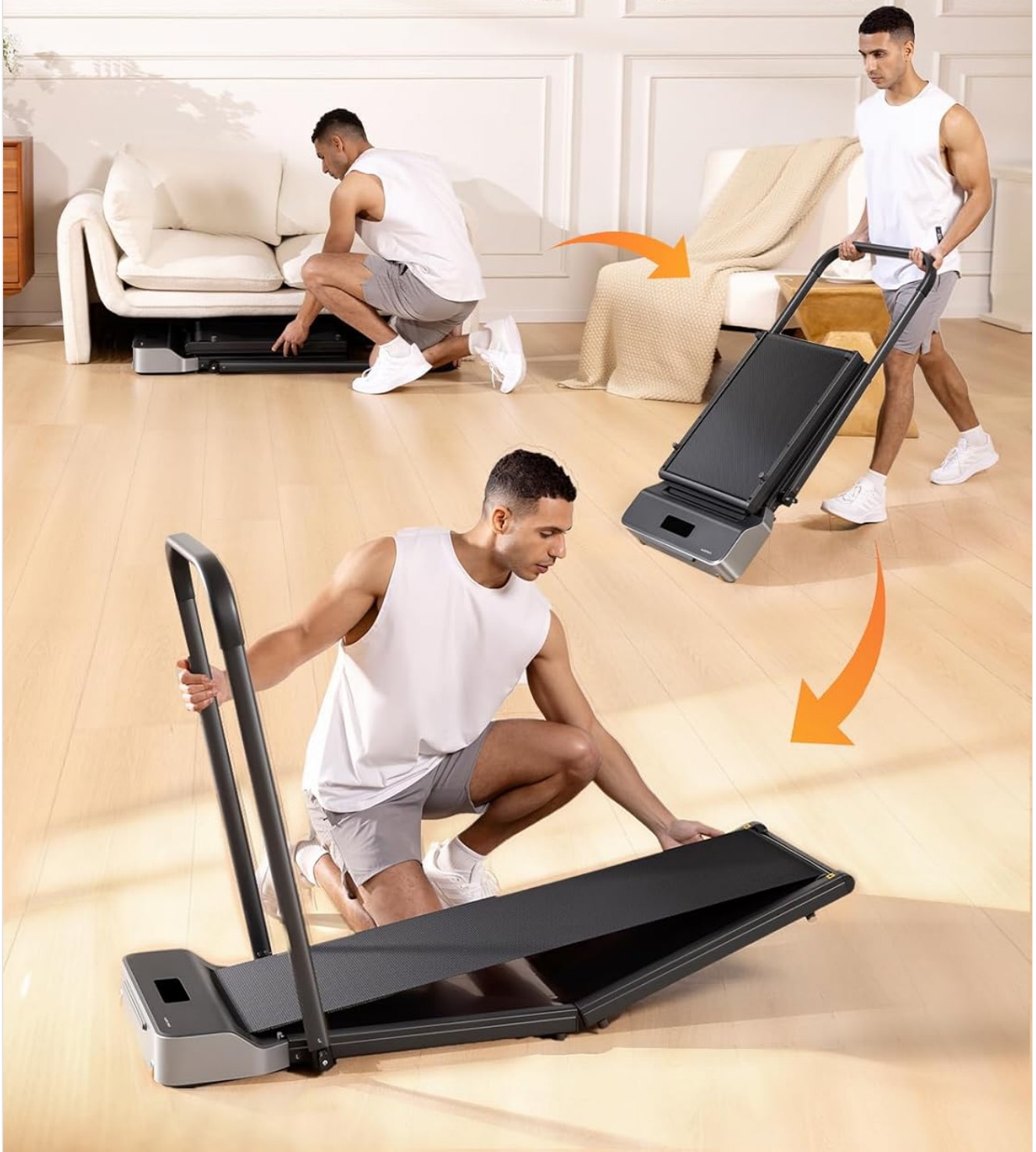
Image: Step-by-step illustration of unfolding the WalkingPad Z1R.