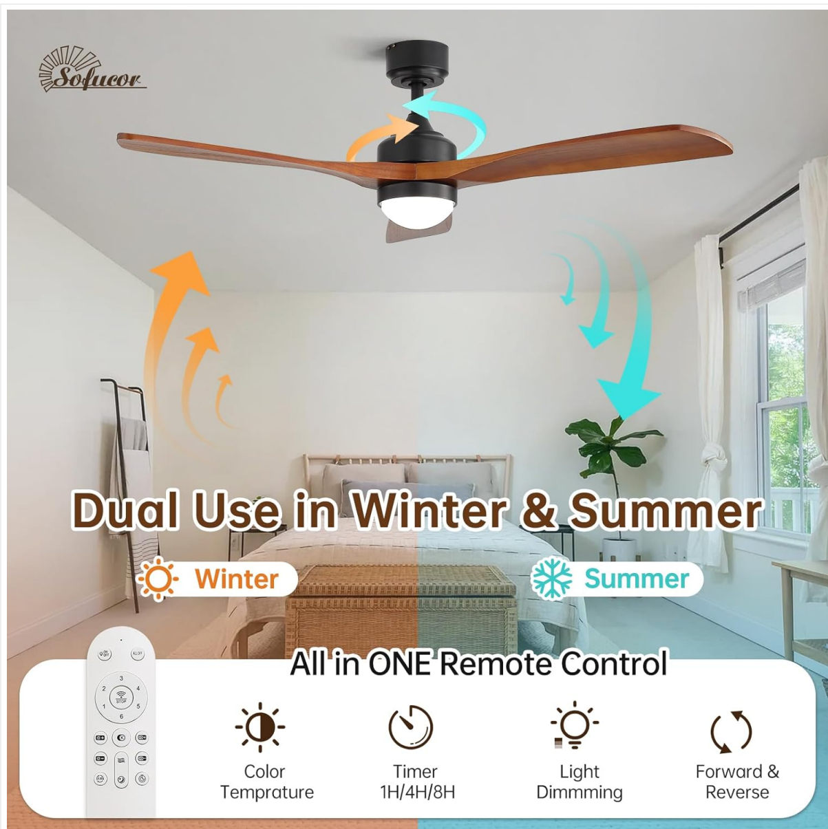
Image: Remote control and its functions for seasonal use.