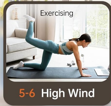
Image: Six adjustable fan speeds for various activities.