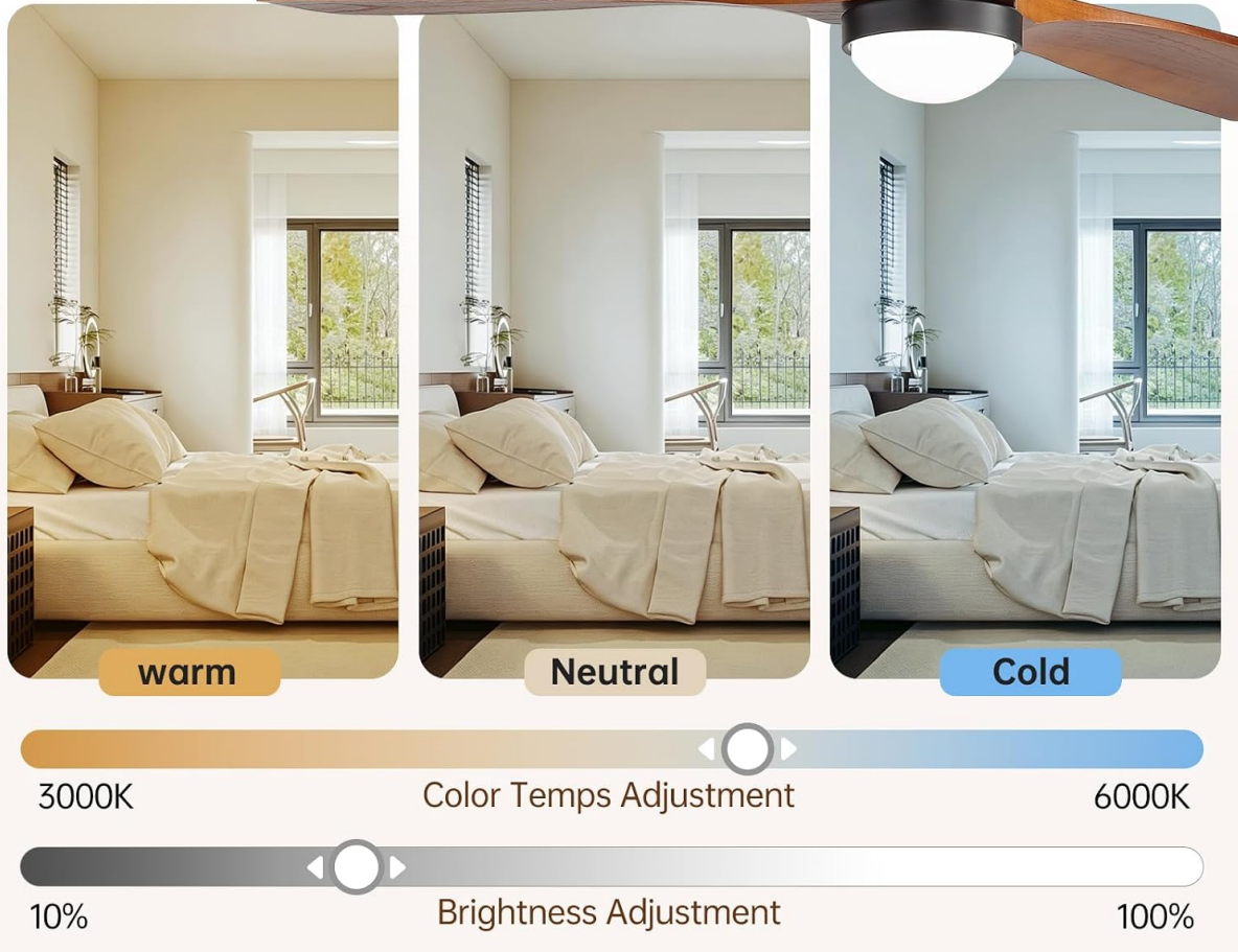
Image: Dimmable LED light with three color temperature options.