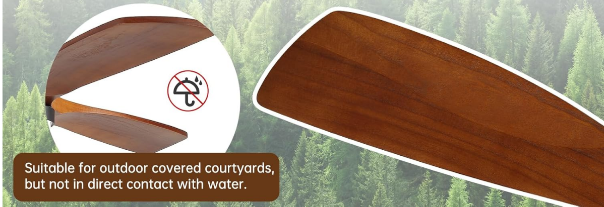
Image: Solid wood blades for enhanced durability and aesthetic.