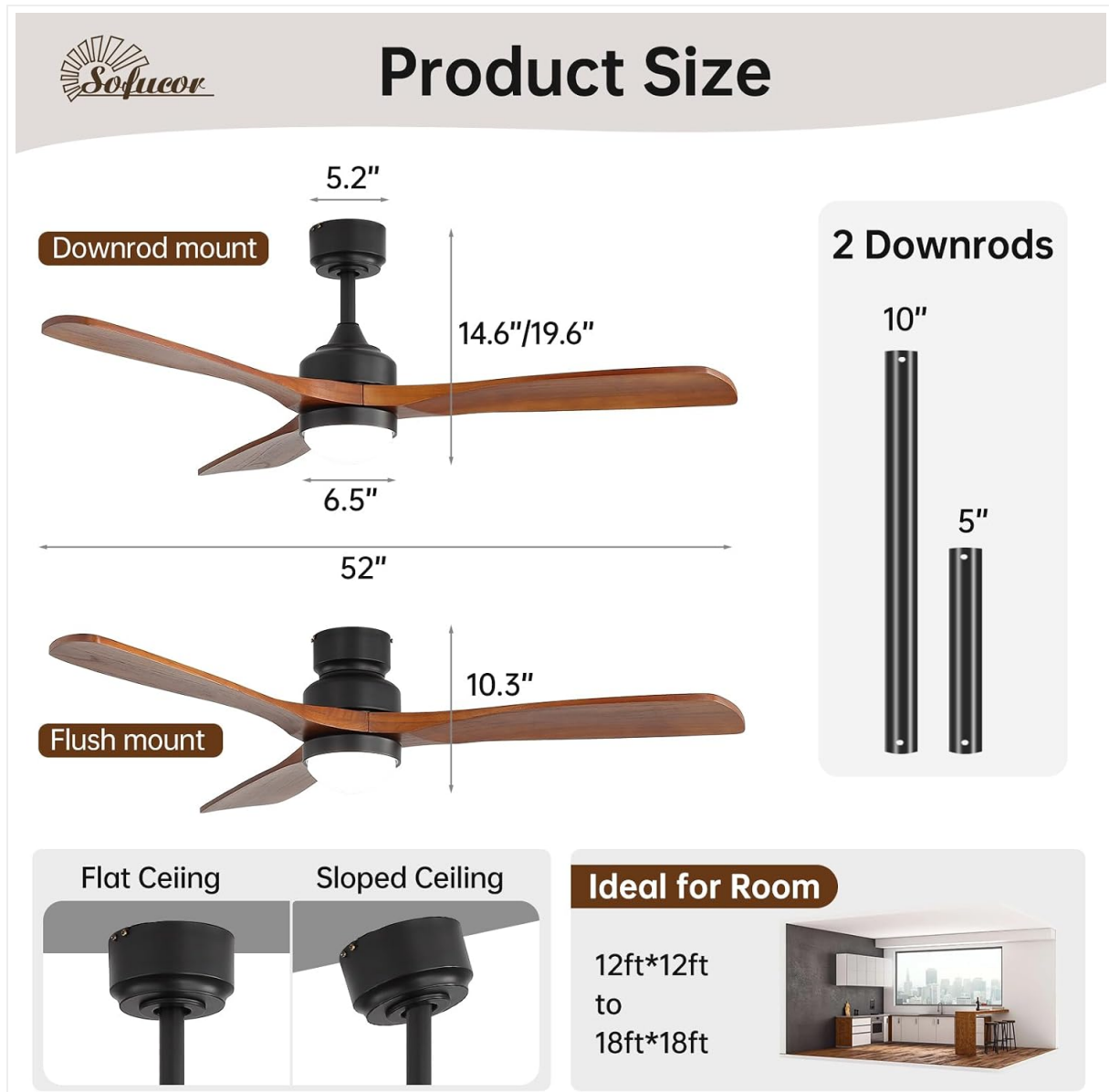
Image: Examples of ceiling fan installation in different room types and mounting configurations (downrod, flush, sloped).

The fan supports both downrod mount and flush mount installations, suitable for flat or sloped ceilings.