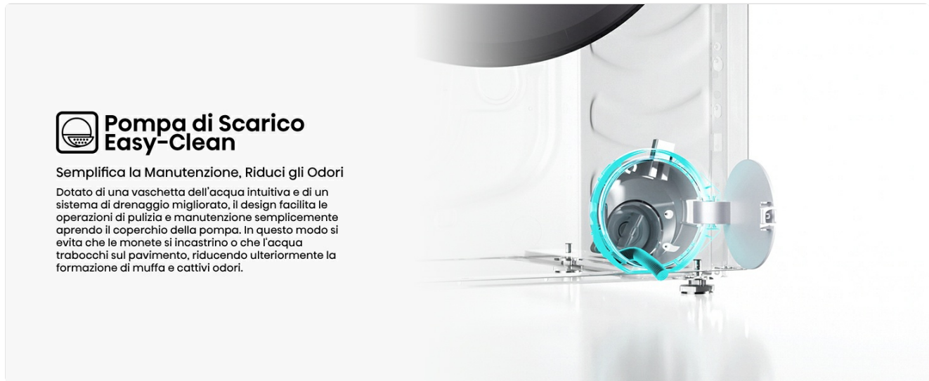
The Easy-Clean Drain Pump, simplifying maintenance and reducing odors.

blockages and ensure proper drainage. This intuitive water collection tray and improved drainage system simplify cleaning and maintenance by simply opening the pump cover, preventing coins from getting stuck and water from overflowing onto the floor, further reducing mold formation and unpleasant odors.