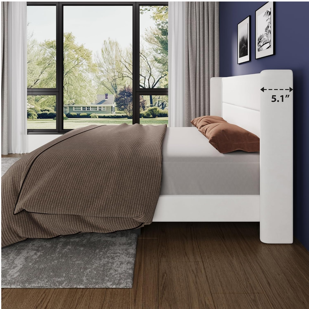
Image: The Garvee bed frame showcasing its velvet fabric material and elegant wingback headboard design.