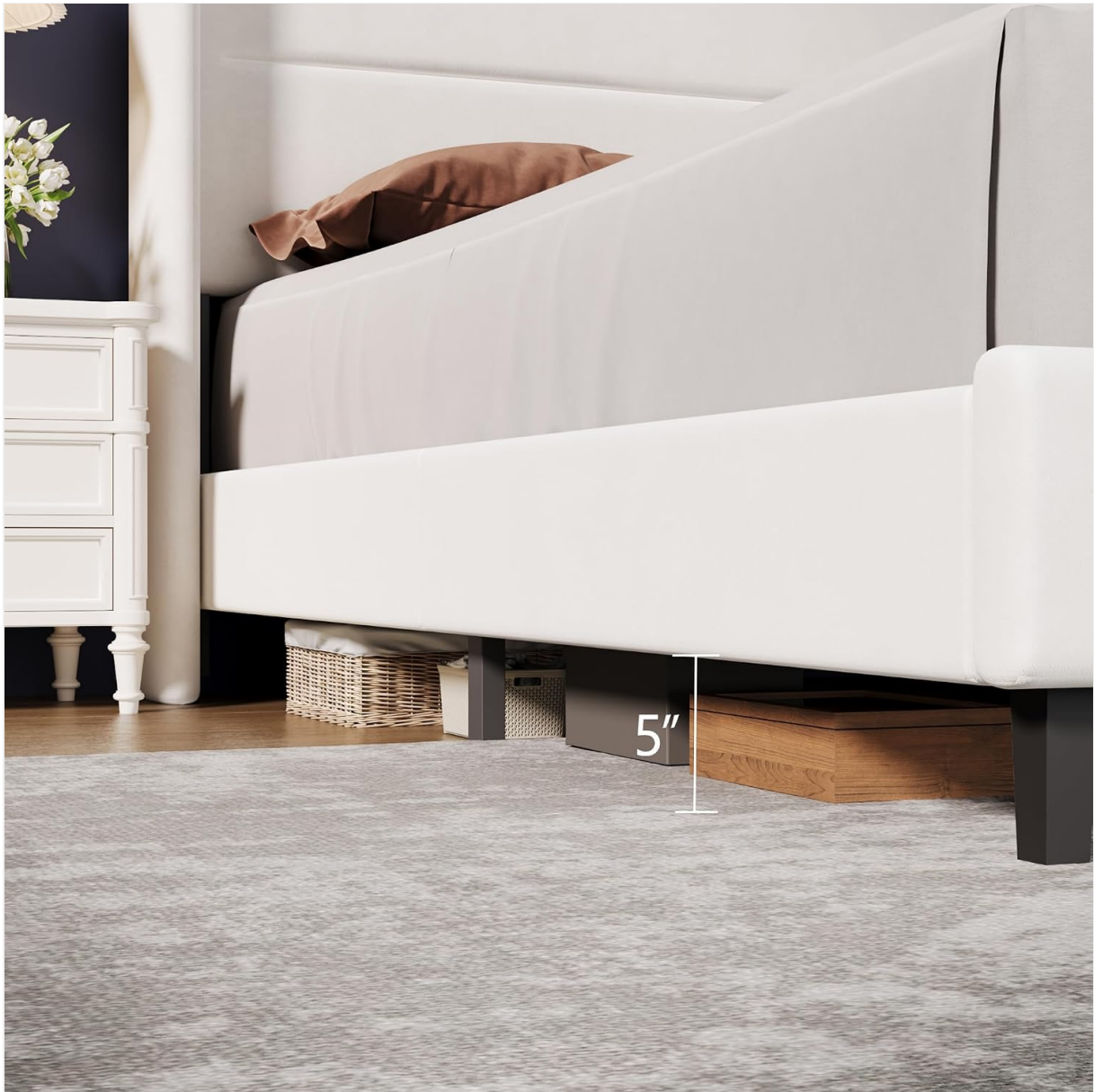
Image: The bed frame illustrating the 5-inch under-bed clearance, suitable for storage or cleaning.