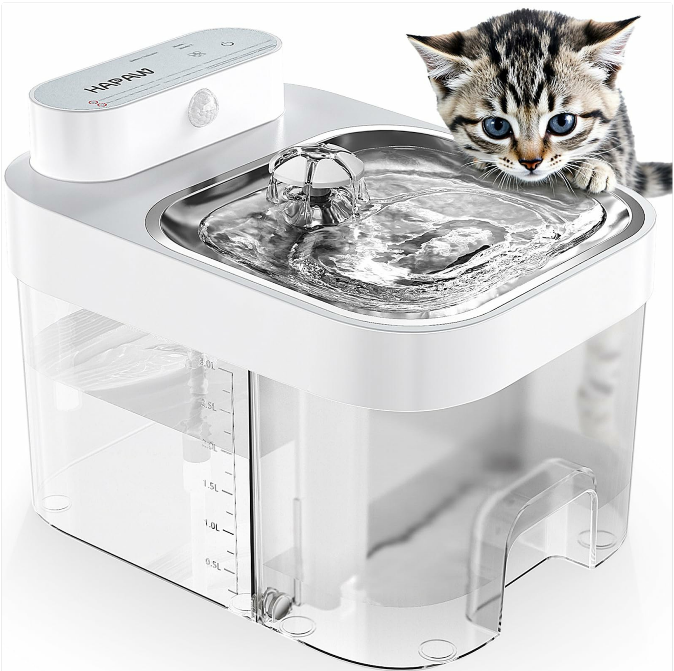
Image: The HAPAW P003 Wireless Cat Water Fountain, a modern and compact design.