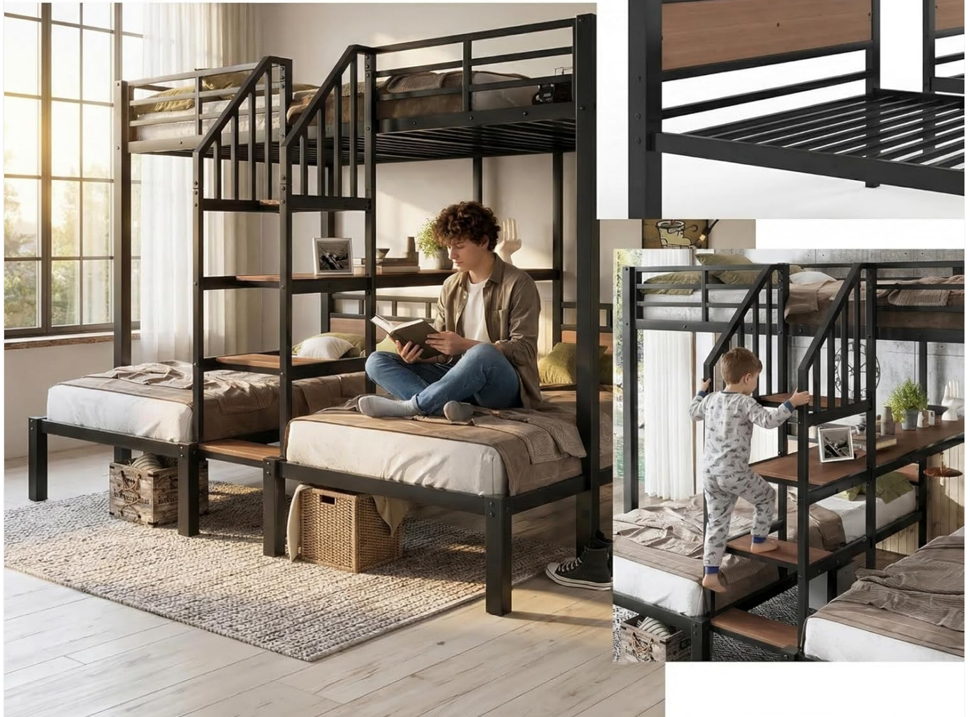
Image: Illustrates the practical use of the bunk bed, showing an individual utilizing the central desk area and a child safely ascending the stairs.

A smart sleep-and-study solution with heavy duty metal frame for three kids or teens.