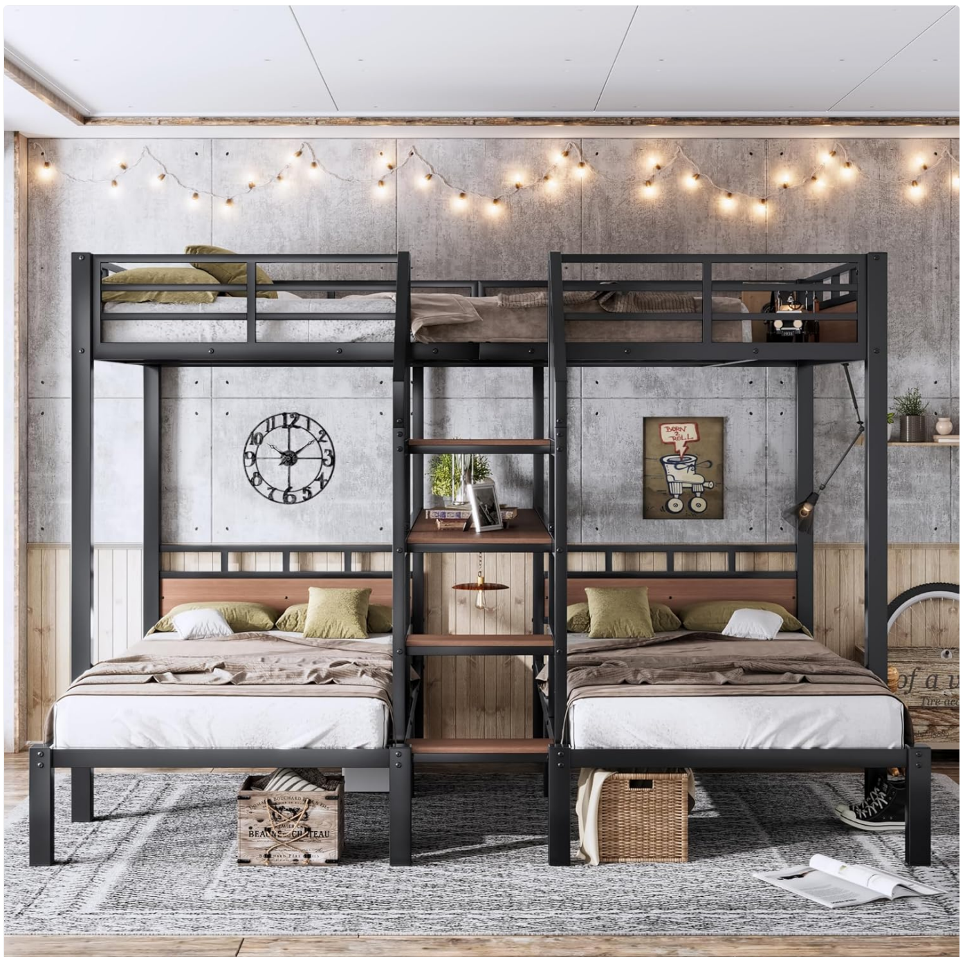
Image: The Bellemave Triple Metal Bunk Bed, showcasing its design with two lower twin beds, an upper full bed, and integrated stairs with shelves.