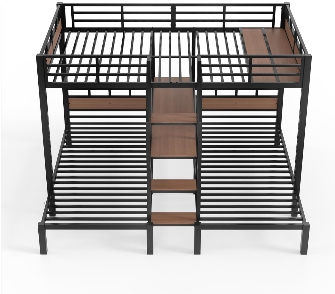
Image: An overhead perspective of the bunk bed frame, showing the layout of the three sleeping areas and the central staircase structure.