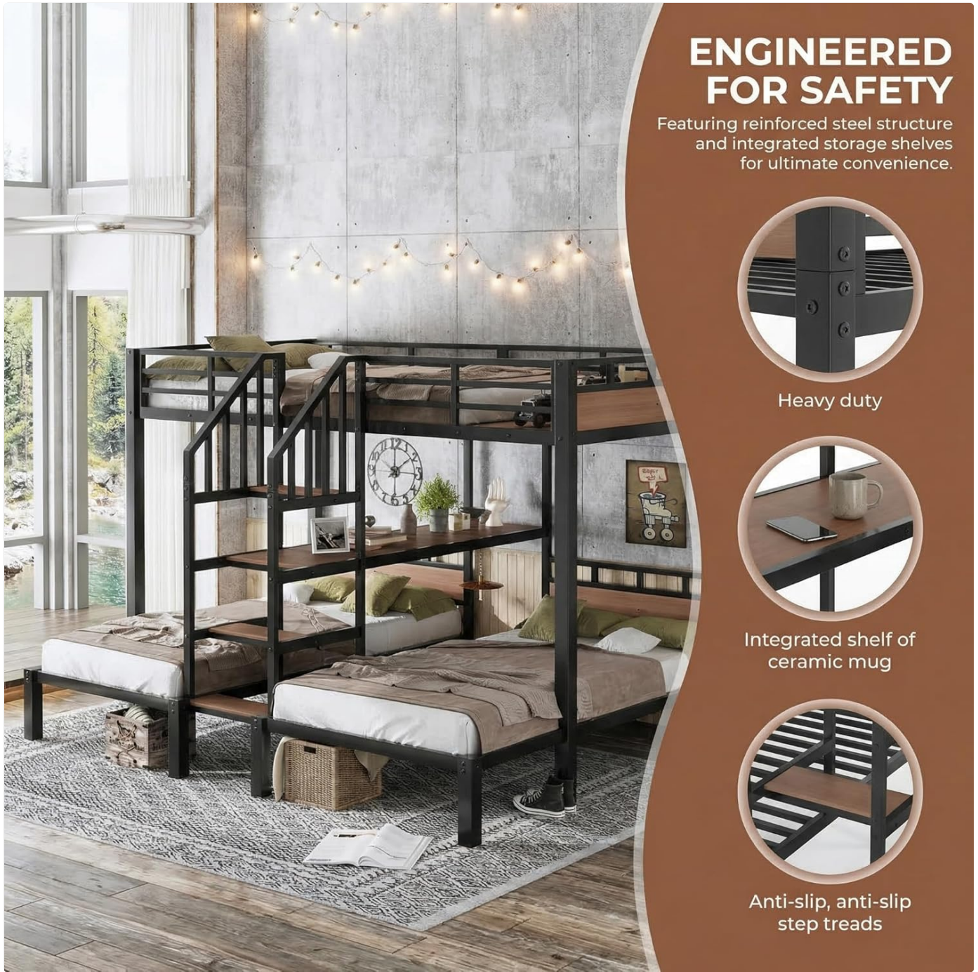
Image: Detailed view highlighting the heavy-duty metal construction, integrated shelves, and anti-slip features of the bunk bed, emphasizing safety and durability.