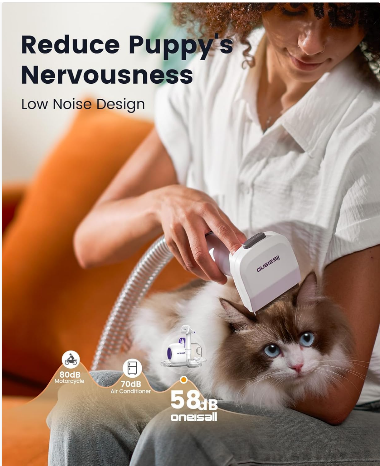
Image 5.2: A person using the oneisall LM5 Dog Vacuum on a cat, emphasizing the device's low noise design for a calmer grooming experience.