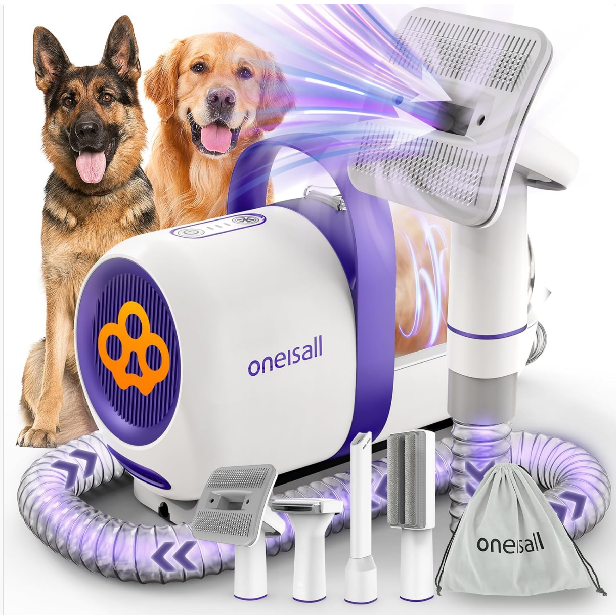
Image 1.2: The oneisall LM5 Dog Vacuum, including various grooming attachments, displayed with two dogs.