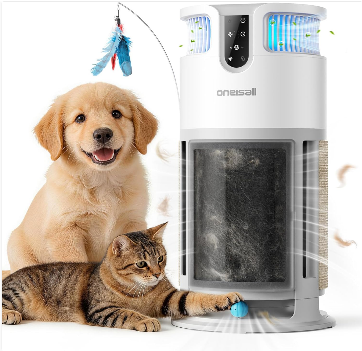
Image 1.1: The oneisall PP04 Pet Air Purifier shown with a puppy and a cat, highlighting its pet-friendly design.