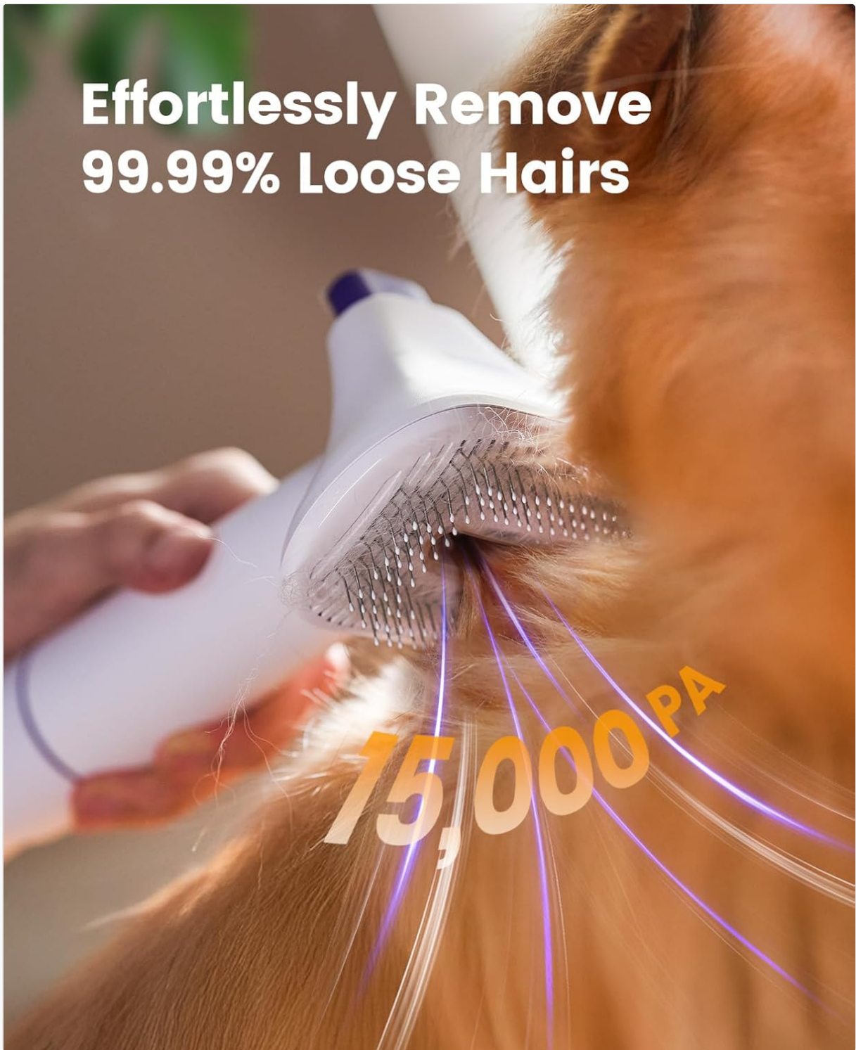
Image 5.1: A close-up view of the oneisall LM5 Dog Vacuum in use, demonstrating its ability to remove loose hair from a dog's coat.