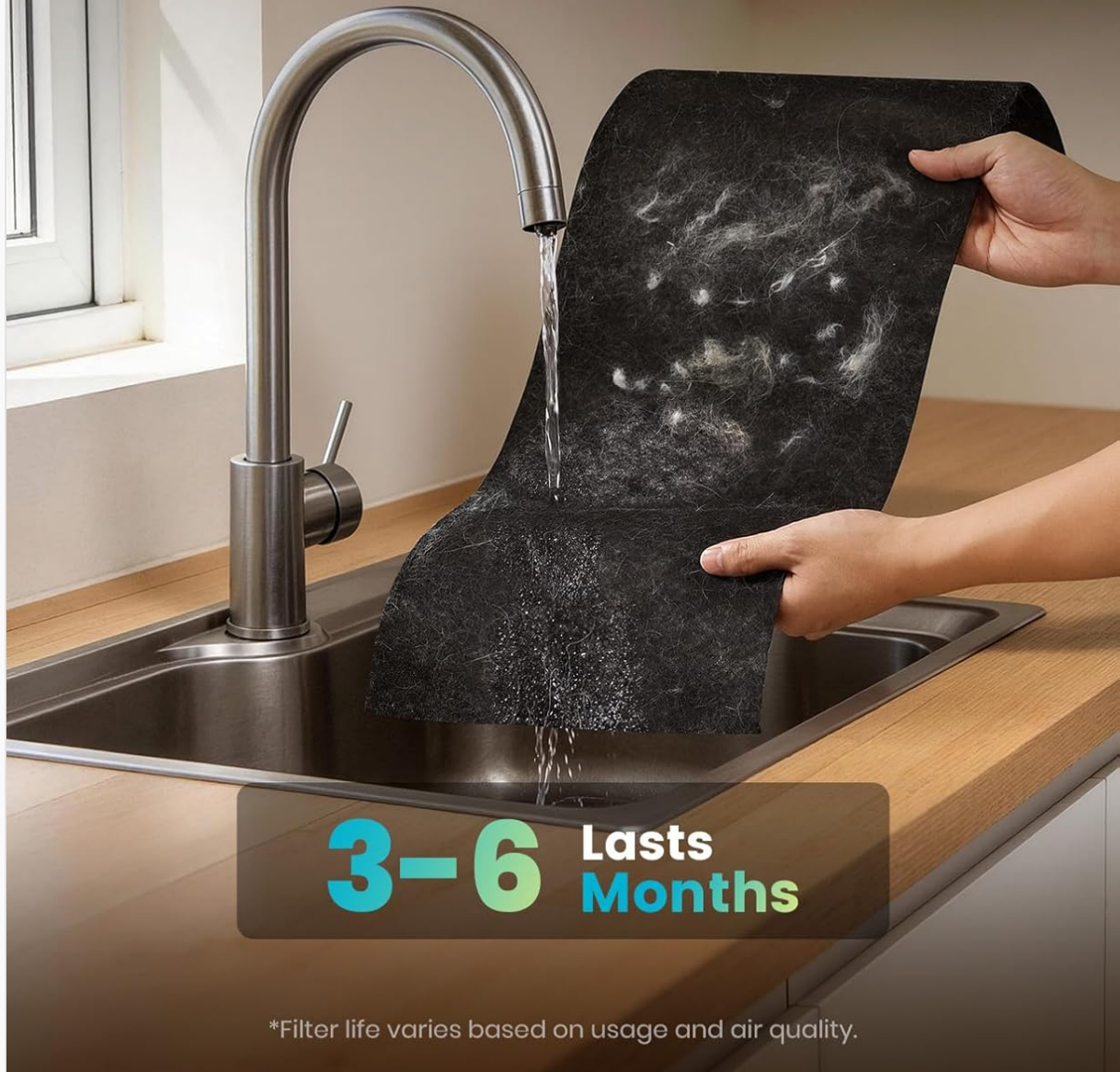
Image 6.2: A person washing the reusable pre-filter of the oneisall PP04 under running water, demonstrating the cleaning process.