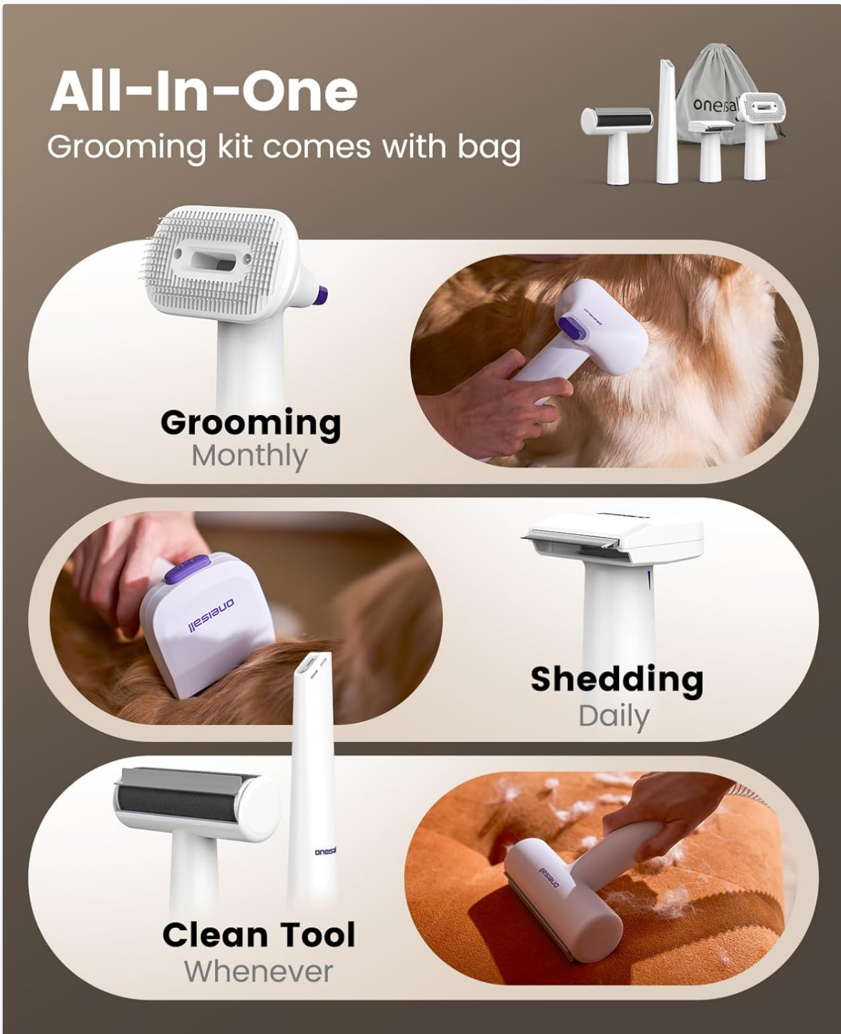
Image 3.2: An overview of the oneisall LM5 Dog Vacuum grooming kit, showcasing its various attachments for different grooming and cleaning needs.