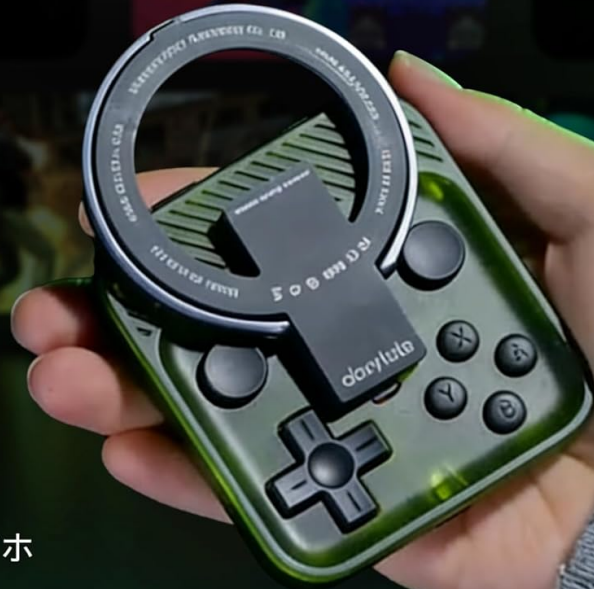
Image: Overview of abxylute M4 features and device compatibility.