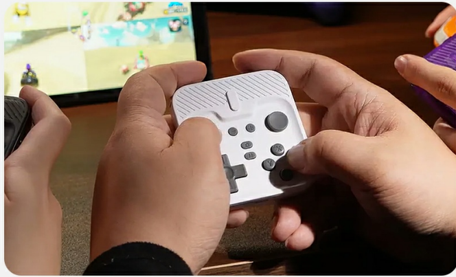
Image: Setup for NS mode, compatible with various emulators and Switch consoles.