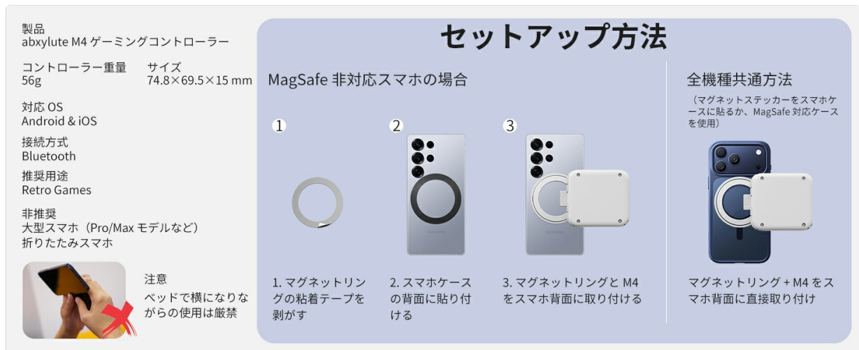
Image: The abxylute M4 controller attached to a smartphone, demonstrating its compact design and full control layout.