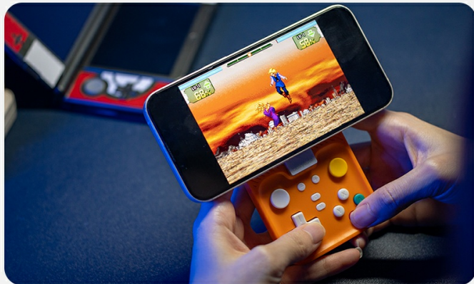
Image: Setup for PS mode, ideal for CODM and PS Remote Play on Android and iOS.