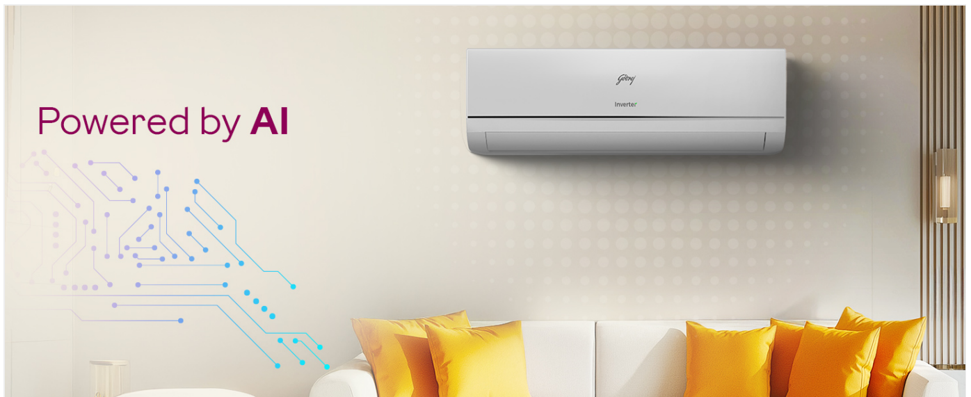
Image: The Godrej Inverter Split AC, highlighting its AI Powered cooling capability.