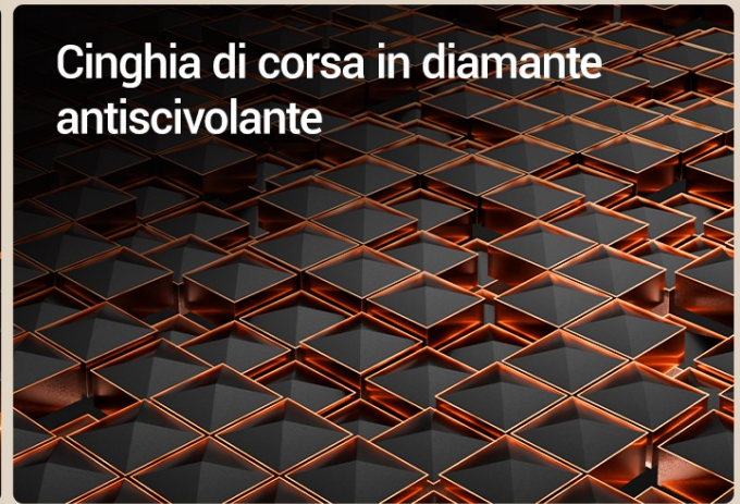
Image: Close-up views of the Umay L20 treadmill's multi-layer running belt and its anti-slip diamond pattern for enhanced grip and safety.