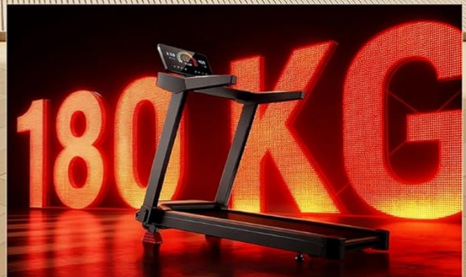
Image: Details of the UMay L20 treadmill's 3.5 HP brushless motor, highlighting its power, quiet operation (<45dB), and 180 kg weight capacity.