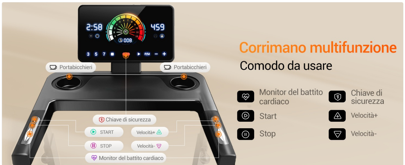
Image: The digital display interface showing various control options and settings menu in a dark theme with white text.