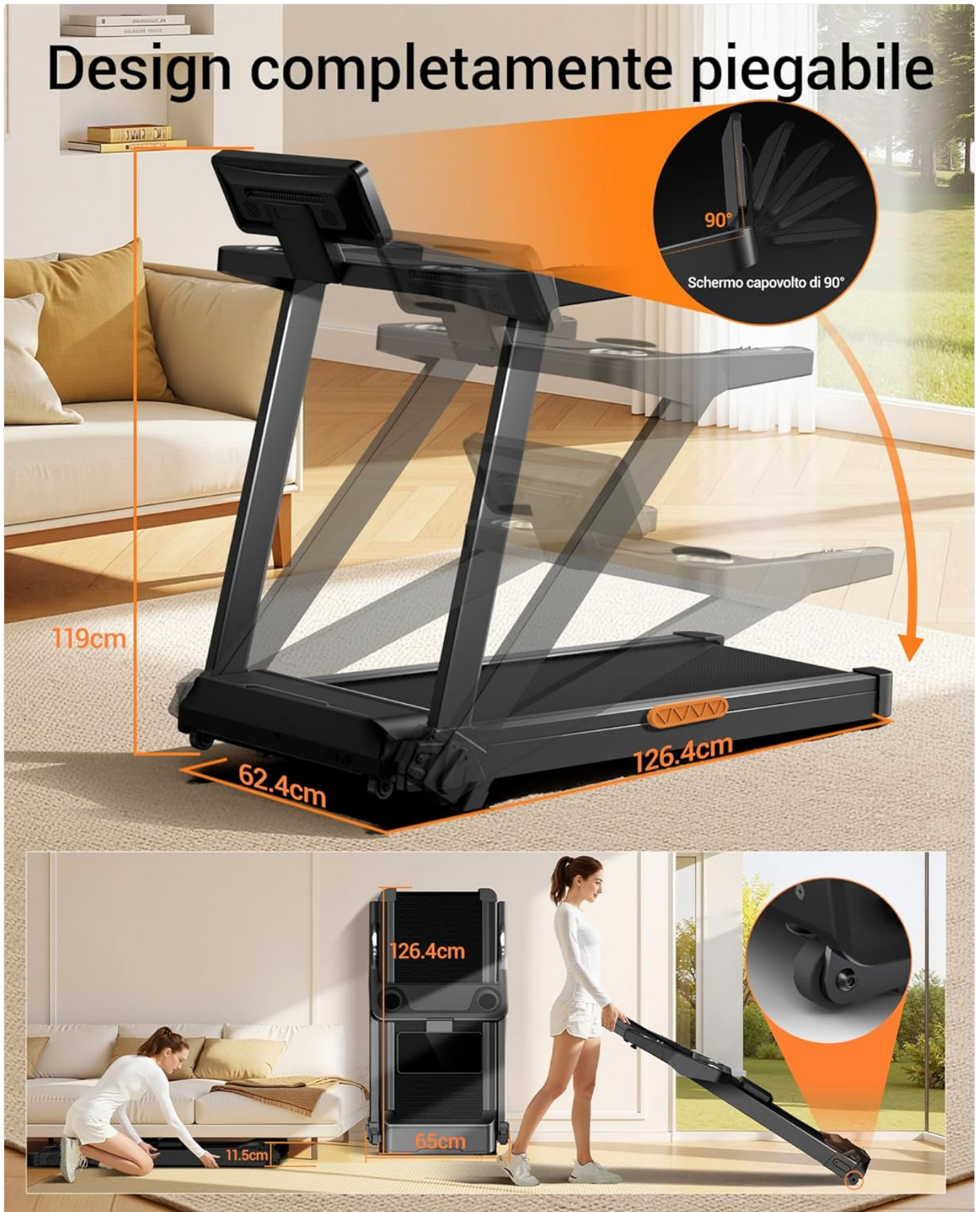
Image: A sequence showing the Umay L20 treadmill being folded from an upright position to a compact, flat storage position, and then being moved using its transport wheels.

4. Utilize the transport wheels to move the folded treadmill to a storage location, such as under a bed or against a wall.