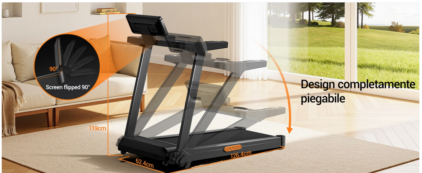
Image: The Umay L20 treadmill folded flat, demonstrating its compact storage capabilities, such as under a bed.