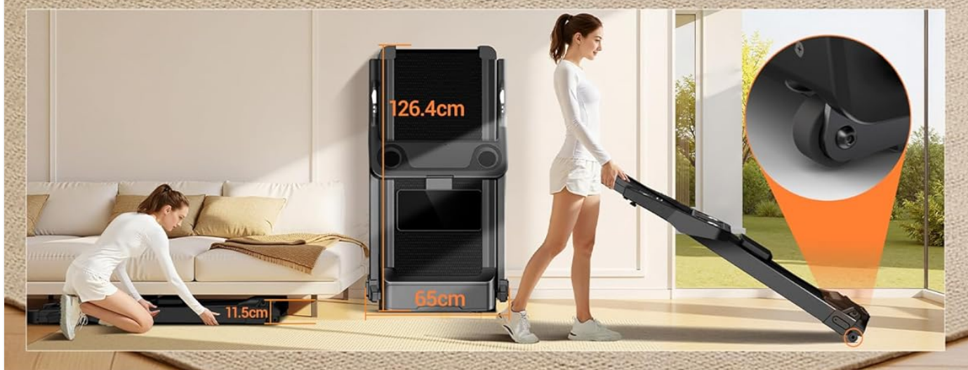
Image: Illustration of the treadmill's folding mechanism, showing how it can be folded vertically for storage and unfolded for use.