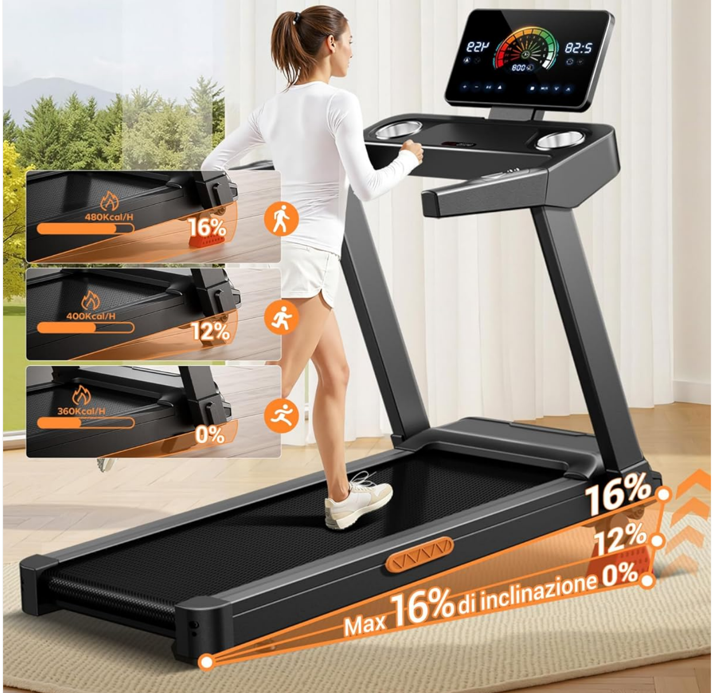
Image: A user running on the Umay L20 treadmill, illustrating the 0-16% manual incline feature and its impact on calorie burn.