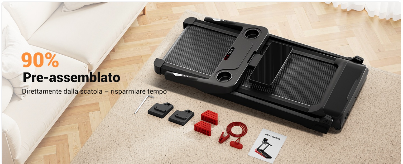
Image: The UMAX L20 treadmill is largely pre-assembled, showing the main unit, safety key, and user manual.