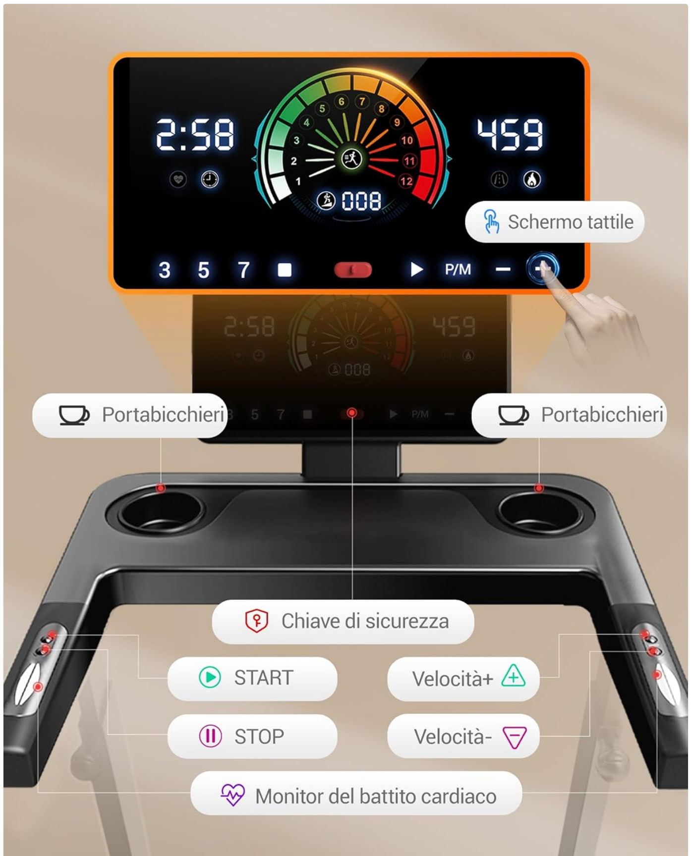
Image: Close-up of the treadmill's console and handlebar, highlighting the heart rate sensors, speed controls, start/stop buttons, and safety key slot.