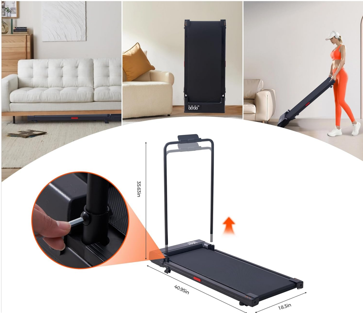
Image: Detailed view of attaching the handlebar to the walking pad treadmill using screws and an L-wrench.

Detachable Handle Design Provides Significant Space Savings