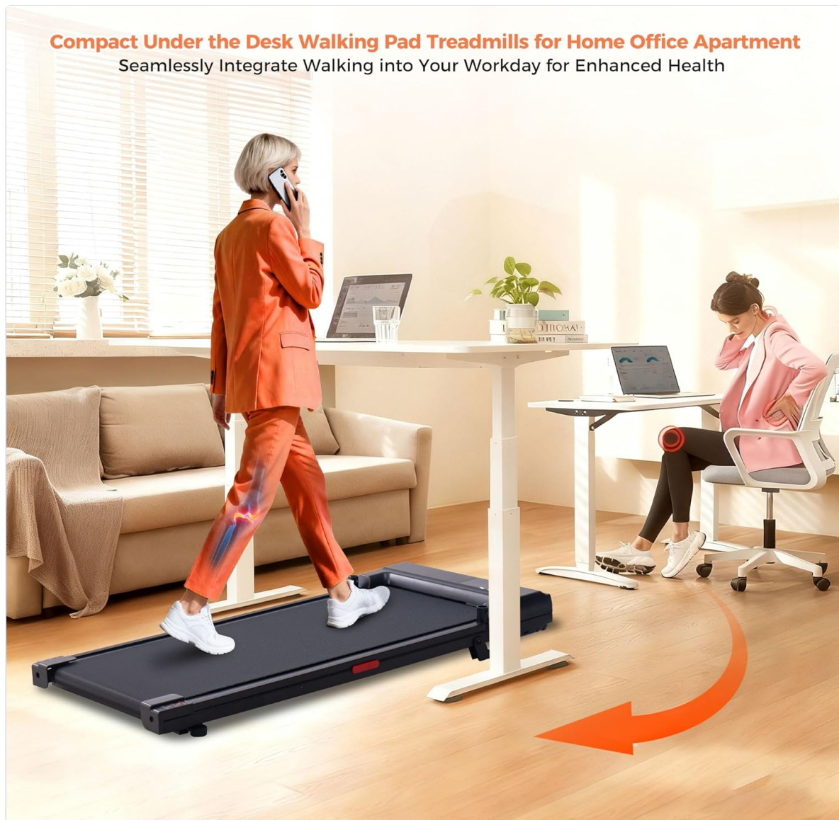
Image: A person walking on the SUOER T300 treadmill while working at a standing desk, demonstrating its under-desk functionality.