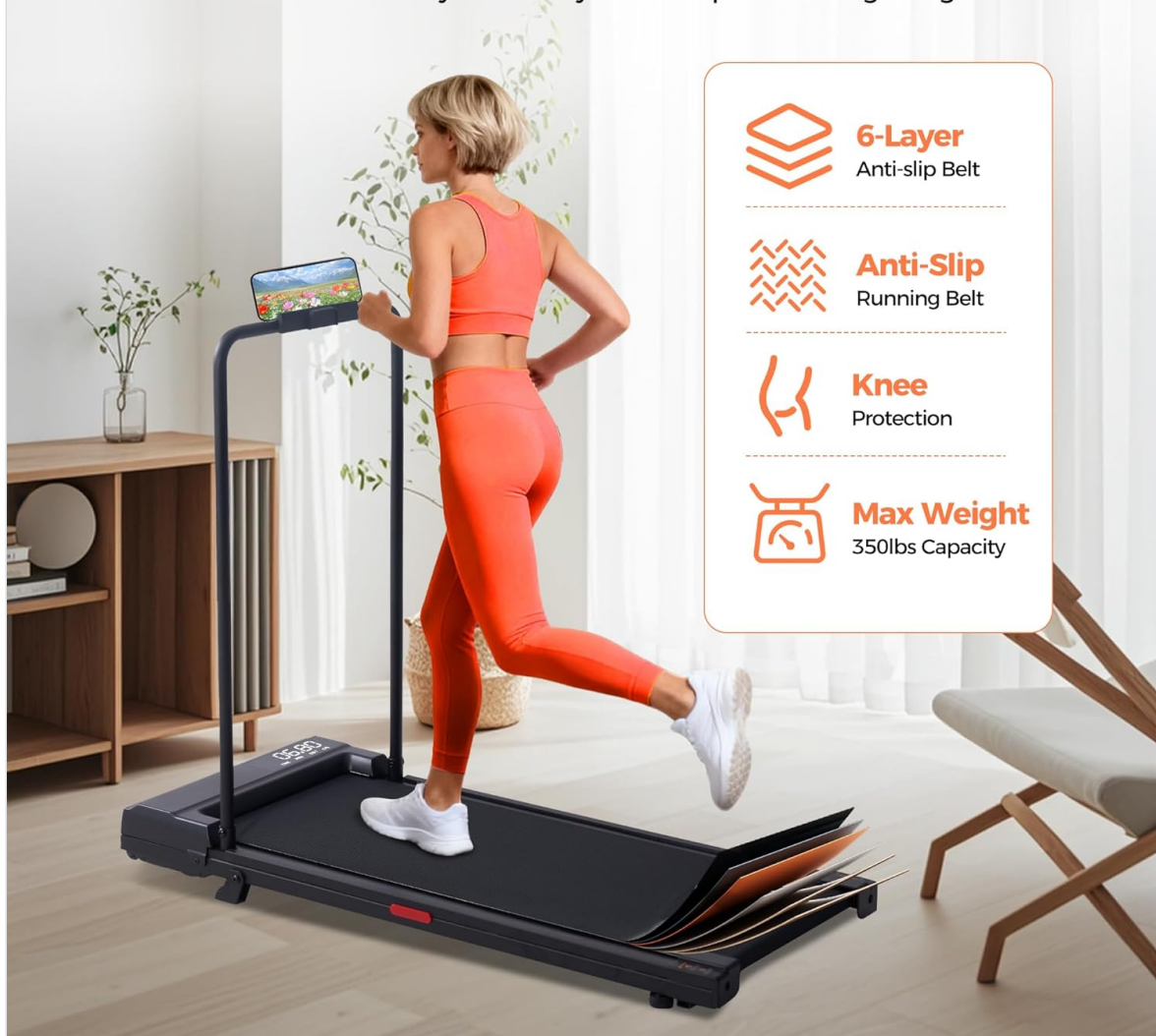
Image: Diagram illustrating the 6-layer anti-slip cushioning design of the treadmill belt for knee protection and comfort.

Run Comfortably with 6-Layer Anti-Slip Cushioning Design