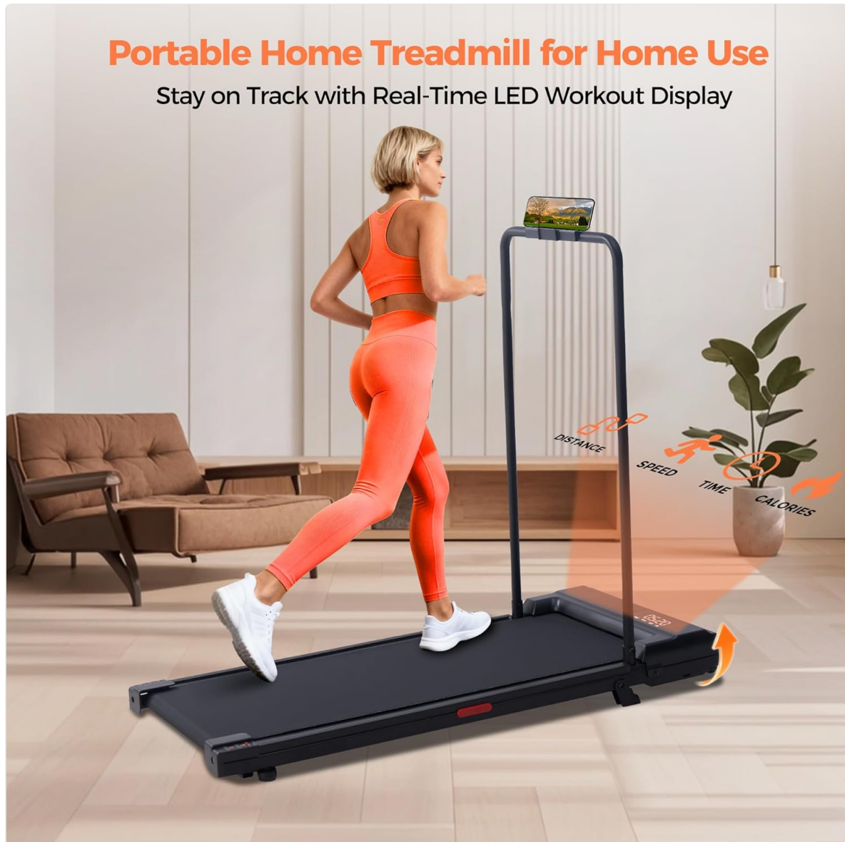
Image: LED display showing speed, distance, time, and calories burned during a workout on the walking pad treadmill.

Video: This video demonstrates the remote control functions, including starting the treadmill, adjusting speed, and cycling through display modes.