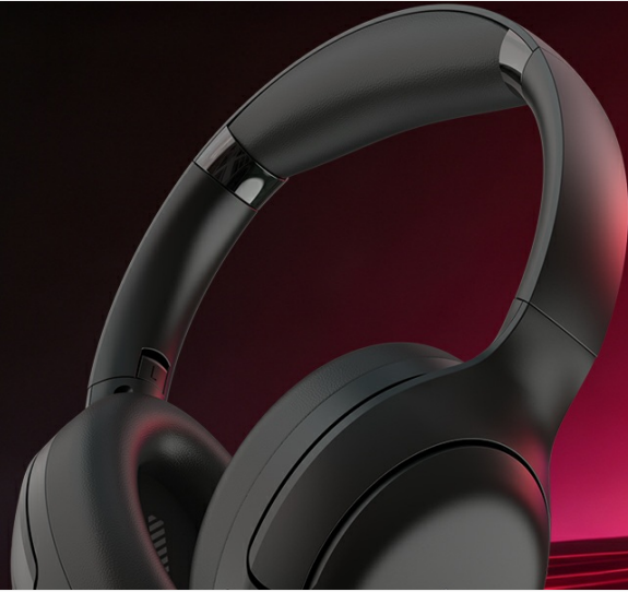
Image: Monster Harmonic N22 Headphones. This image displays the overall design of the headphones.

Hybrid Active Noise Cancelling Headphones