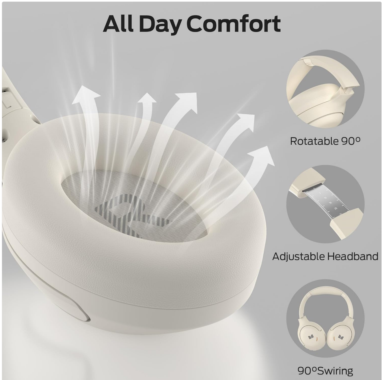
Image: Headphones demonstrating their foldable and adjustable design, highlighting portability and comfort features.