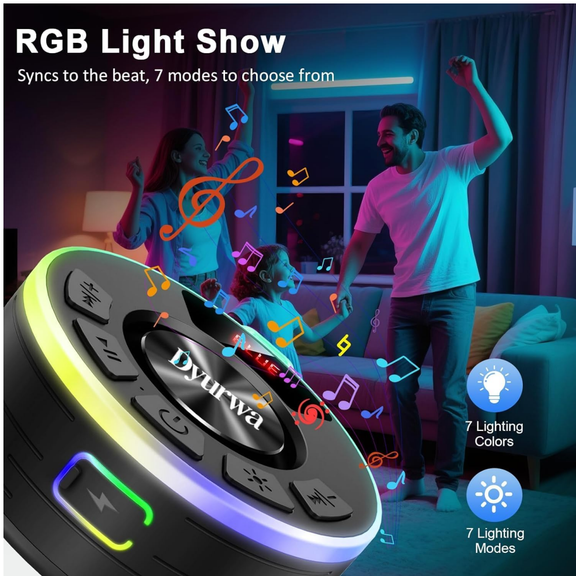
Image: The Dyurwa ZY-01 speaker displaying its vibrant RGB light show, with musical notes and people dancing in the background, illustrating its party atmosphere feature.

Syncs to the beat, 7 modes to choose from