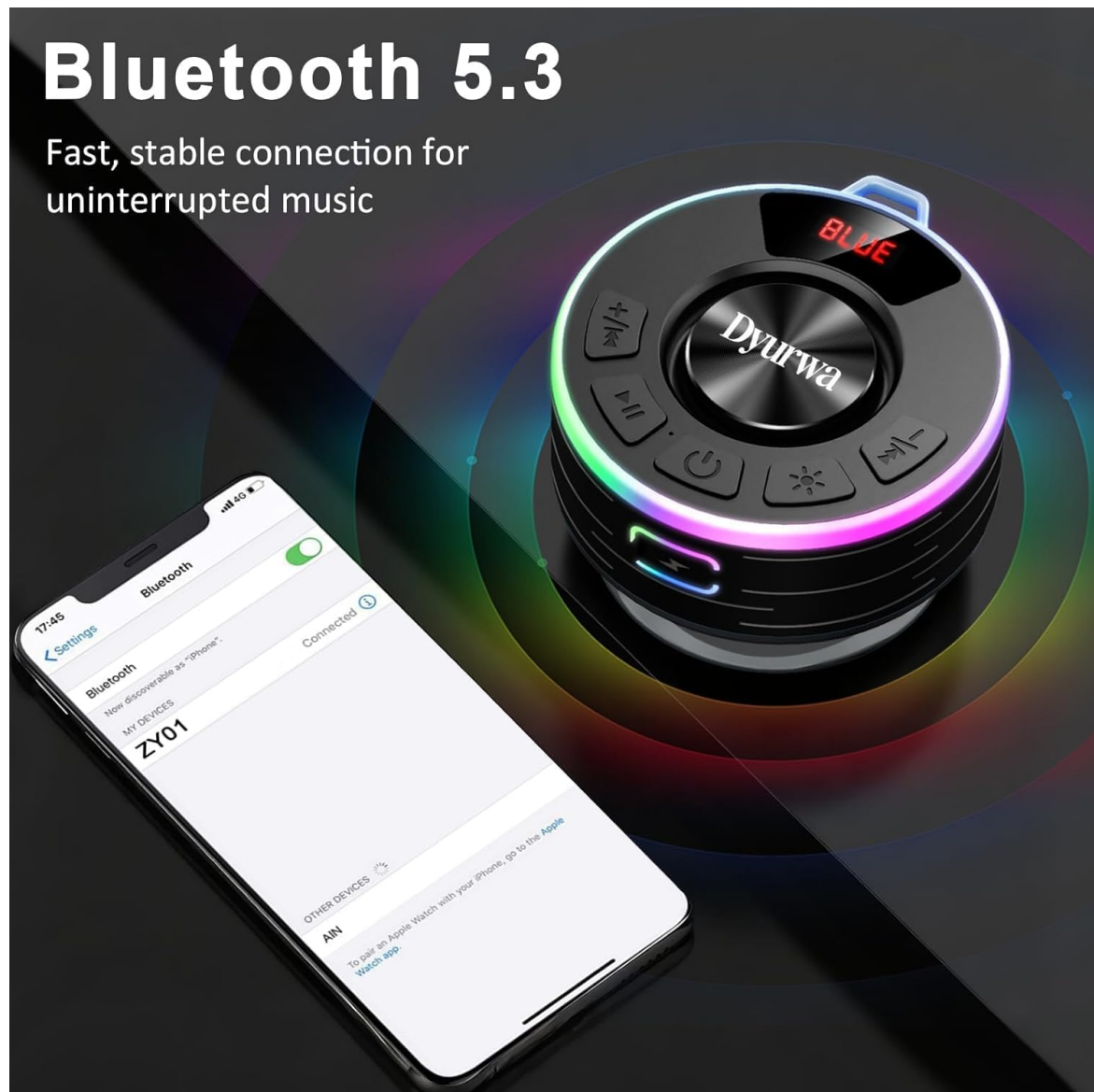
Image: The Dyrwa ZY-01 speaker displaying 'BLUE' on its LED screen, positioned next to a smartphone with its Bluetooth settings open, showing 'ZY01' as a connected device.