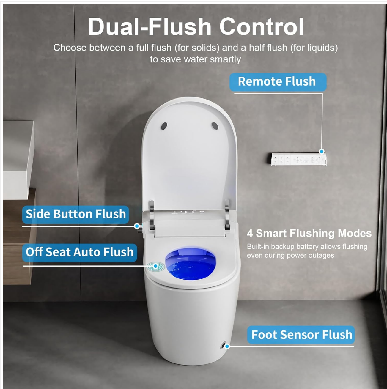
Image: Illustration of the four smart flushing modes: Remote Flush, Side Button Flush, Off Seat Auto Flush, and Foot Sensor Flush. It also highlights the built-in backup battery.