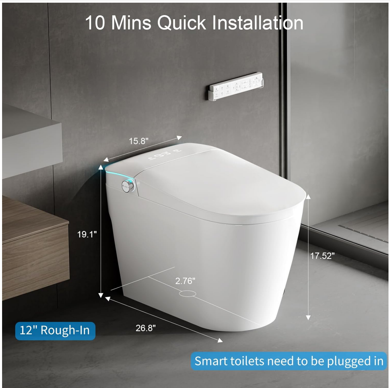
Image: The Vipbear Smart Toilet with key dimensions (26.8"D x 15.8"W x 19.1"H) and a note about 12" rough-in and the need for electrical plug-in. This illustrates the compact design and installation requirements.