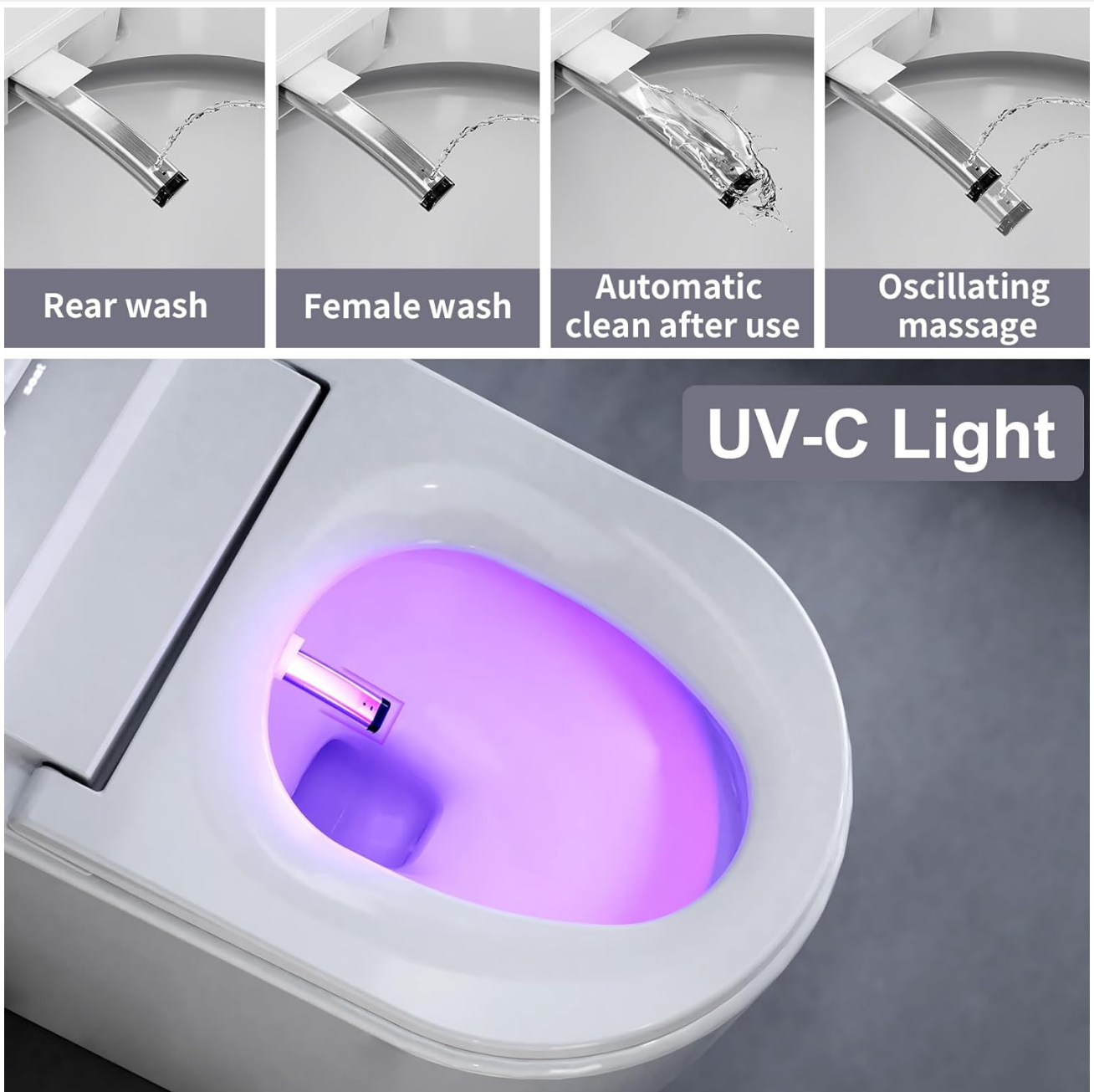
Image: Demonstrates the bidet functions including Rear wash, Female wash, Automatic clean after use, and Oscillating massage. It also shows the UV-C light sterilizing the bowl.