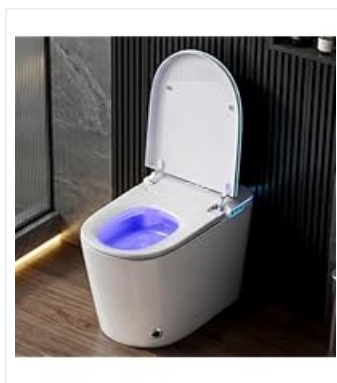
Image: Close-up view of the foam shield in the toilet bowl, illustrating its anti-splash, odor blocking, and anti-stick benefits.