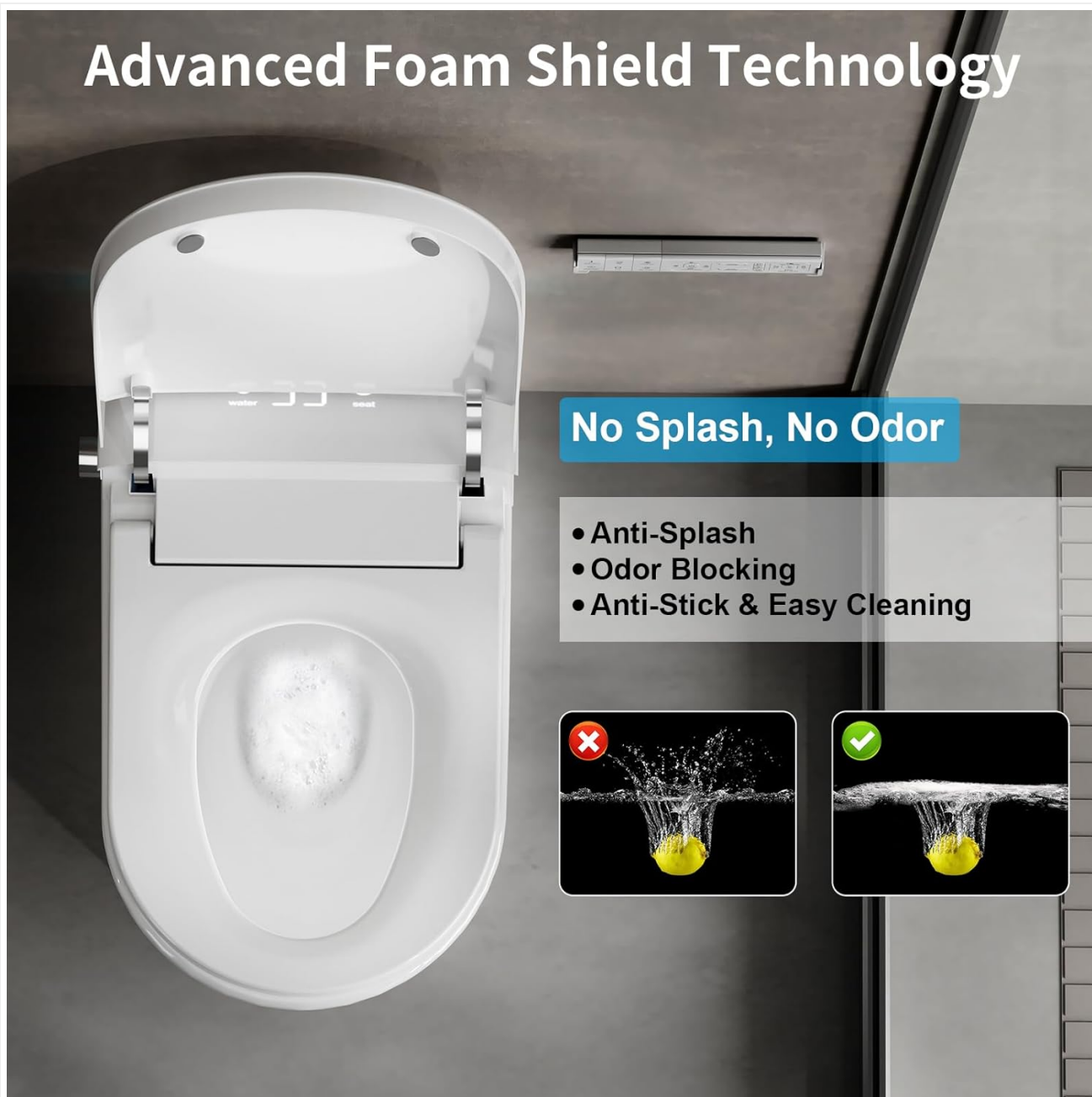
Image: Demonstrates the Advanced Foam Shield Technology, showing how it prevents splash, blocks odor, and offers anti-stick properties for easy cleaning.