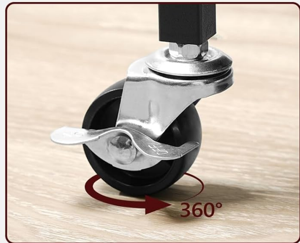
Image: A close-up view of the lockable universal wheels on the file cabinet, demonstrating their 360-degree movement and the locking mechanism.