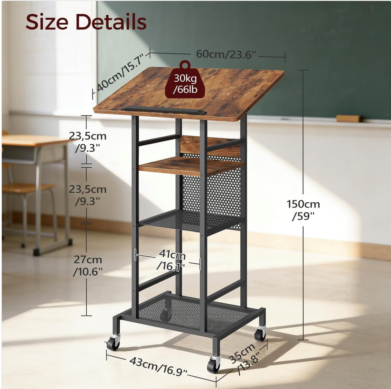
Image: A diagram illustrating the detailed dimensions and top weight capacity of the MAHANCRIS Podium Stand.