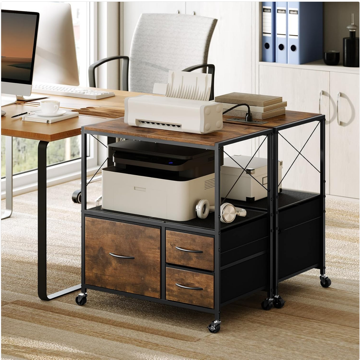
Image: The MAHANCRIS File Cabinet, fully assembled, positioned next to a desk in an office environment. It features a rustic brown top surface, black metal frame, and two types of fabric drawers. A printer is placed on its top shelf.