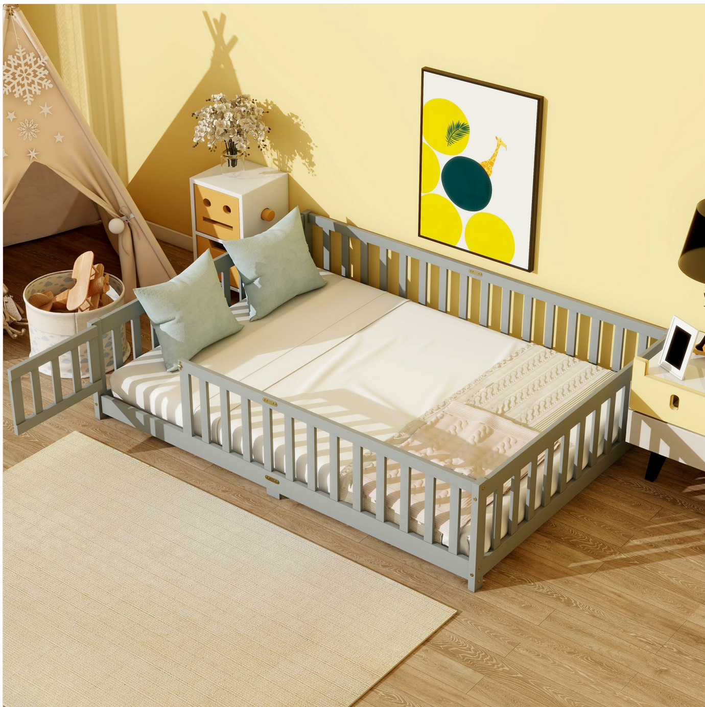
Image 3.1: The Flieks Full Size Floor Bed in Grey, featuring a protective fence and an accessible door.