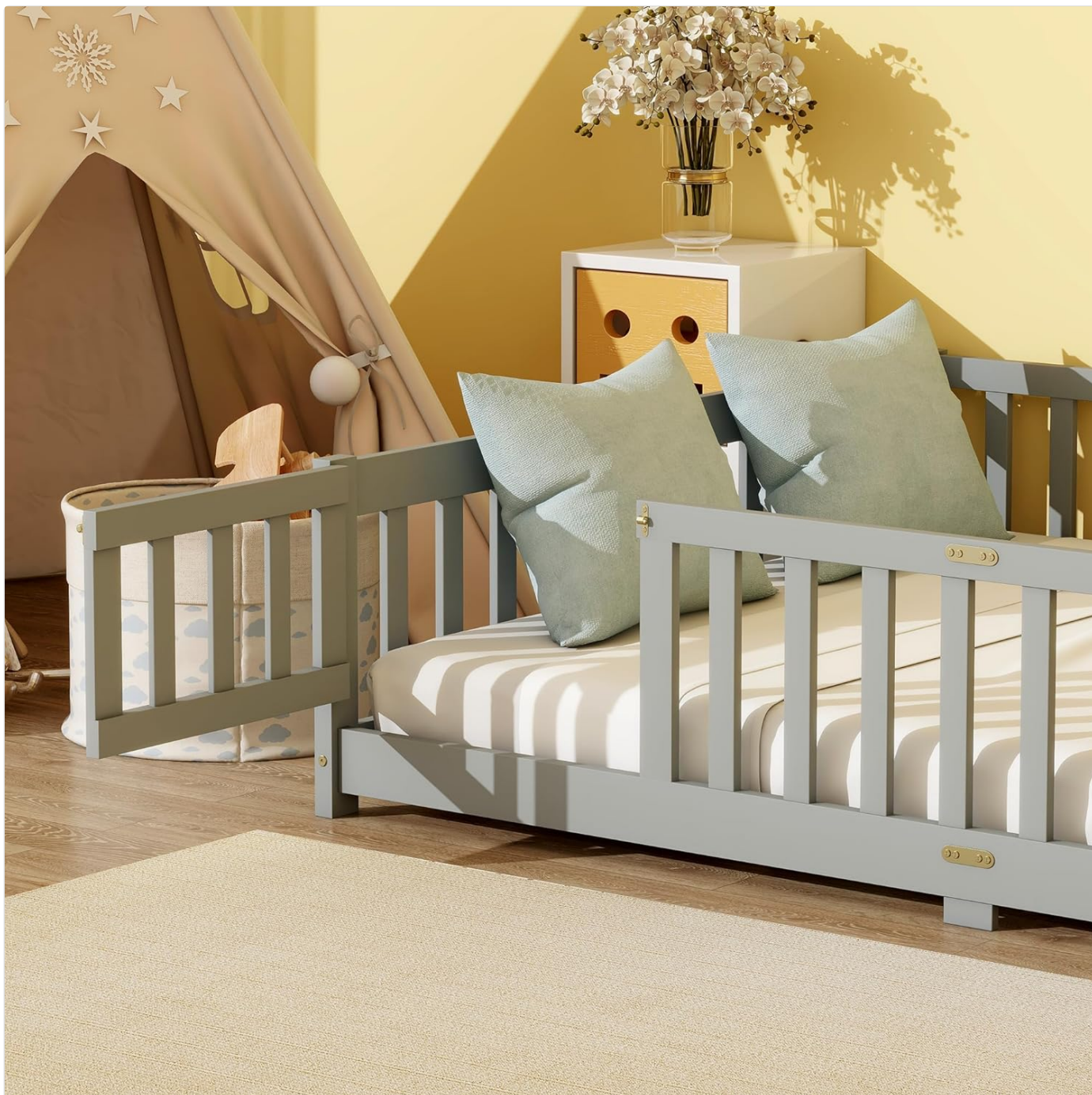
Image 4.3: The Flieks Full Size Floor Bed with its revolving door in the open position, illustrating easy access.