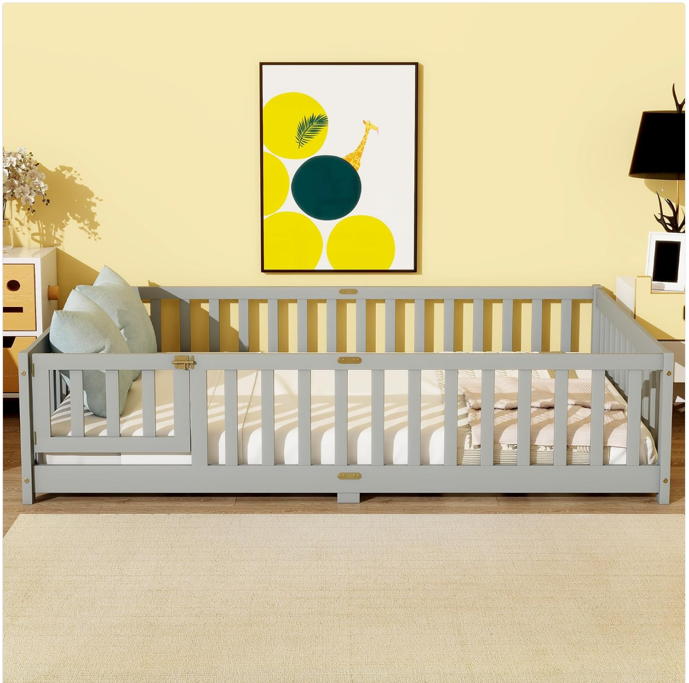
Image 3.2: The Flieks Full Size Floor Bed integrated into a child's bedroom setting, showcasing its low profile and safety features.