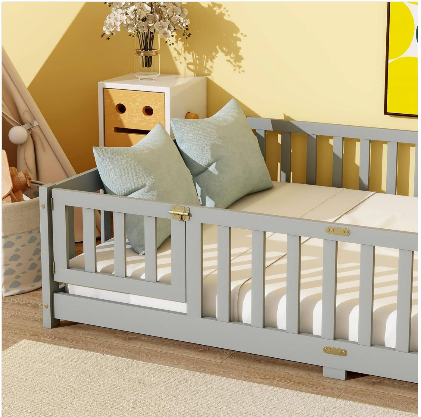
Image 4.2: Close-up view of the steel latch mechanism on the bed's door, designed for secure closure.