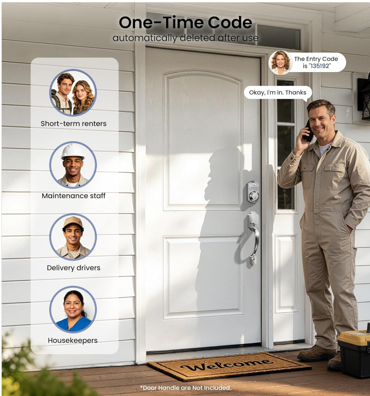
Image: A scenario depicting the use of a one-time code for temporary access, suitable for various service providers.