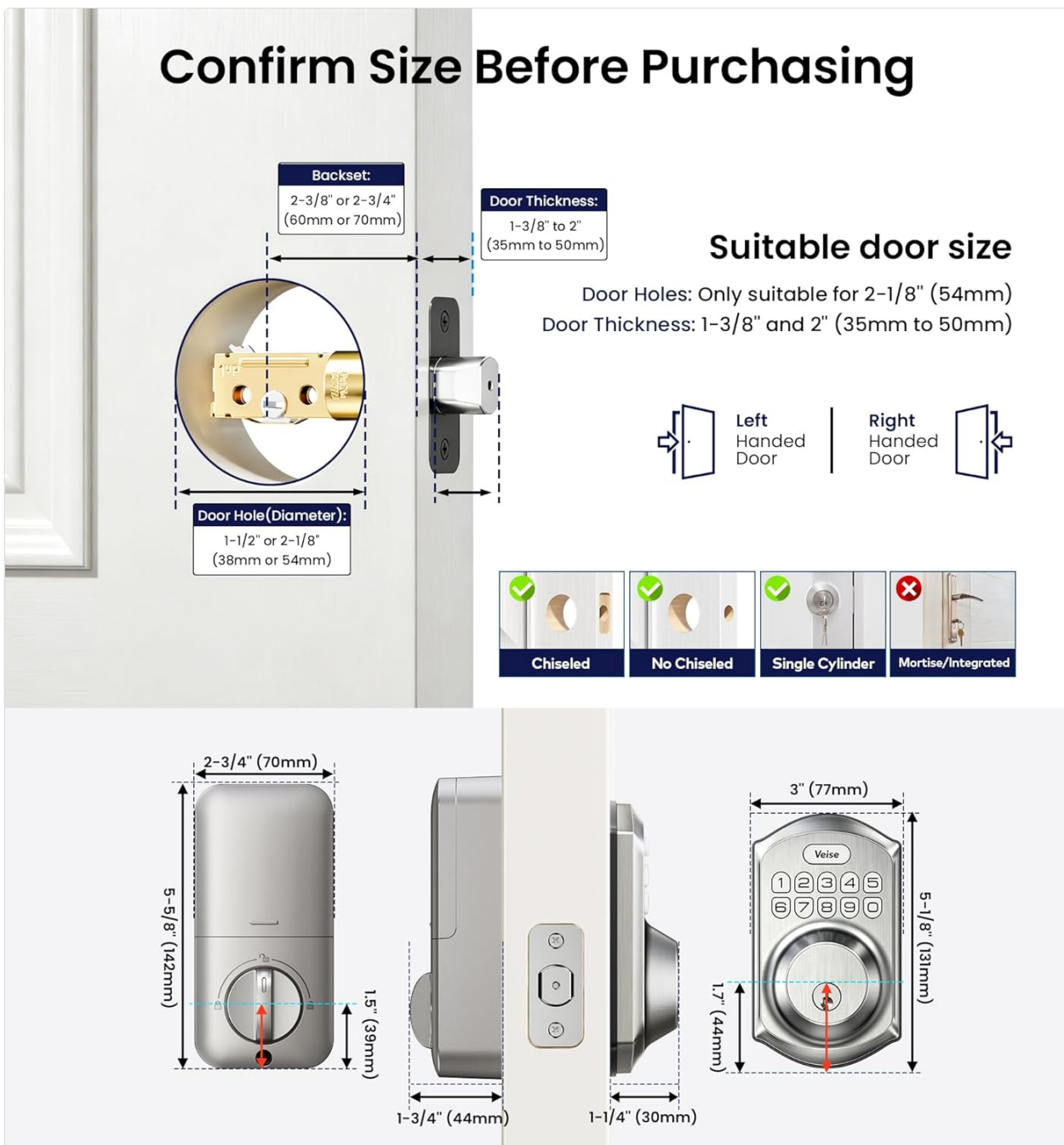
Image: Diagram illustrating door hole diameter, thickness, and backset measurements for installation.