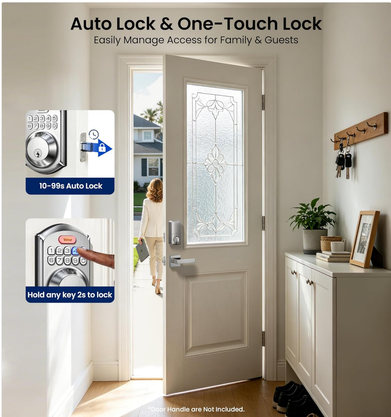
Image: The Veise VE001 lock demonstrating its auto-lock feature with a timer and the one-touch lock function.

Easily Manage Access for Family & Guests