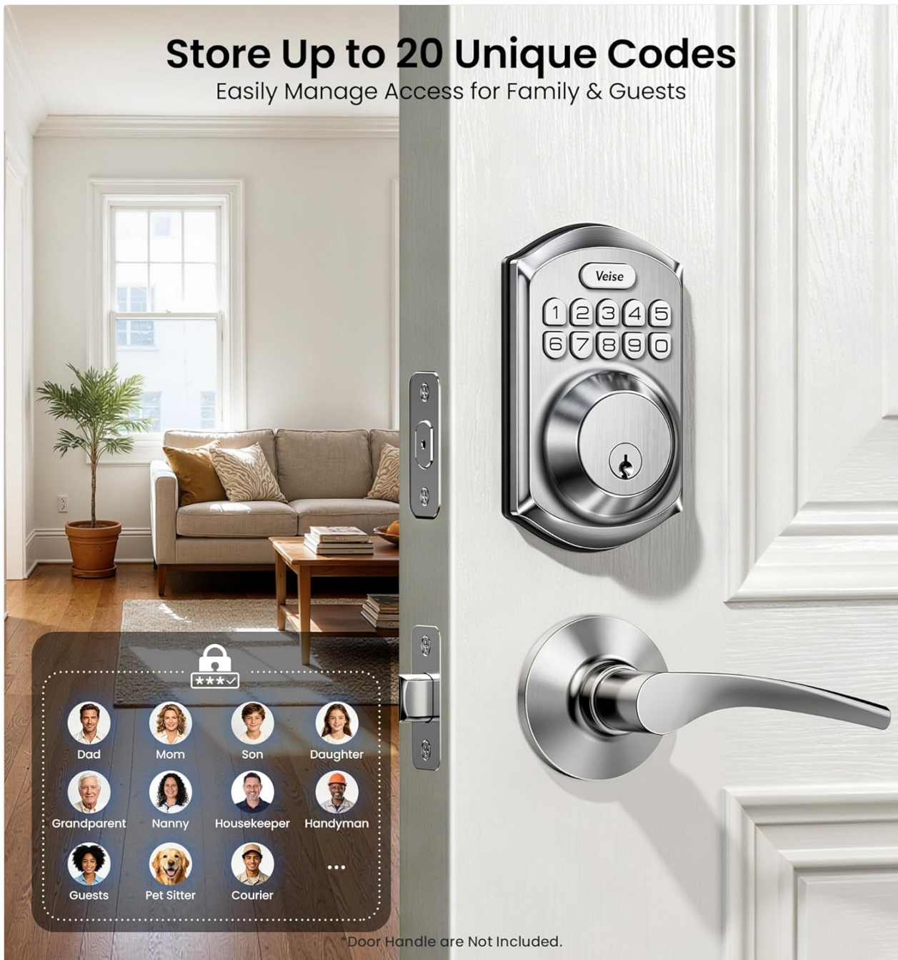
Image: The Veise VE001 lock with an overlay graphic illustrating the ability to store up to 20 unique access codes for various users.

You can program up to 20 unique user codes for family members or regular access. Each code should be 4-10 digits long.