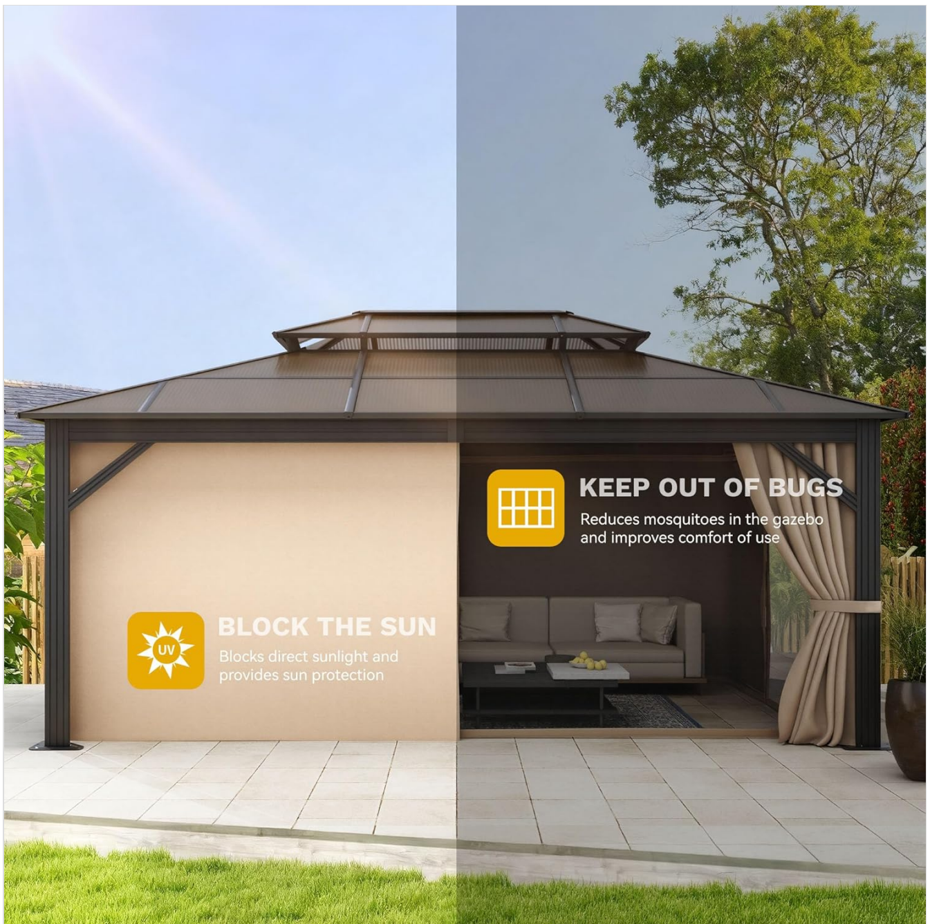
Image: A split image of the gazebo, demonstrating how the curtains block direct sunlight and the netting reduces mosquitoes for improved comfort.