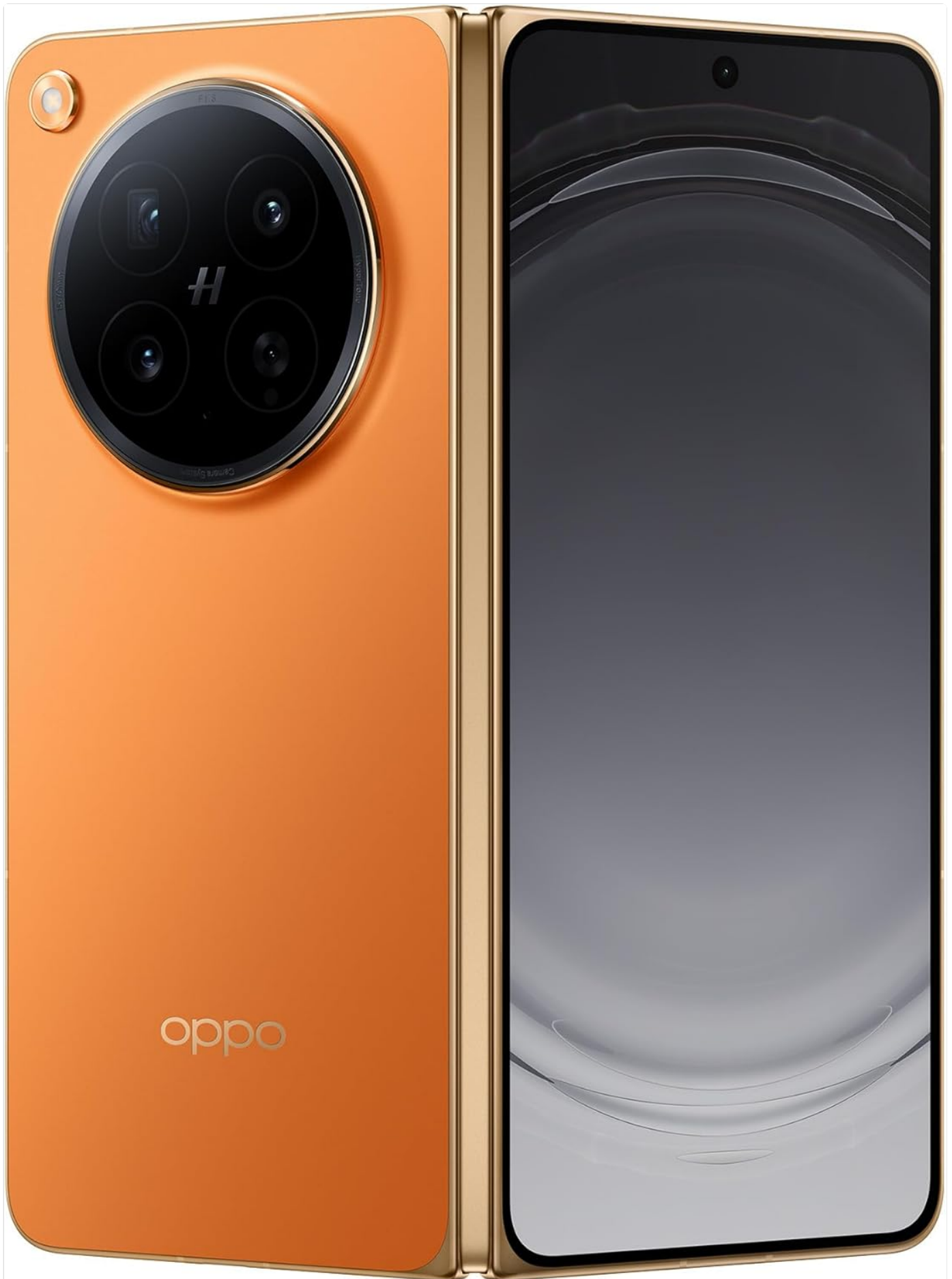
Figure 3.1: Rear view of the OPPO Find N6, highlighting the advanced multi-lens camera system.