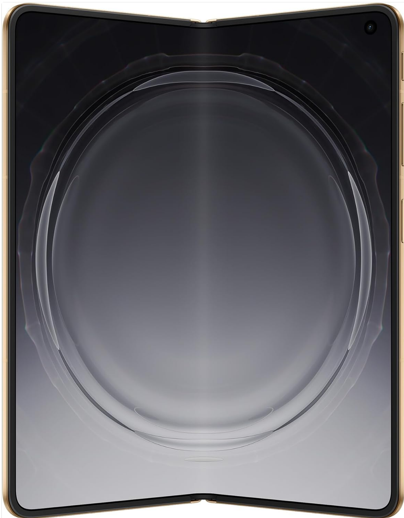
Figure 2.1: The OPPO Find N6 5G CPH2765 smartphone in its folded configuration, showcasing the cover screen and sleek design.