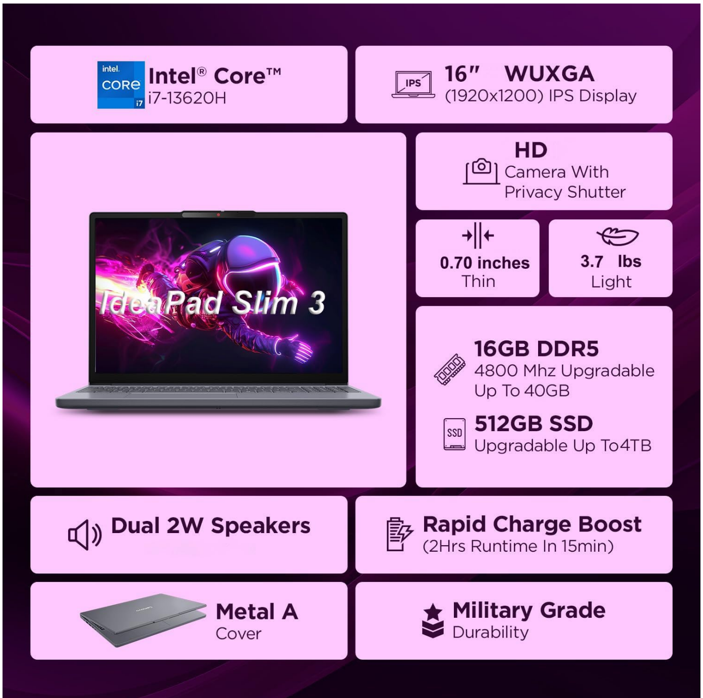
Image 1.1: Overview of the Lenovo IdeaPad Slim 3 laptop and its features.