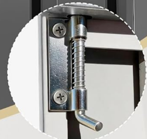
Spring Latch Pin