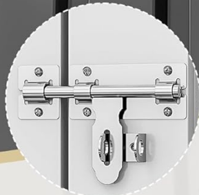
Stainless Steel Bolt Lock