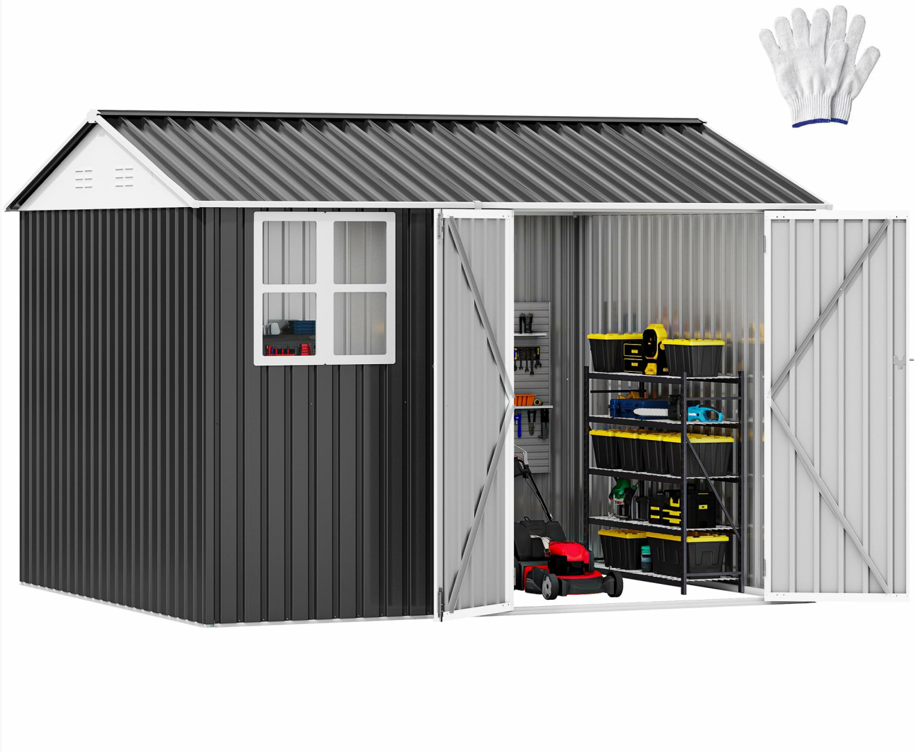
Figure 1: Fully assembled DWVO 10x8ft storage shed with open doors, showcasing its spacious interior and window.