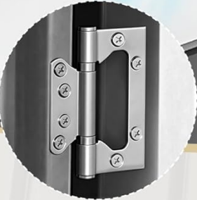
Stainless Steel Hinge