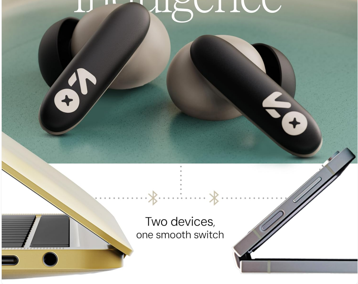
Image: The GOBOULT Y1 v2.0 earbuds connected to both a laptop and a smartphone, illustrating the dual device pairing feature.