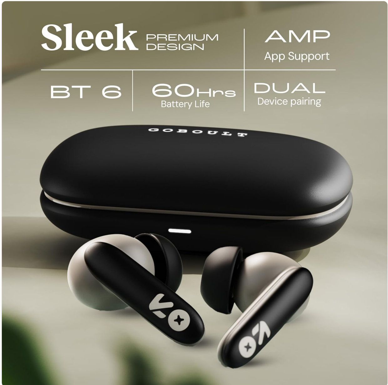
Image: Overview of GOBOULT Y1 v2.0 features including sleek design, AMP App support, Bluetooth 6.0, 60 hours battery life, and dual device pairing.