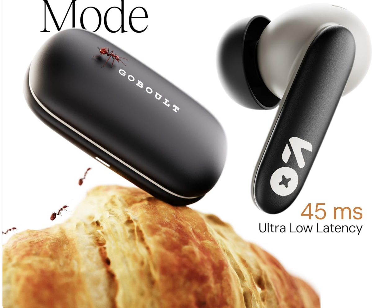
Image: The GOBOULT Y1 v2.0 earbuds illustrating the 45ms ultra-low latency Gaming Mode.