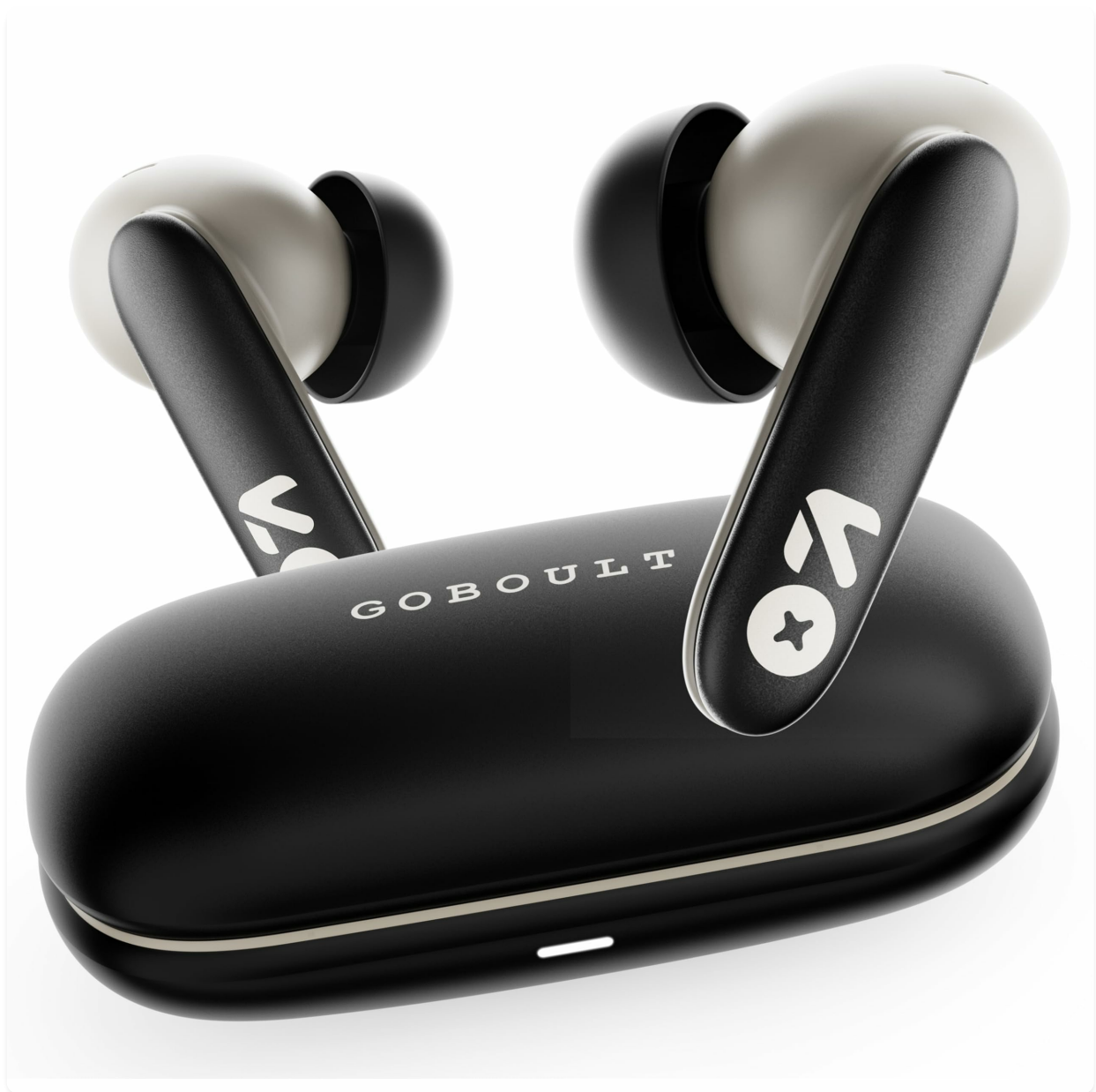
Image: GOBOULT Y1 v2.0 Wireless Earbuds and their charging case, showcasing the sleek design.