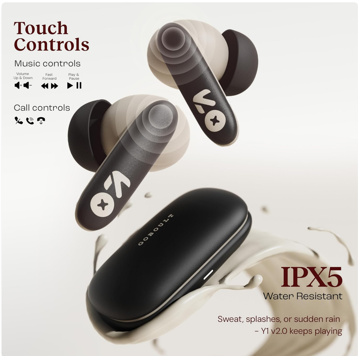
Image: Visual representation of touch controls for music playback and call management, along with the IPX5 water resistance rating.