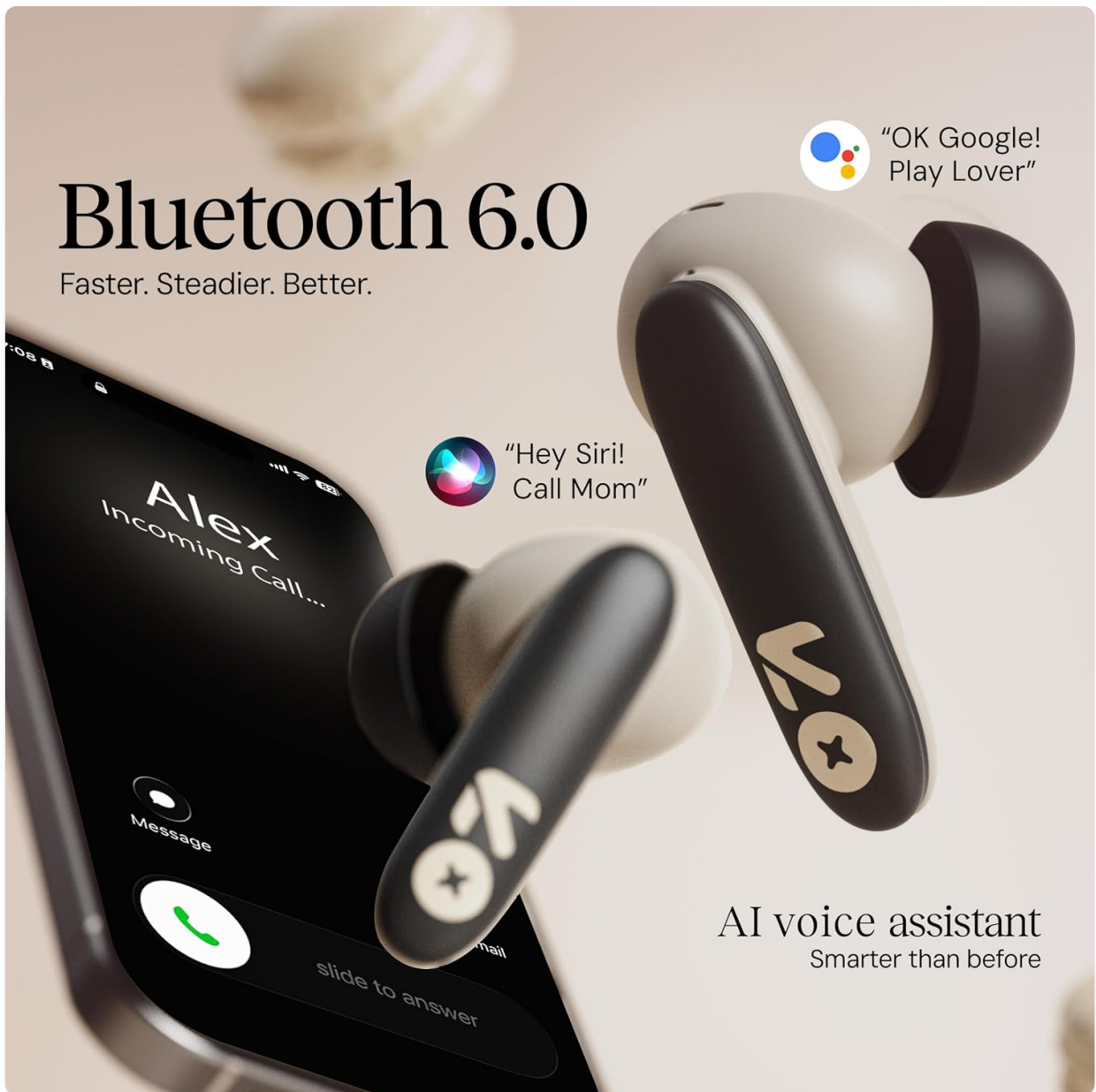
Image: The GOBOULT Y1 v2.0 earbuds highlighting Bluetooth 6.0 for stable connection and integration with AI voice assistants like Siri and Google Assistant.