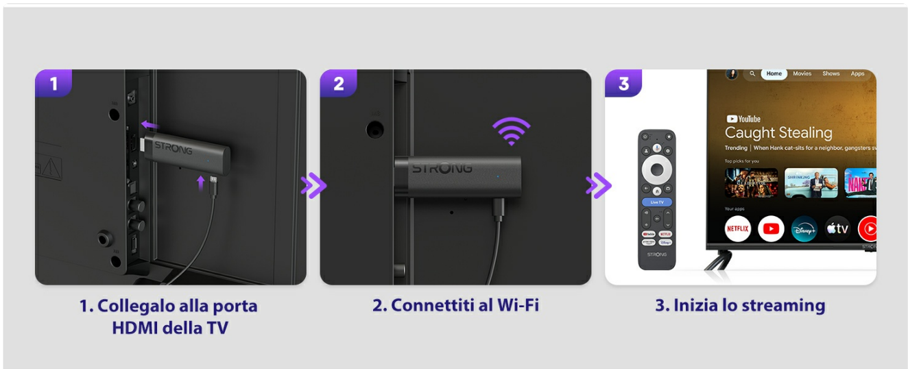
Image: A three-step visual guide demonstrating how to set up the TV Stick: 1. Connect to TV's HDMI port, 2. Connect to Wi-Fi, 3. Start streaming.