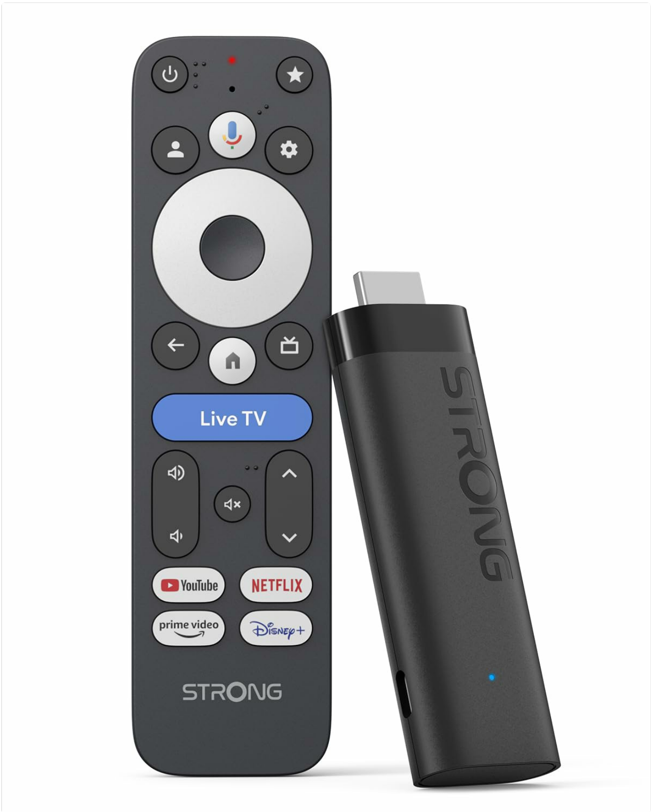
Image: The STRONG LEAP-NOVA-X TV Stick, a compact black streaming device.