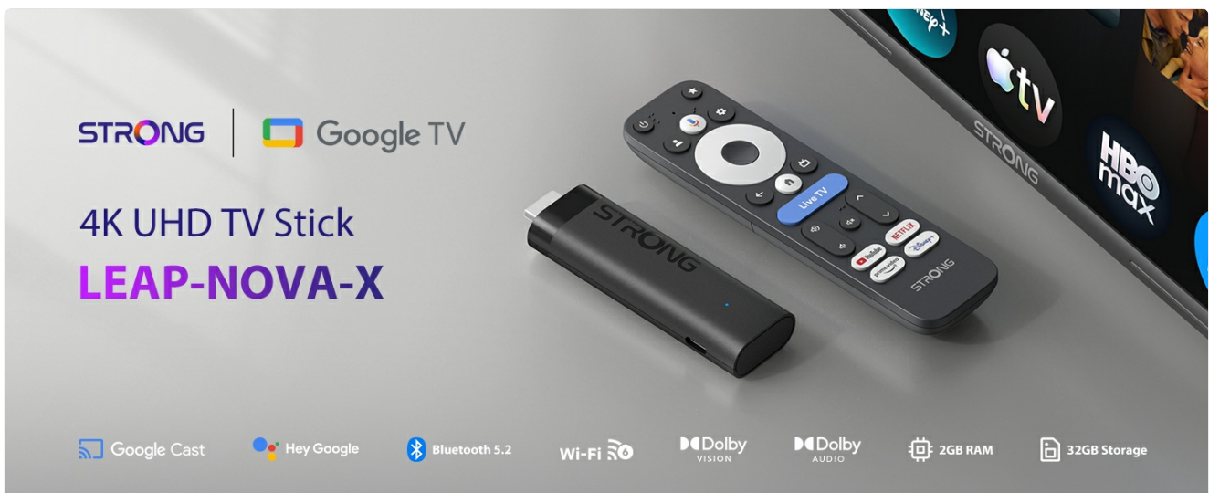
Image: A television displaying the Google TV interface with various streaming app icons, including Netflix, Disney+, and YouTube.

The LEAP-NOVA-X TV Stick uses the Google TV interface, which organizes content from all your streaming services into one personalized home screen. Use the directional pad on your remote to navigate through menus, select apps, and browse content.