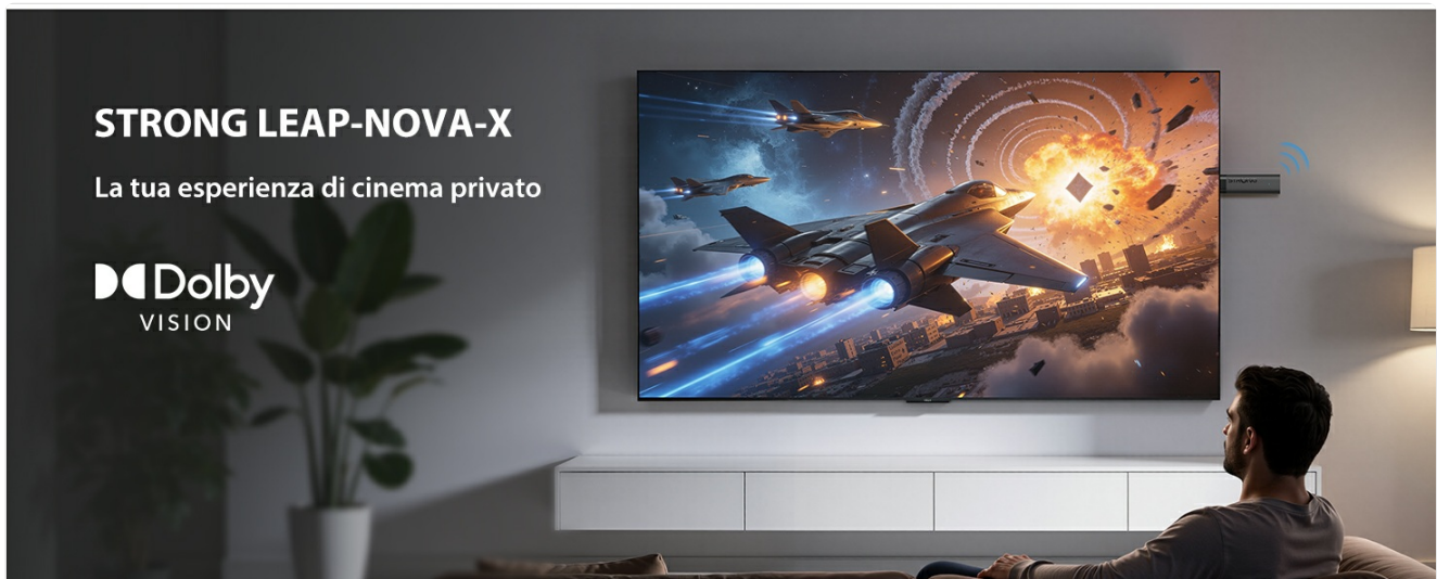
Image: A man watching an action movie with fighter jets on a television, illustrating the immersive visual experience with Dolby Vision.

Enjoy stunning 4K Ultra HD resolution (3840 x 2160 pixels) with exceptional clarity and detail. Support for Dolby Vision and HDR10+ delivers extraordinary contrast, vibrant colors, and enhanced brightness for a cinematic viewing experience.