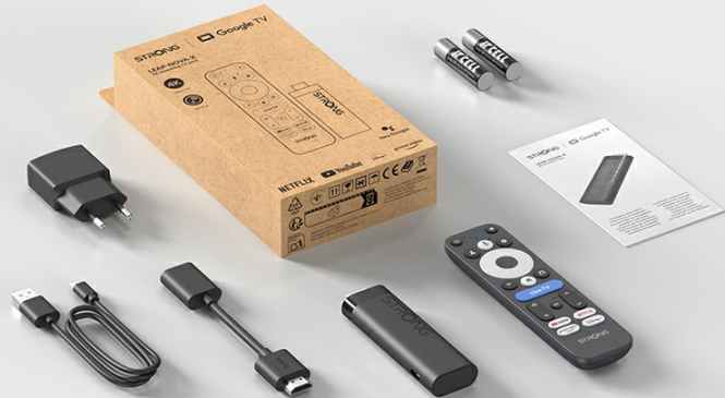
Image: The contents of the STRONG LEAP-NOVA-X TV Stick package, including the TV stick, power adapter, USB-C cable, HDMI extension cable, quick guide, remote control, and AAA batteries.