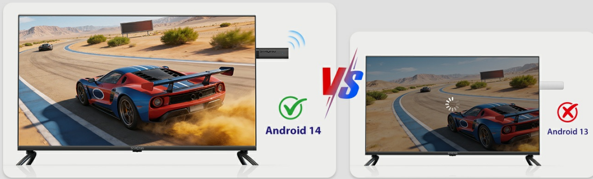
Image: A side-by-side comparison showing the faster performance of Android 14 on the LEAP-NOVA-X TV Stick versus an older Android version, illustrated by a racing game.