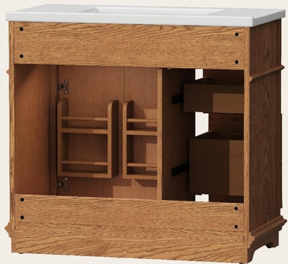
Image: Details of the freestanding vanity, showing the soft-closing door mechanism and the open back design for easy plumbing access.