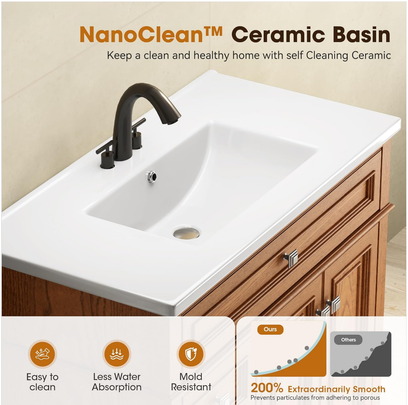
Image: Features of the NanoClean Ceramic Basin, emphasizing its smooth finish for easy cleaning, reduced water absorption, and mold resistance.