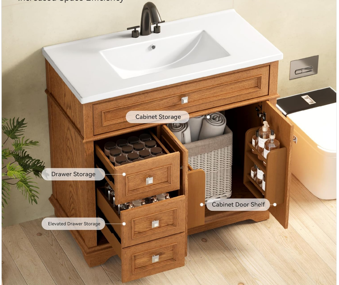
Image: Illustration of the 4-section multifunctional storage, highlighting the cabinet, drawer, and elevated drawer storage options.