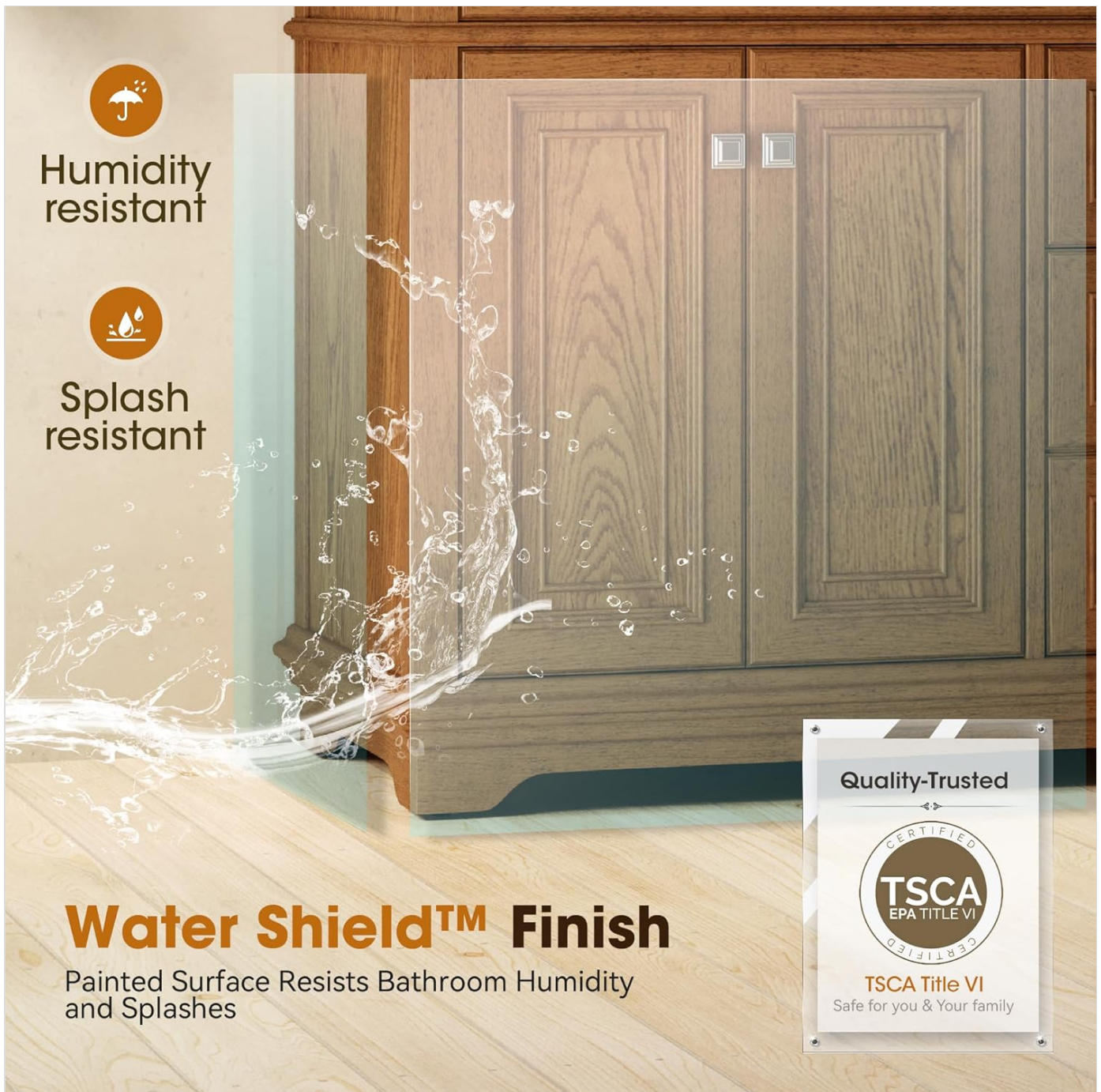
Image: Demonstration of the Water Shield™ Finish, showing its resistance to humidity and splashes, along with TSCA Title VI certification.