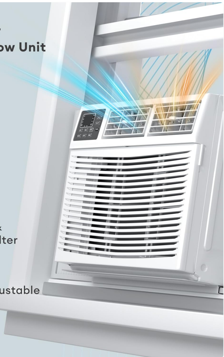
Image: A detailed view of the TABU AC unit highlighting its key features: Eco Mode, 0.5-24H Timer, Removable & Washable Filter, and 4-speed Adjustable Wind Speed.