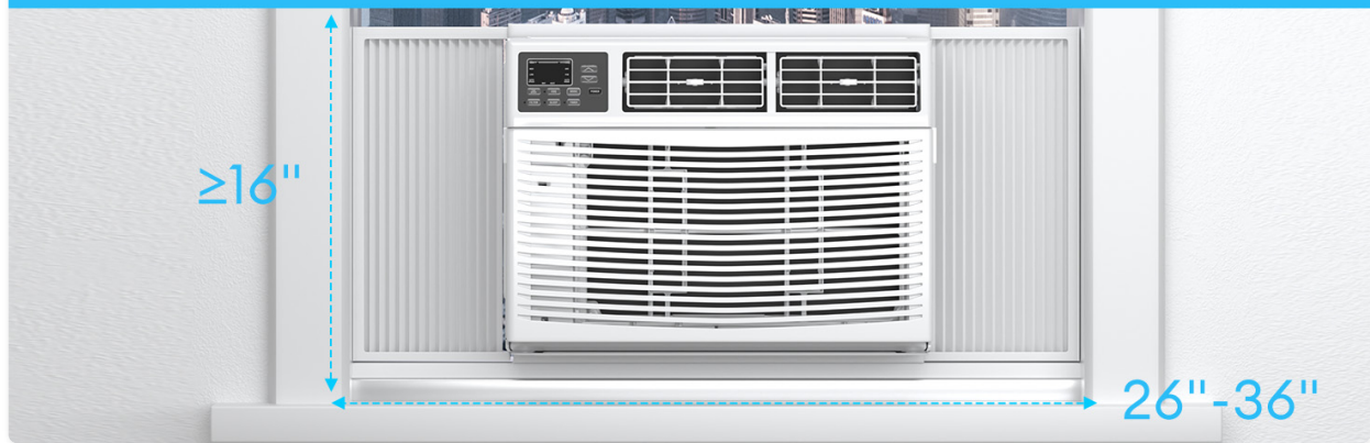
Image: A visual guide illustrating the minimum height ( \geq 16'' ) and width range (26''-36'') required for window installation of the AC unit.