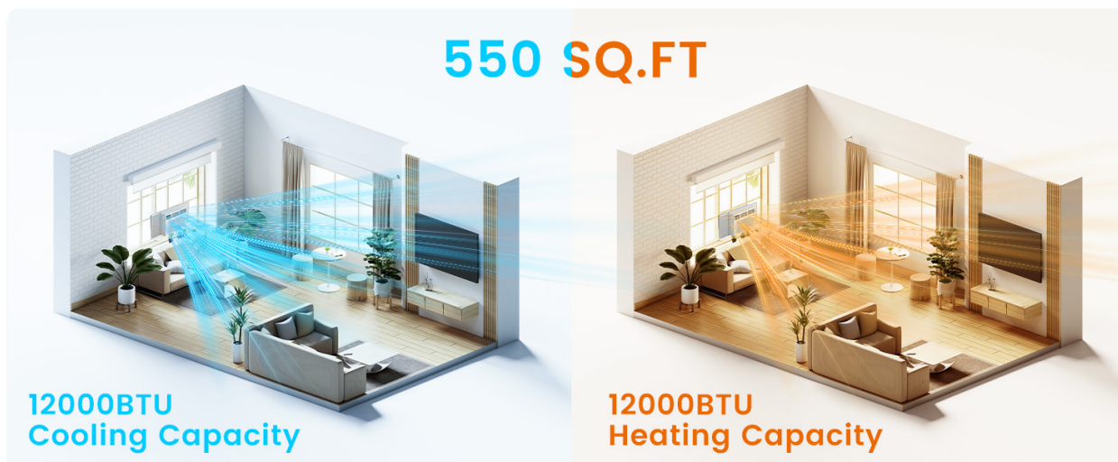
Image: A visual representation of the TABU 4-in-1 Window Air Conditioner's capabilities, showing how it dehumidifies, circulates air as a fan, cools down to 61°C, and heats up to 88°C.