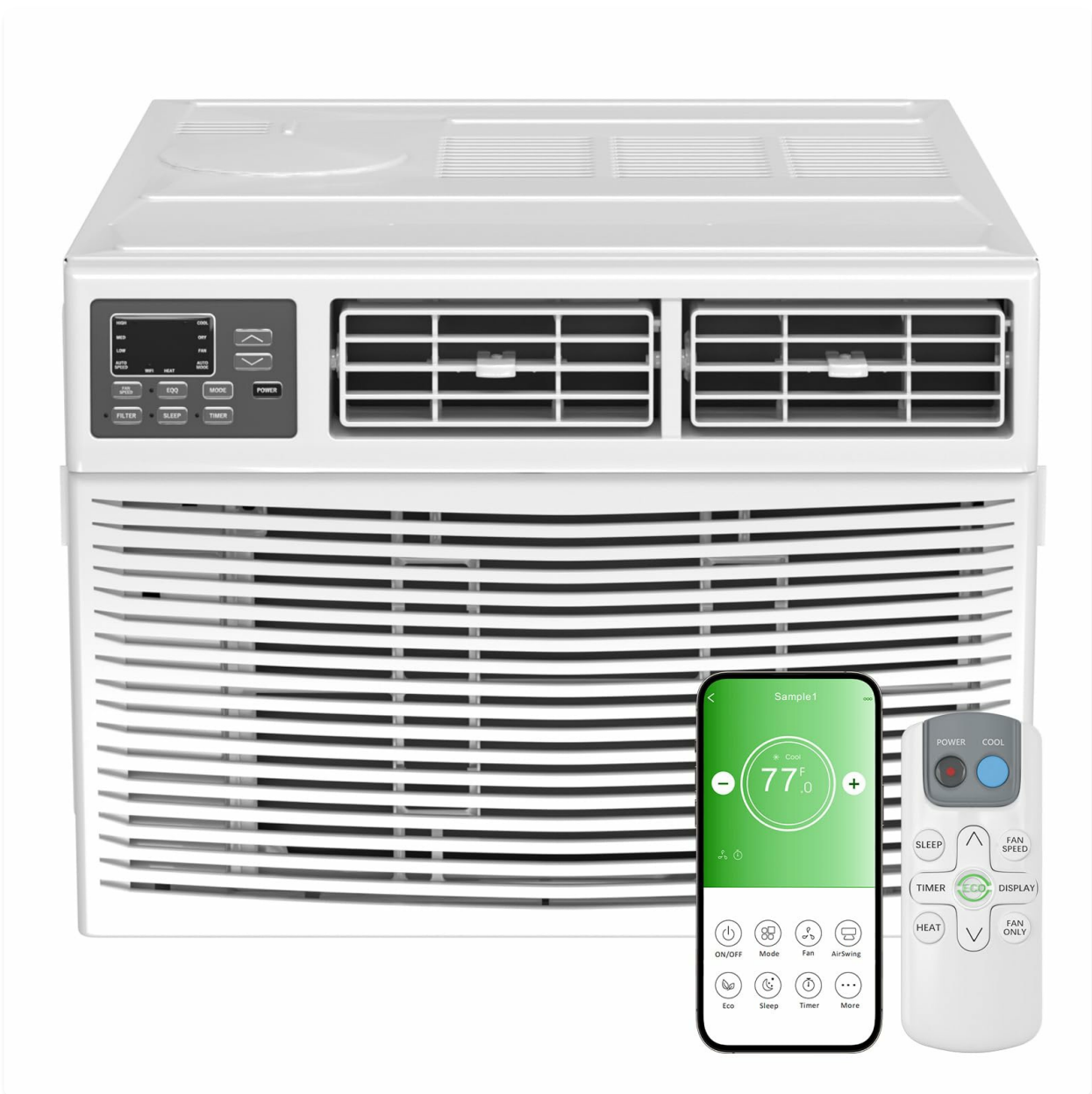
Image: The TABU 12000 BTU Window Air Conditioner unit, shown installed in a window, demonstrating its compact design.