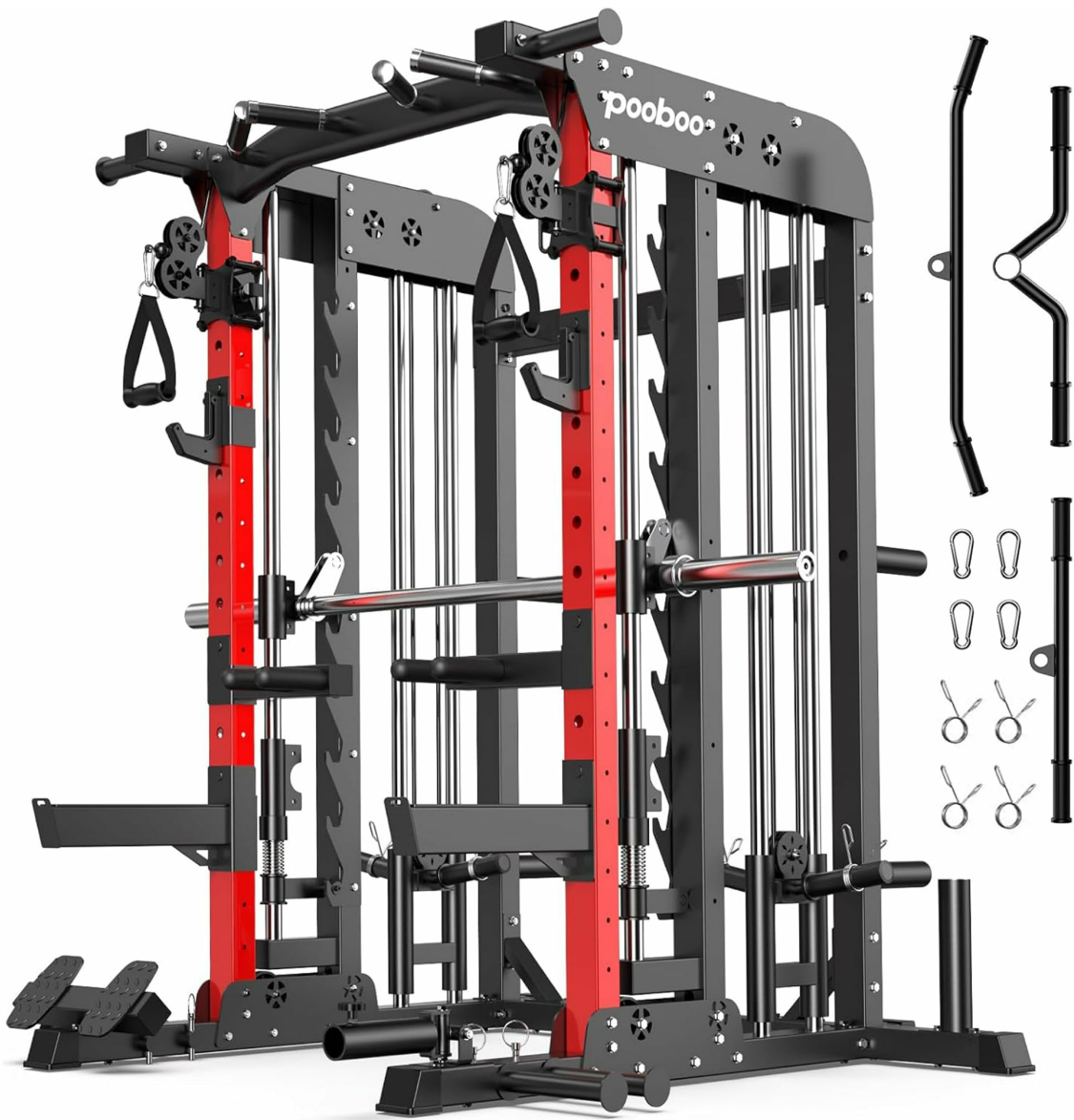
Figure 1: The pooboo P43 01 Multi-Functional Power Cage, showcasing its robust design and integrated features.