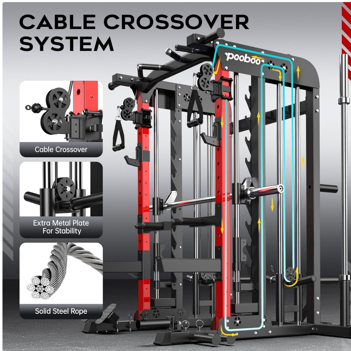
Figure 4: Diagram illustrating the cable routing and functionality of the dual pulley cable crossover system.