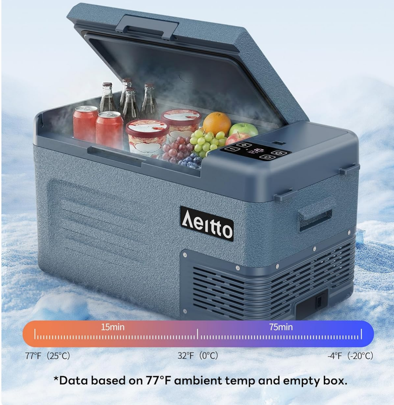
Image: Visual representation of the fast cooling capability.

6. Low Noise Operation: The refrigerator operates at a minimal noise level of less than 45dB, ensuring quiet use during travel or rest.