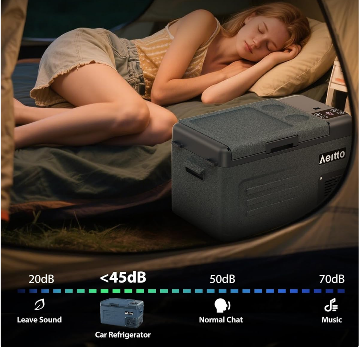
Image: The car refrigerator operating quietly in a camping environment.