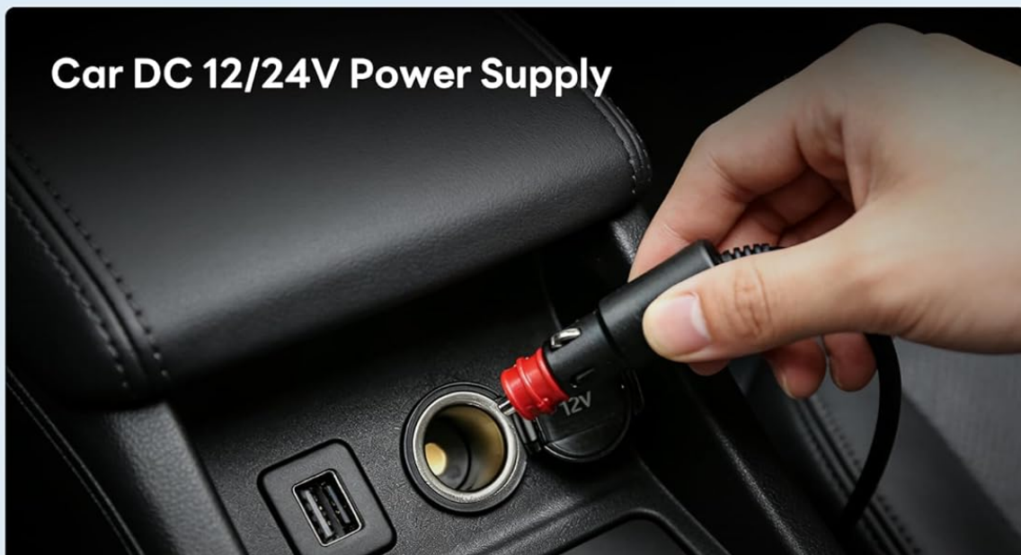
Image: The car refrigerator connected to both indoor AC and car DC power sources.

2. Initial Placement: Place the refrigerator in a well-ventilated area. When using in a vehicle, ensure it is securely fastened using the integrated tie-down points to prevent movement during transit.